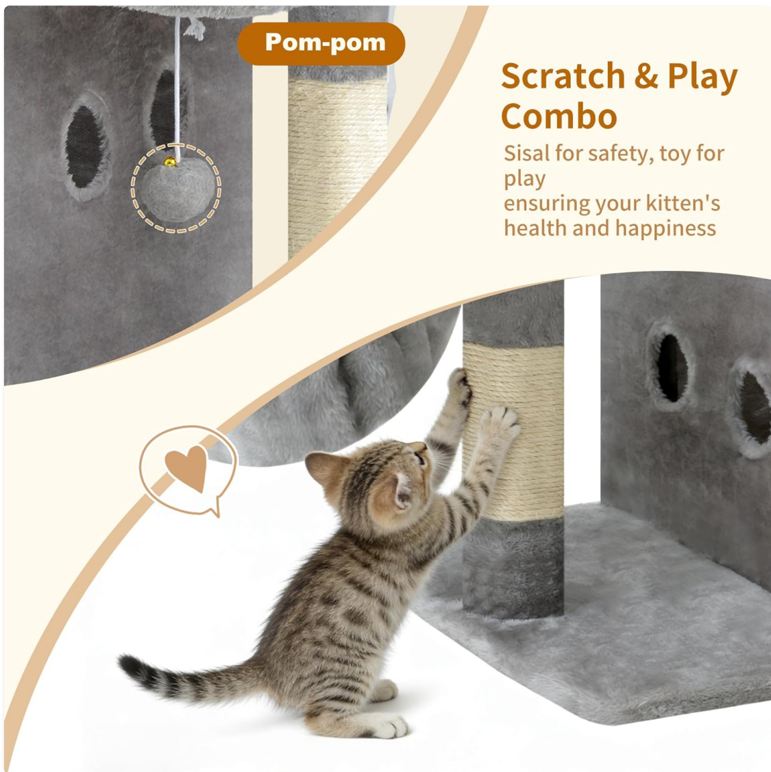
Image: Kitten interacting with the scratching post and pom-pom.