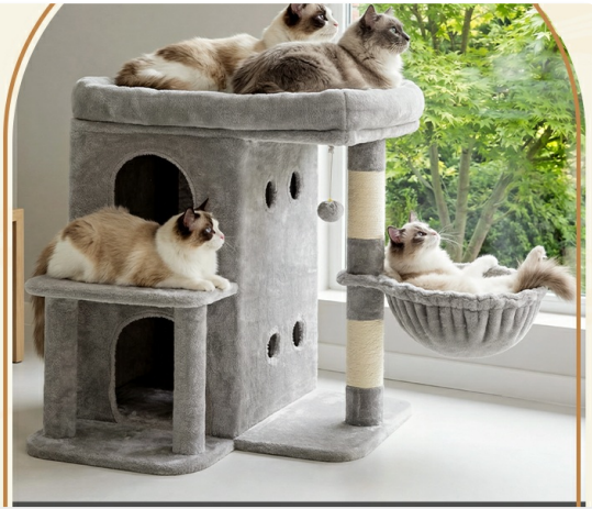
Image: Visual representation of product specifications and included items.