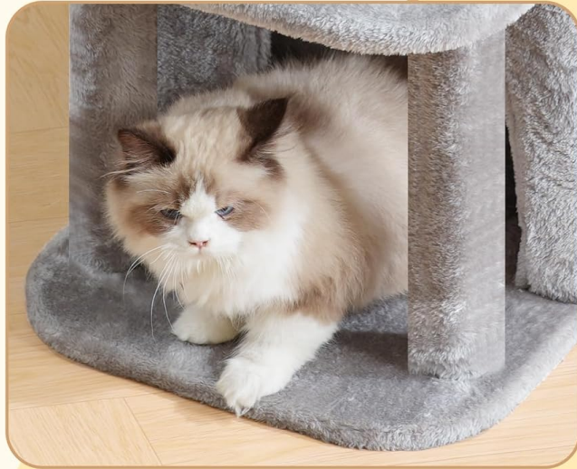
Image: Close-up of the double-decker cat condo.