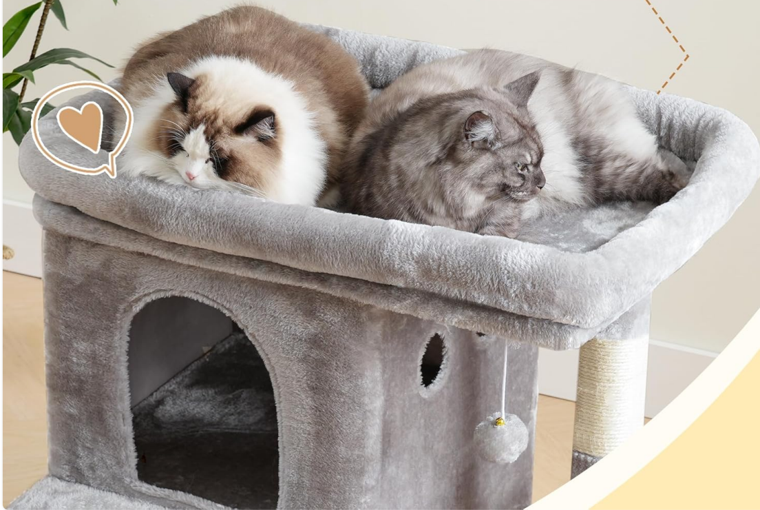
Image: Cats enjoying the cozy top perch.