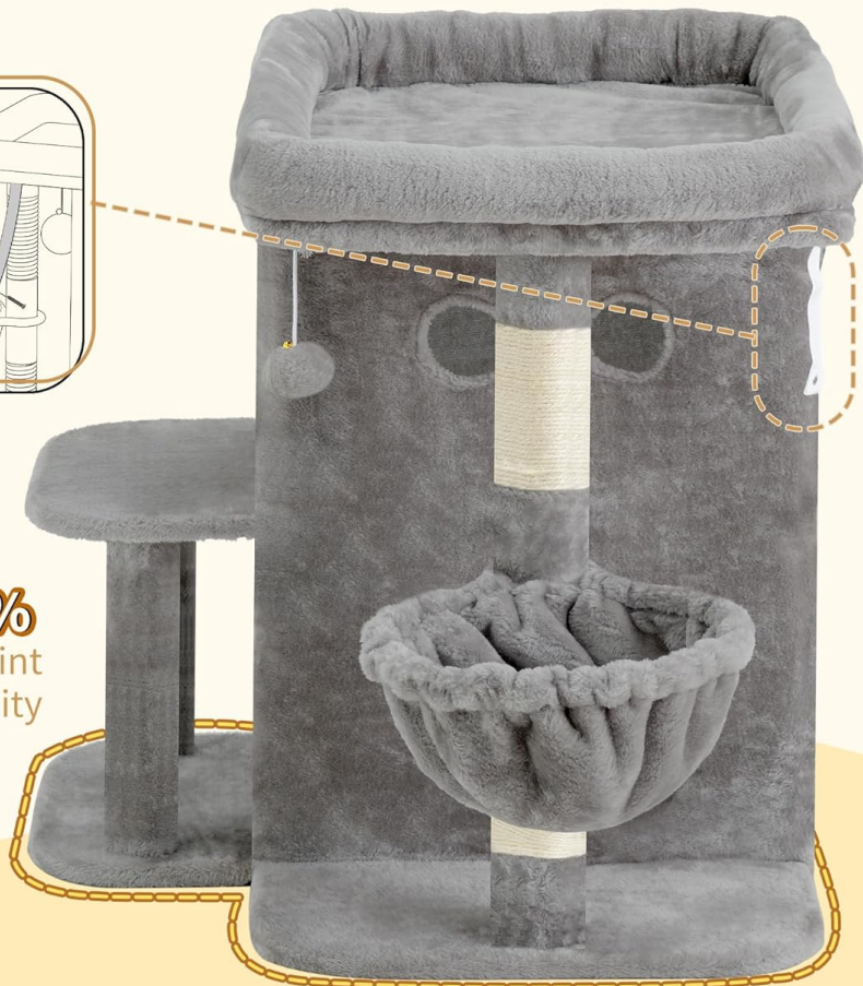
Image: Diagram illustrating the use of a wall anchor for enhanced stability.

50% Larger Footprint for Enhanced Stability