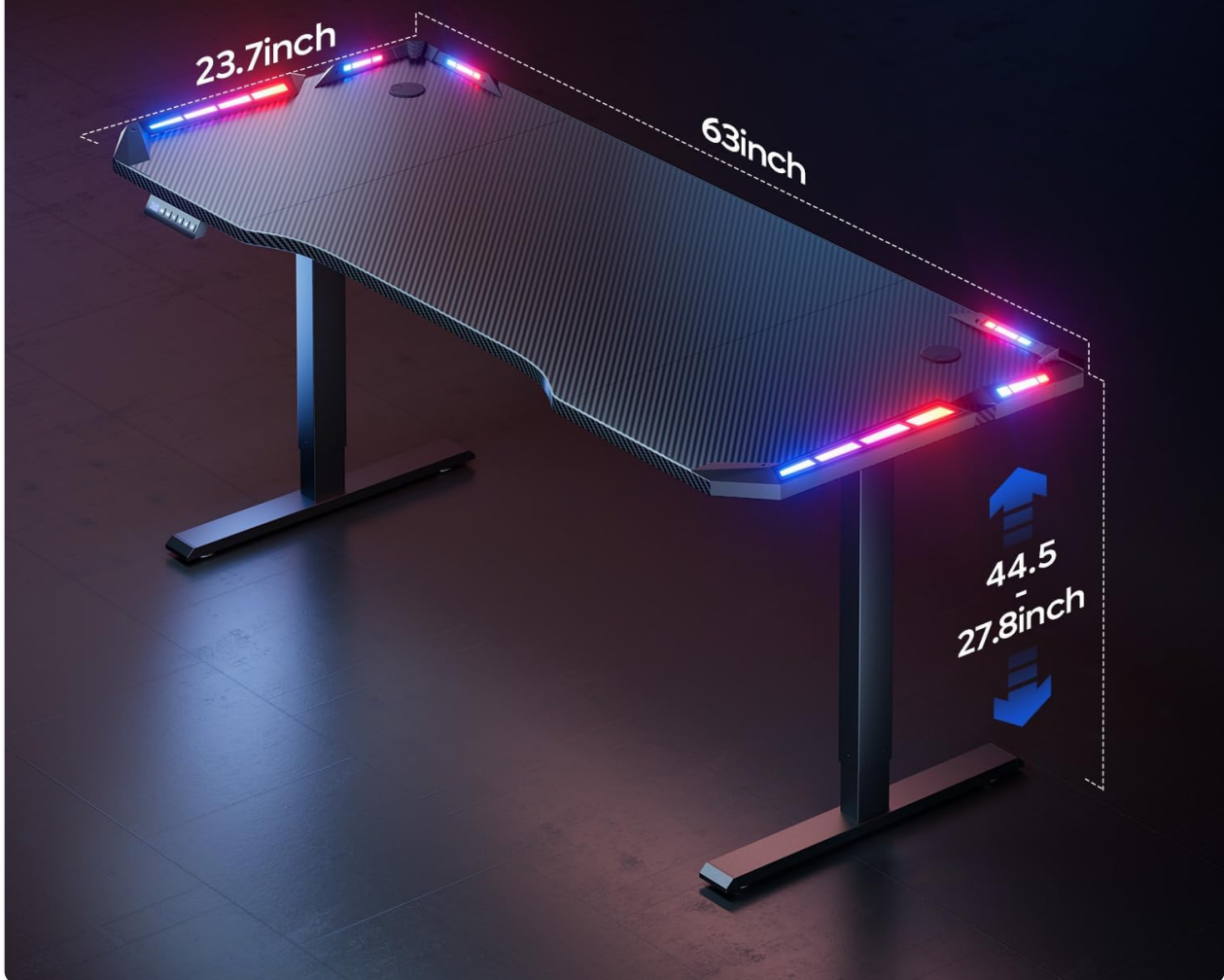
Image Description: This diagram illustrates the dimensions of the HLDIRECT 63-inch gaming desk, including its length (63 inches), depth (23.7 inches), and adjustable height range (27.8 to 44.5 inches).

Select the product size that best suits your usage scenario