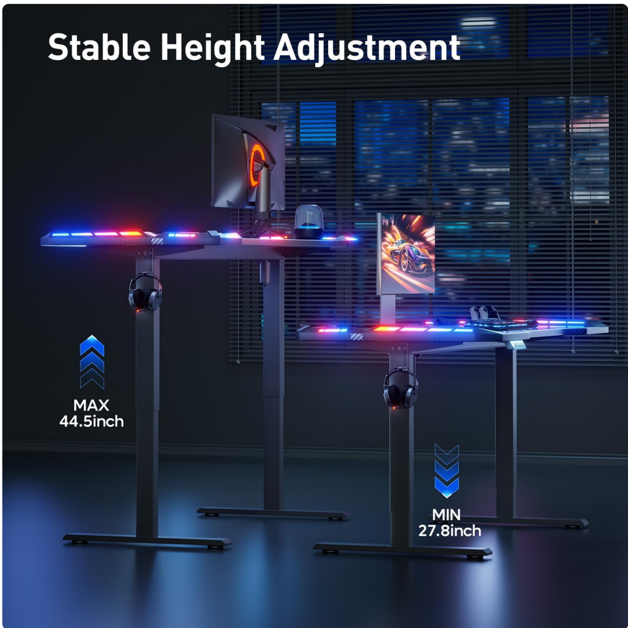
Image Description: This image displays the HLDIRECT gaming desk at its lowest (27.8 inches) and highest (44.5 inches) adjustable positions, demonstrating its stable height adjustment mechanism.