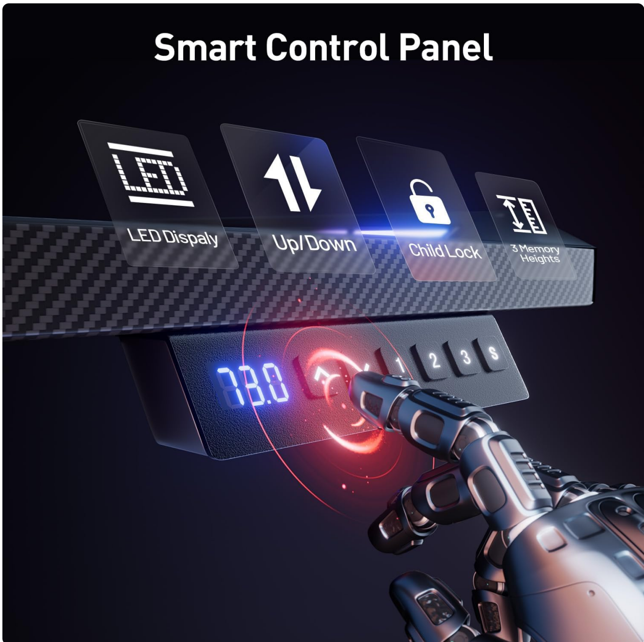
Image Description: A close-up view of the smart control panel on the HLDIRECT gaming desk, showing buttons for LED display, up/down adjustment, child lock, and three memory height settings.