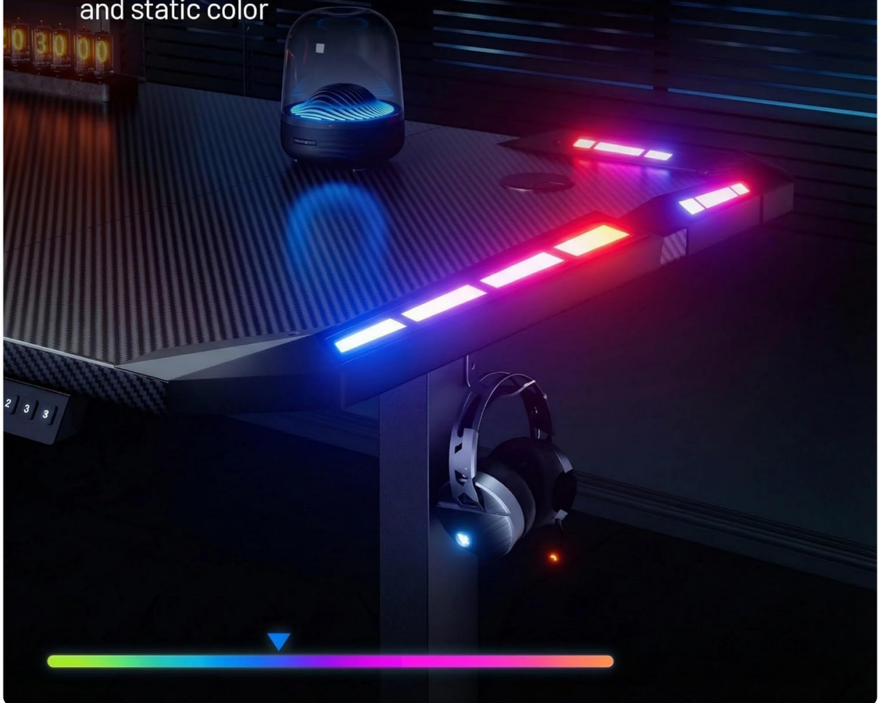
Image Description: This image highlights the integrated LED lights on the HLDIRECT gaming desk, showcasing their vibrant colors and how they enhance the gaming ambience.

Customize your gaming ambience with a variety of lighting effects including multi-color gradient, single-color cycling, and static color