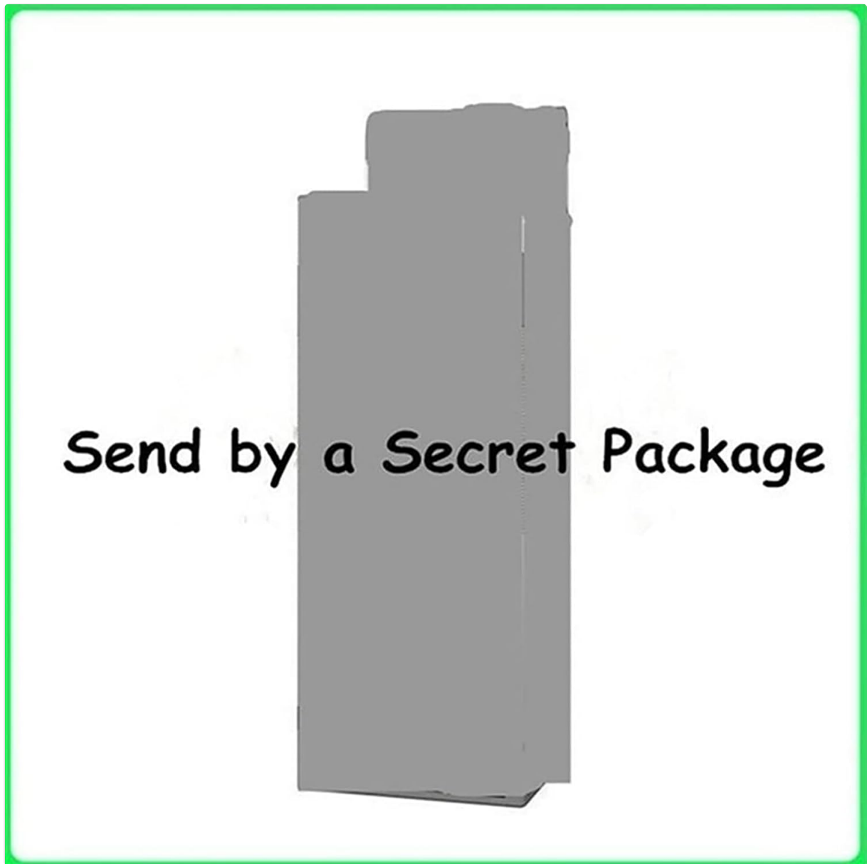
Figure 1: The companion is shipped in a discreet package to ensure privacy.