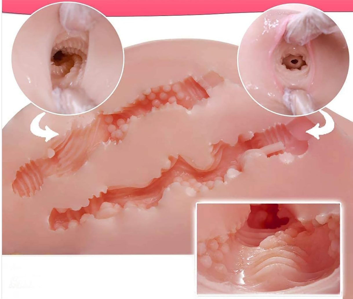
Figure 3: Detailed view of the companion's 3D lifelike vaginal and anal structures. These passages are designed with internal textures for a realistic experience.