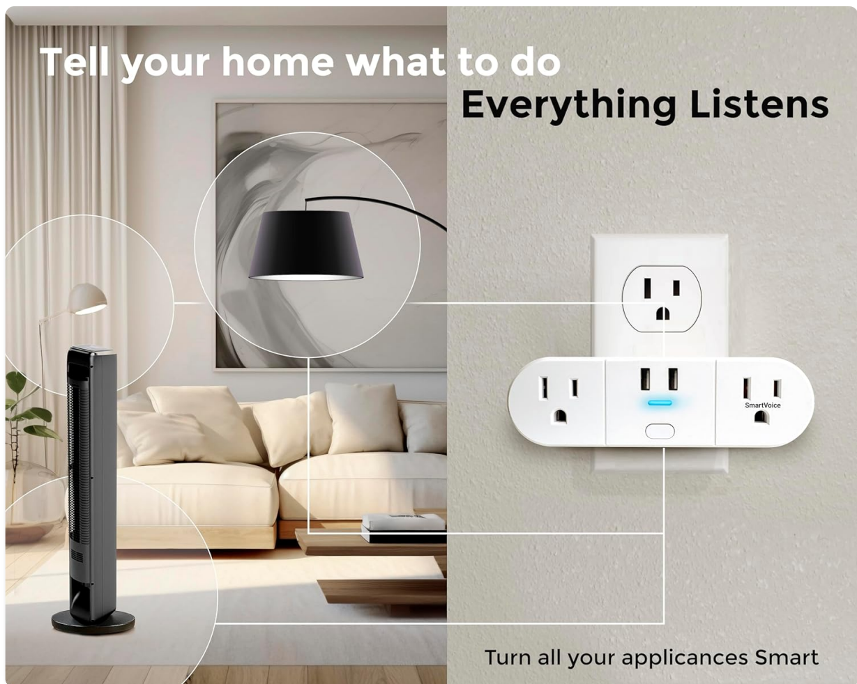
Image: The Emerson SmartVoice Wall Plug plugged into a wall, illustrating its use with a floor lamp and a tower fan, showing how it integrates into a living space to control appliances.