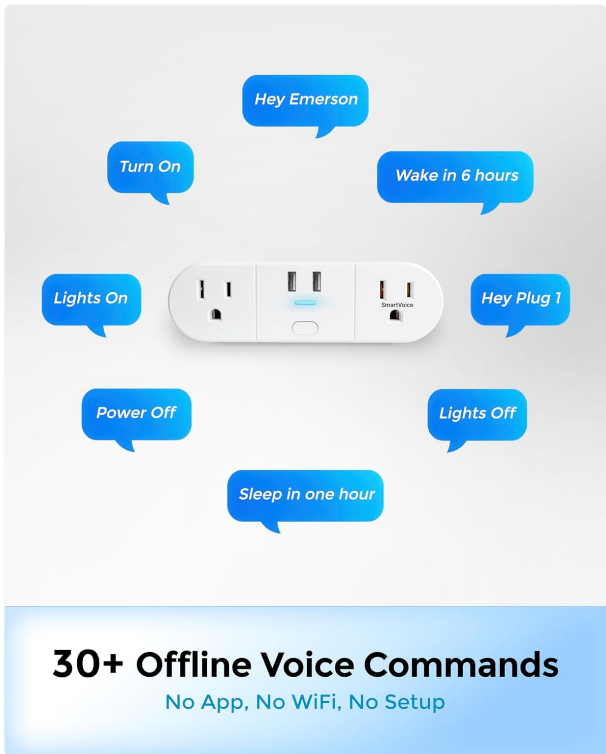
Image: A visual guide to common voice commands for the Emerson SmartVoice Wall Plug, including commands for turning devices on/off and setting timers.