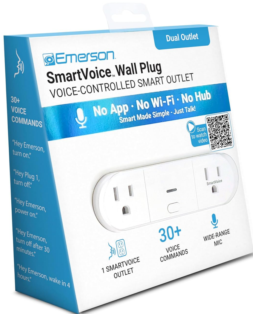
Image: The retail packaging for the Emerson SmartVoice Wall Plug, displaying the product and highlighting features like '30+ Voice Commands' and 'No App, No Wi-Fi, No Hub'.