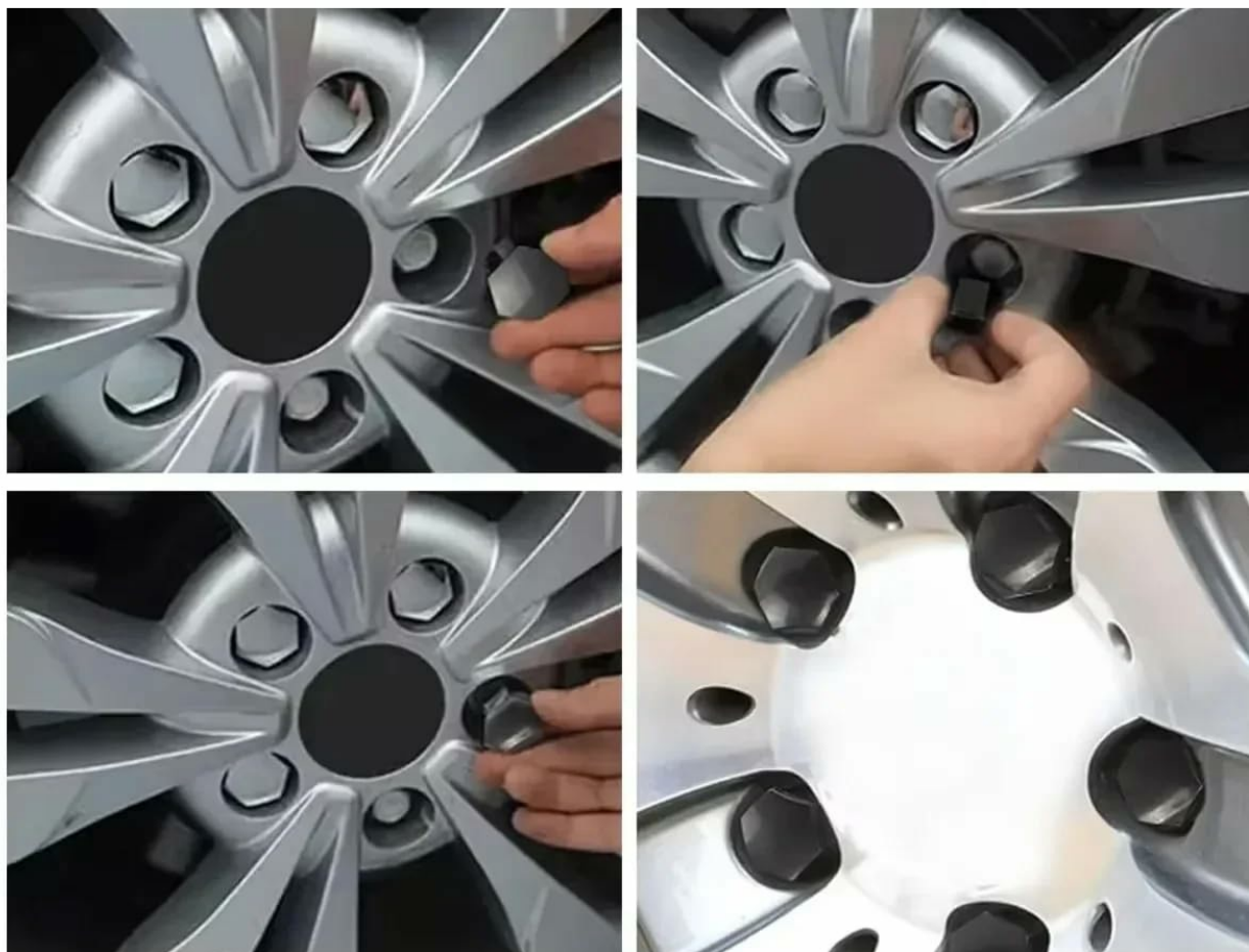
Image: Visual guide demonstrating the installation process of the wheel nut covers.