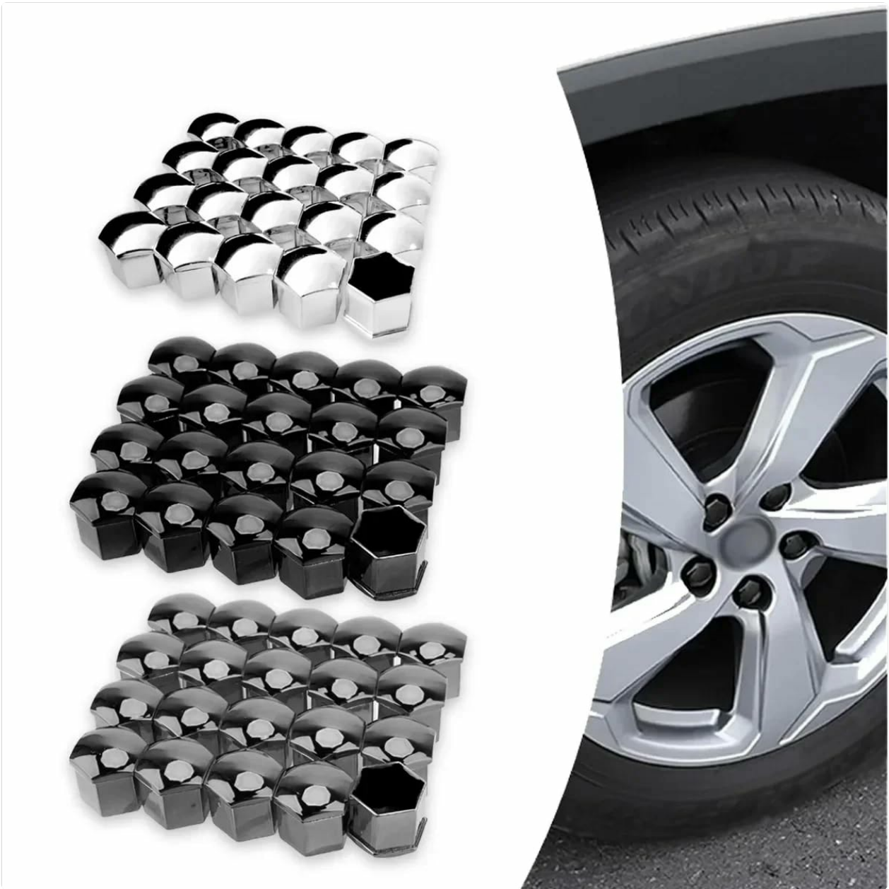
Image: Various colors and sizes of wheel nut covers, with an example of a car wheel where they would be installed.