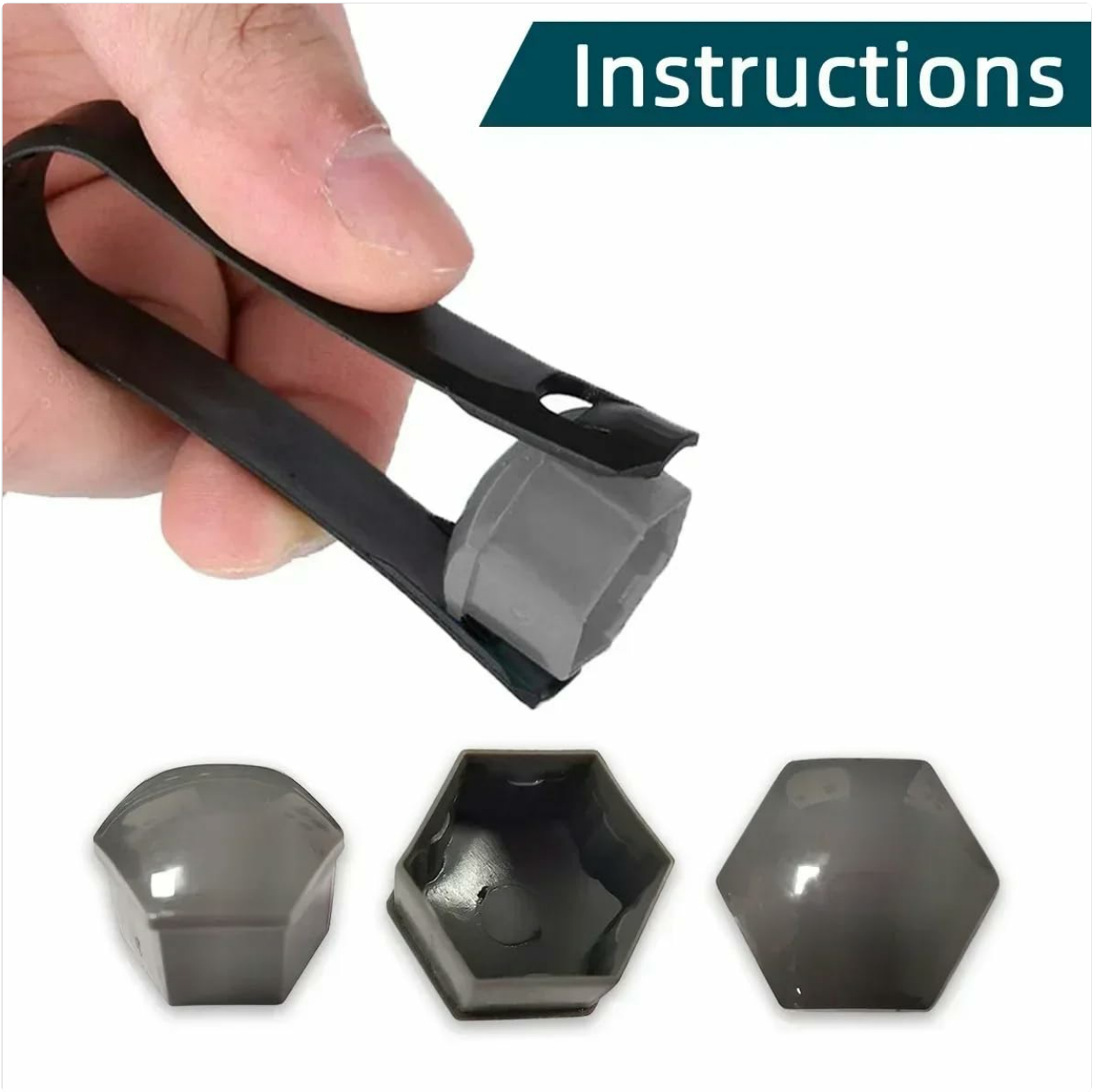
Image: The specialized removal tool and various wheel nut covers.