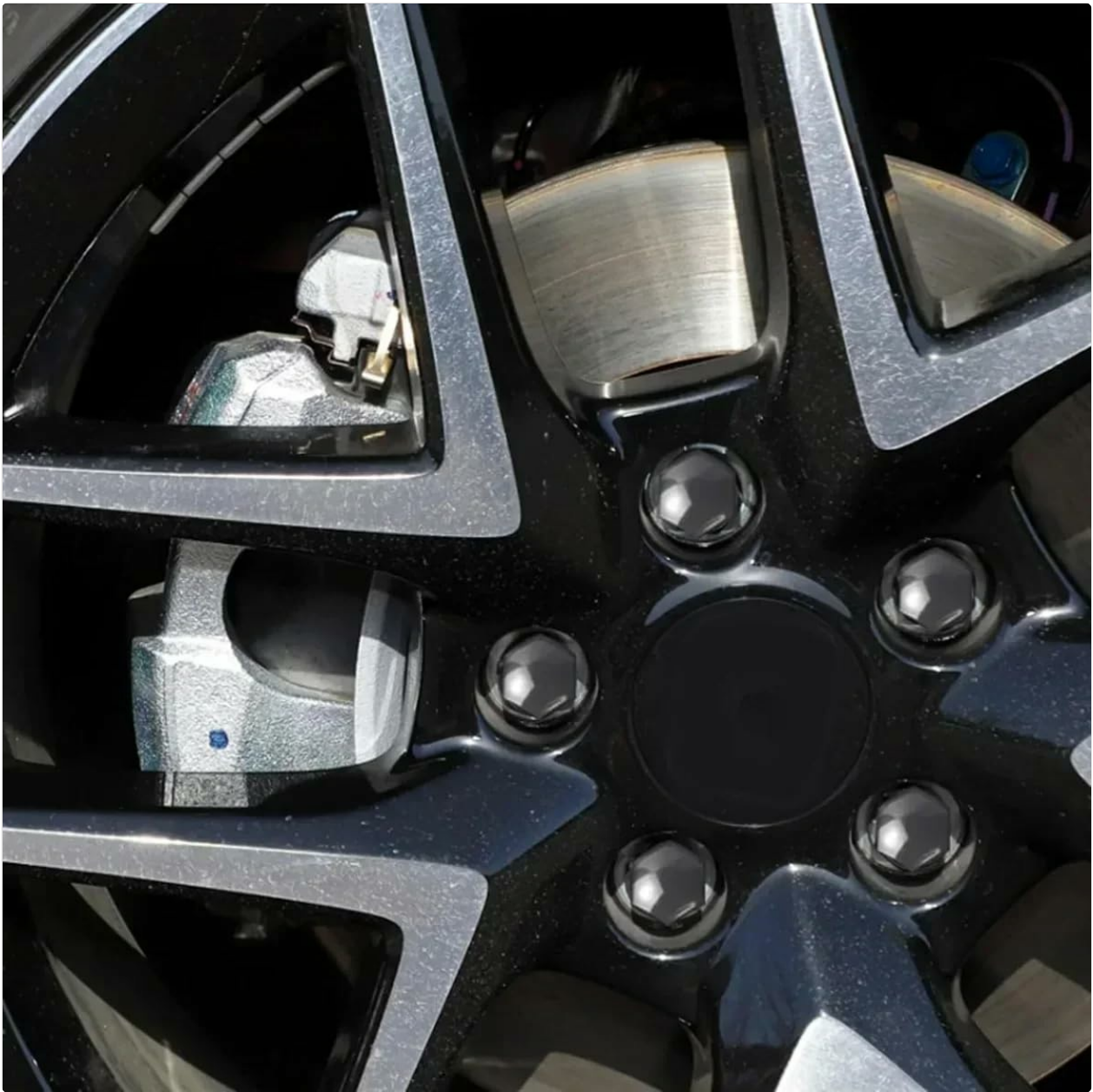
Image: Wheel nut covers fully installed on a car wheel.