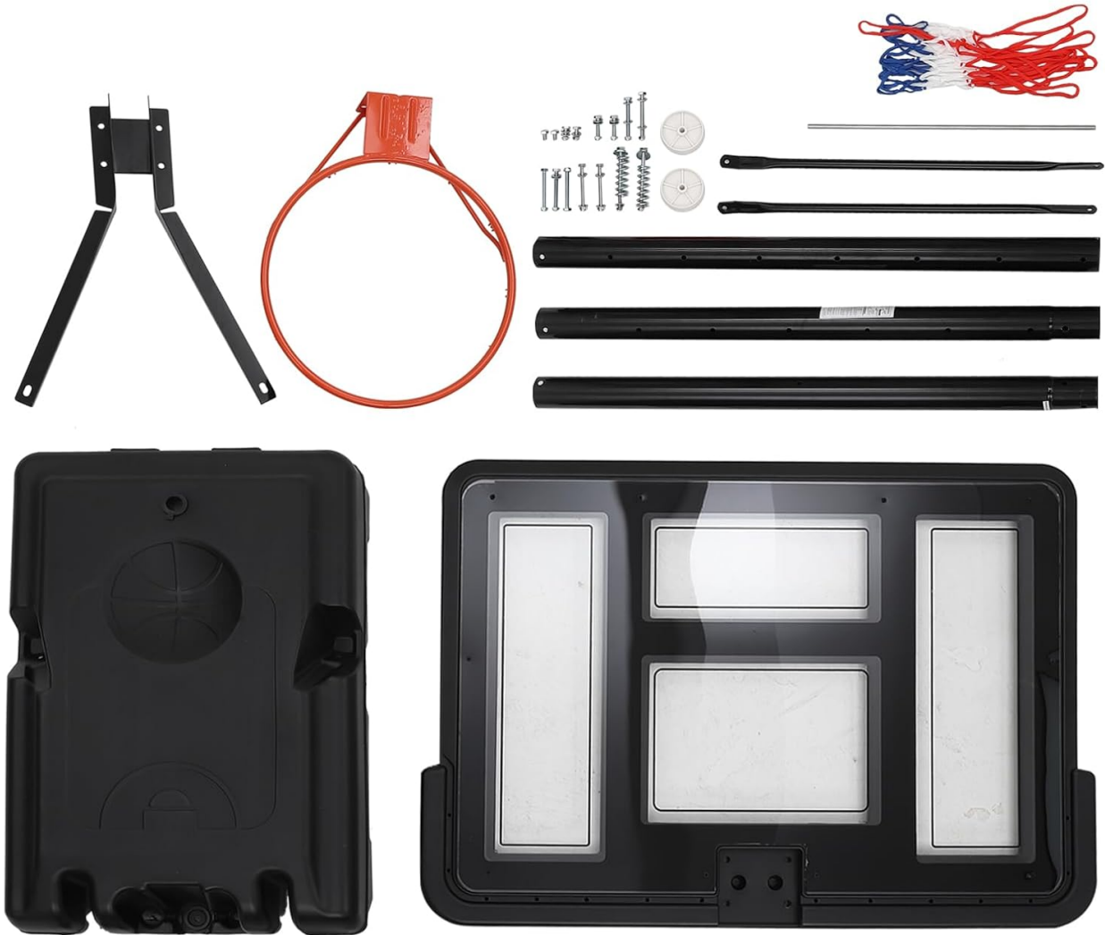
Image: All components included for assembly.