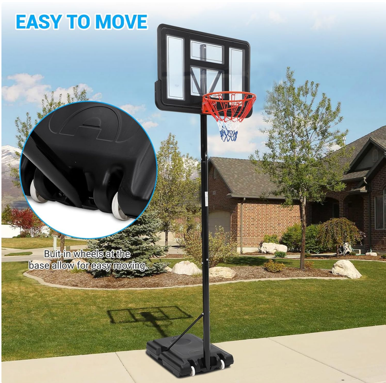
Image: Built-in wheels for easy movement.