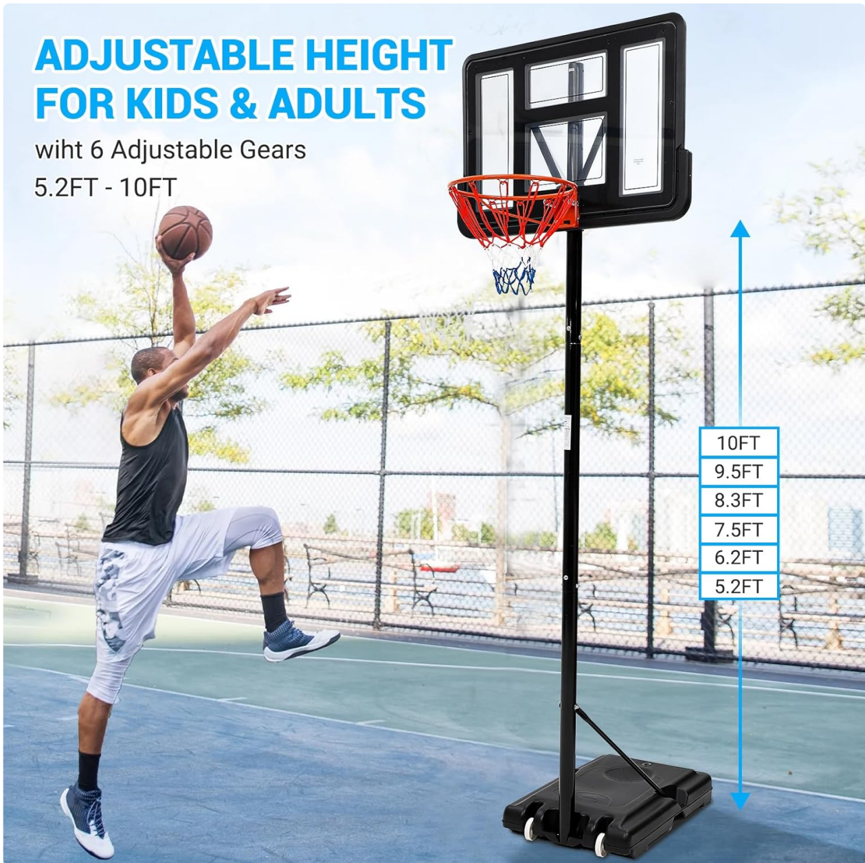
Image: Adjustable height settings for the basketball hoop.