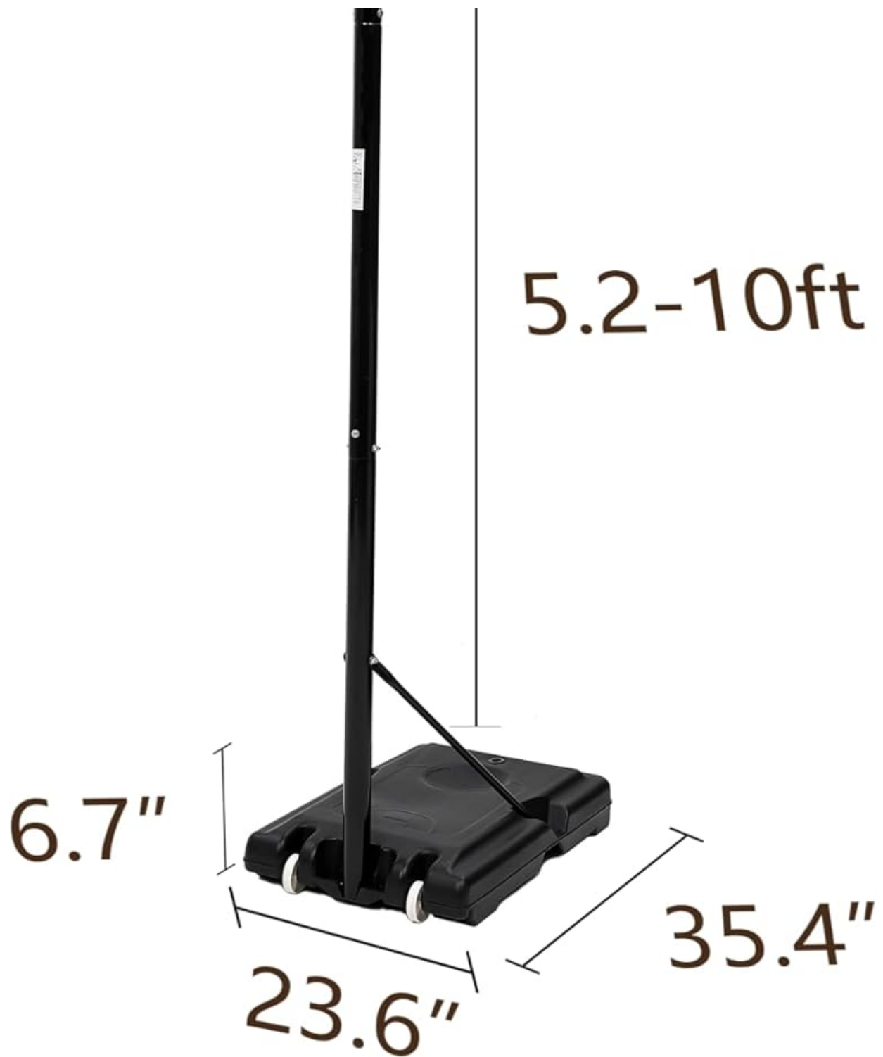
Image: Product dimensions and adjustable height range.