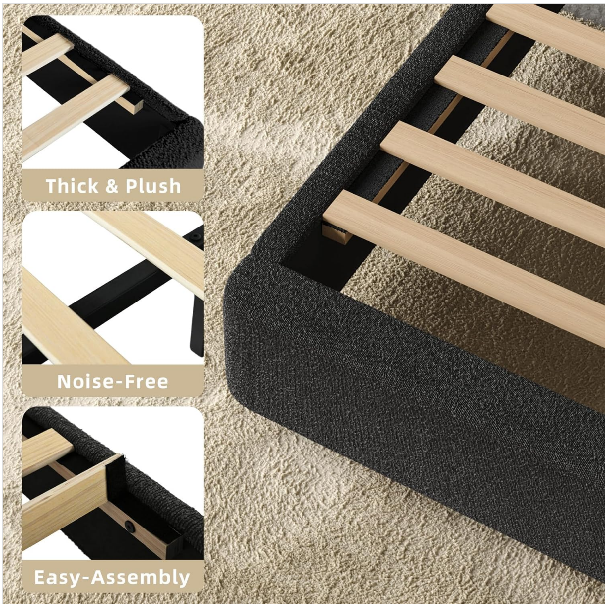
Image: Detail of wood slats and noise-free design.