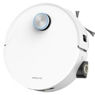
Robot Vacuum x1