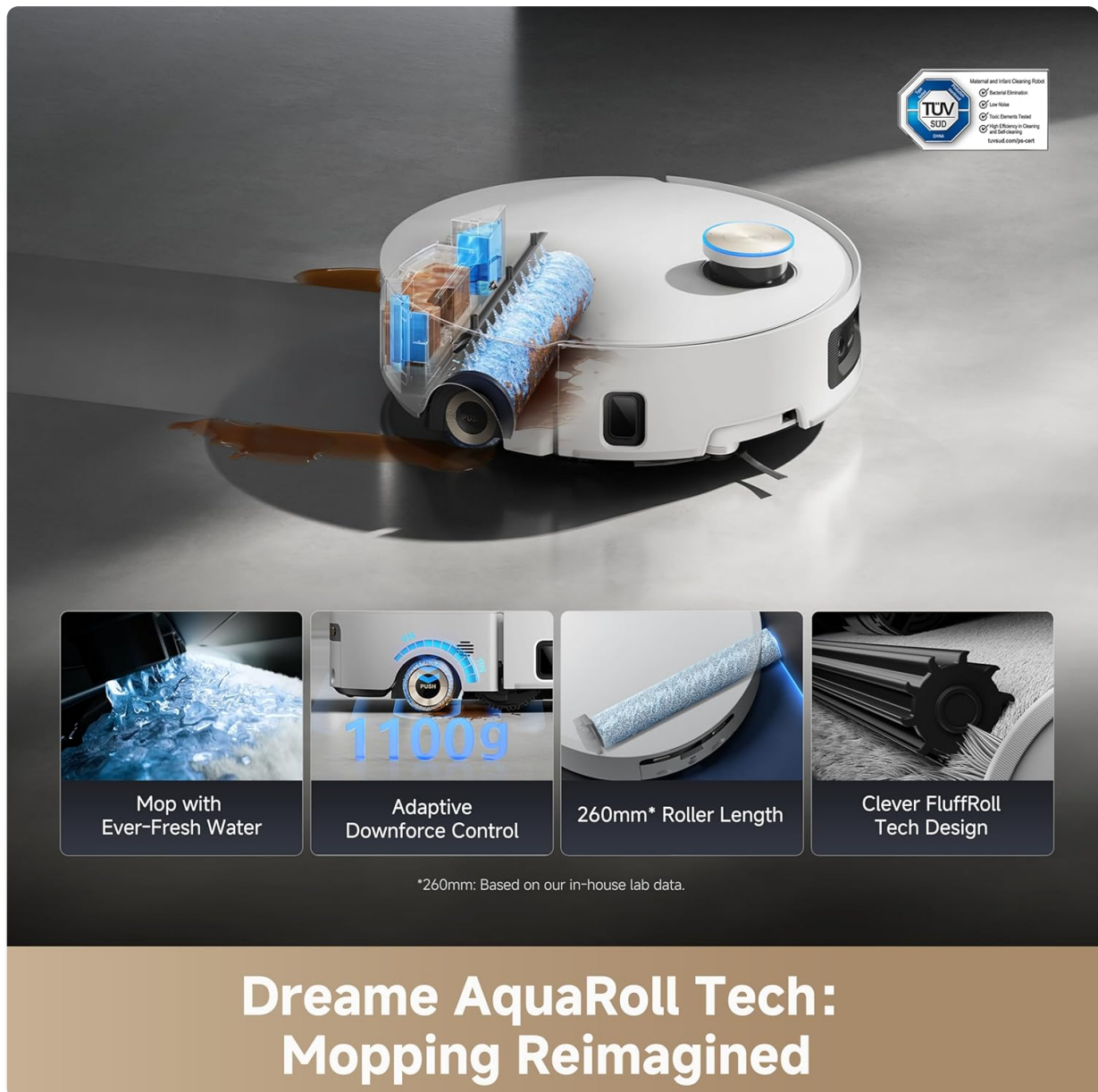
Image Description: The DREAME Aqua10 Ultra Roller Robot Vacuum and Mop in white, showcasing its sleek design and advanced features for both vacuuming and mopping.