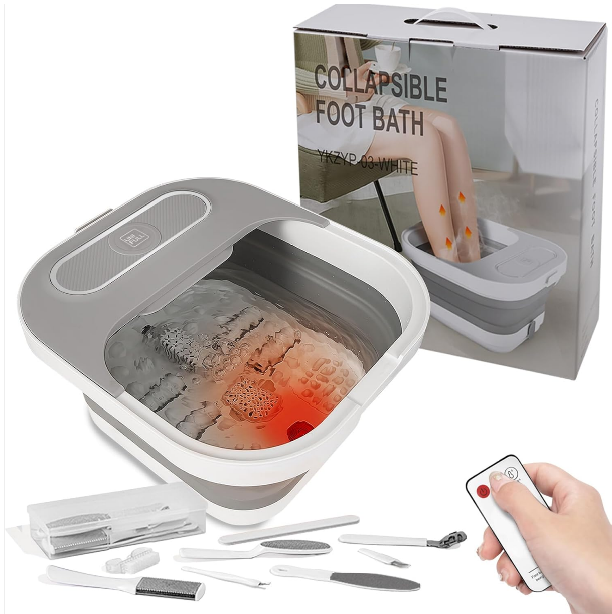
Image 1.1: The UNIFULL Foot Spa Bath, remote control, and included pedicure kit.