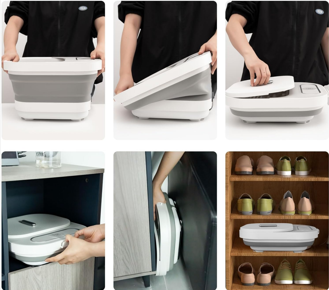
Image 4.1: Step-by-step visual guide demonstrating the expansion of the collapsible foot spa bath from its compact state to its full operational size.