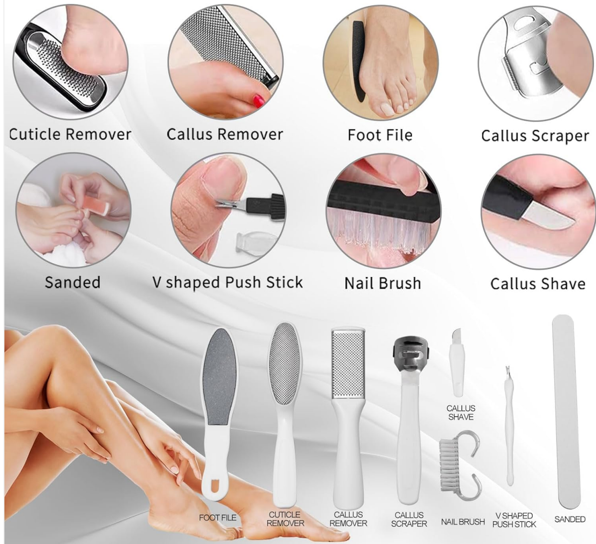
Image 6.1: Detailed view of the pedicure kit components, which include a foot file, cuticle remover, callus remover, callus scraper, nail brush, V-shaped push stick, and callus shave.