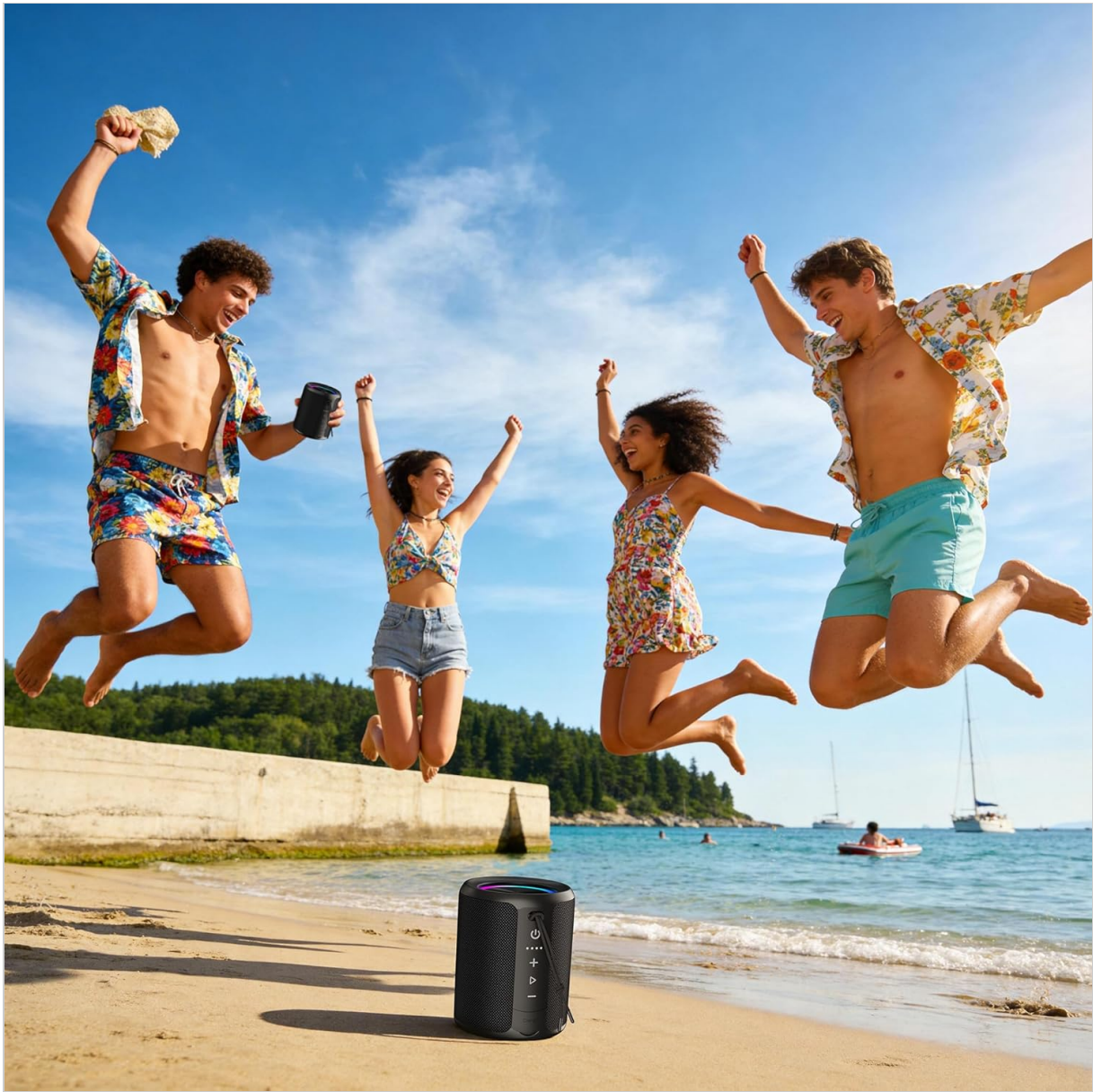
Figure 5.1: Speaker demonstrating its IPX7 waterproof capability in various environments.

Your browser does not support the video tag.