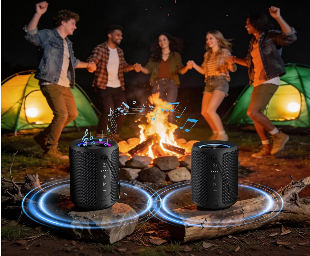
Figure 4.2: Speaker showcasing its dynamic RGB lighting feature.

TWS Wireless Pairing for Wider Soundstage