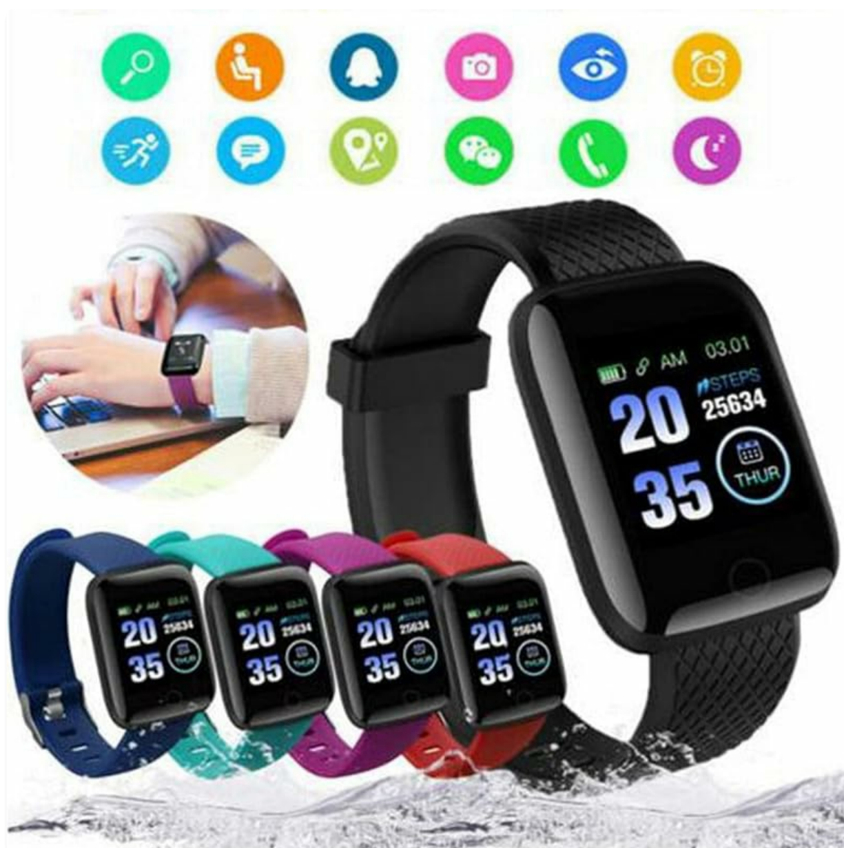
Image: A display of multiple Gionee P15 Pro Smart Watches in various strap colors, accompanied by icons representing different smart watch functions and applications.