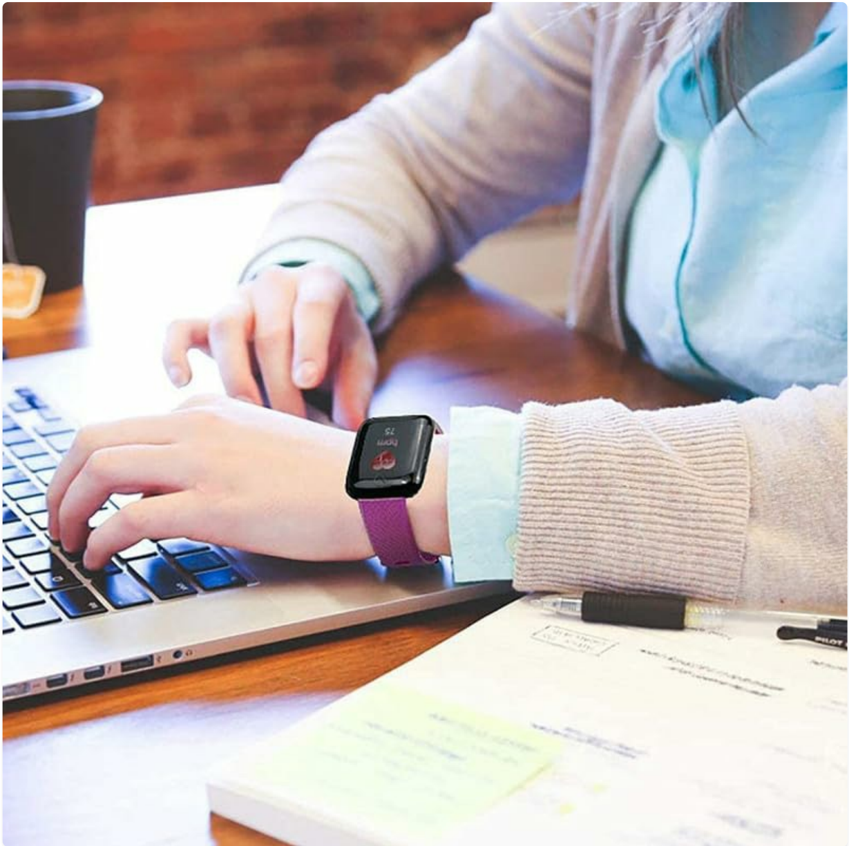
Image: A person wearing the Gionee P15 Pro Smart Watch on their wrist while actively typing on a laptop, highlighting its comfort for daily use.