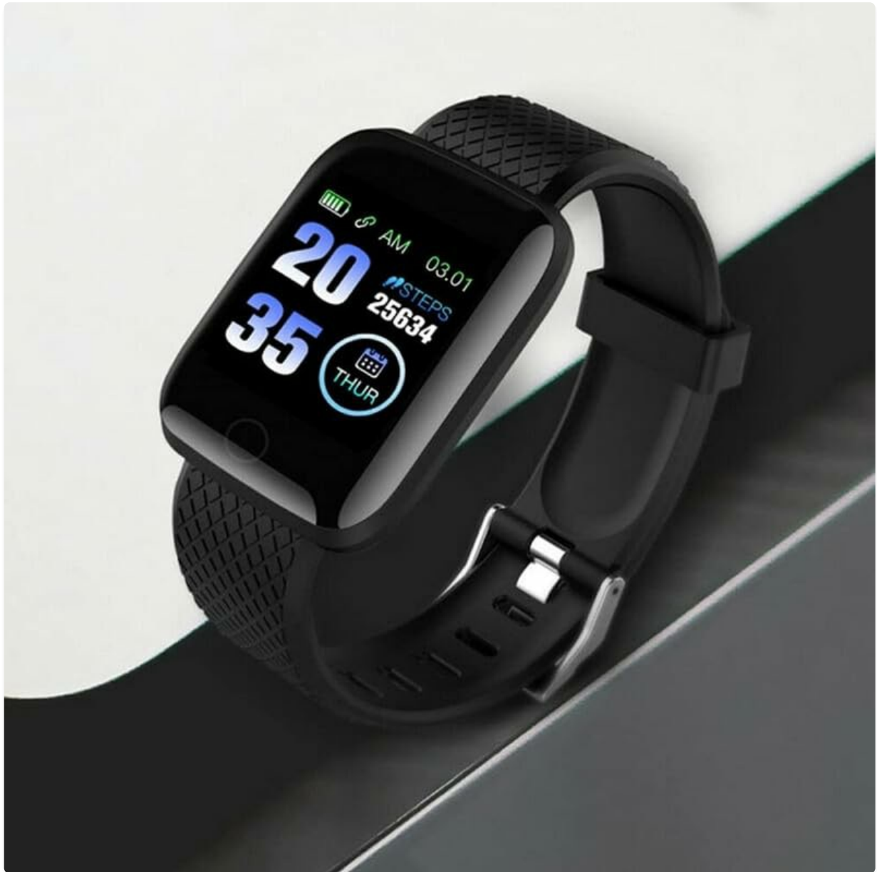
Image: A close-up view of the Gionee P15 Pro Smart Watch, showcasing its display with time and step tracking information.