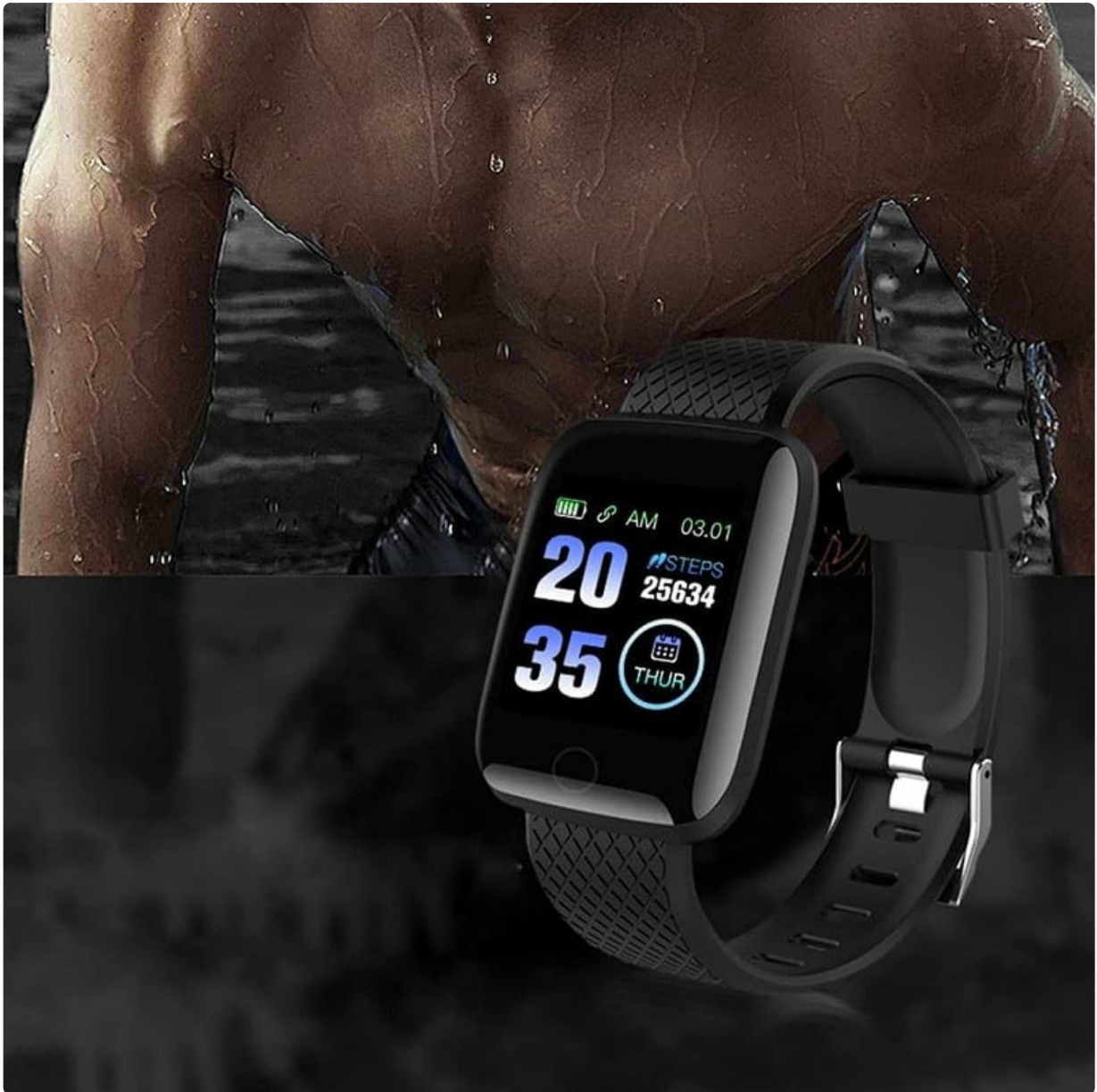
Image: The Gionee P15 Pro Smart Watch worn on a wrist, showing the time, date, and step count on its display.