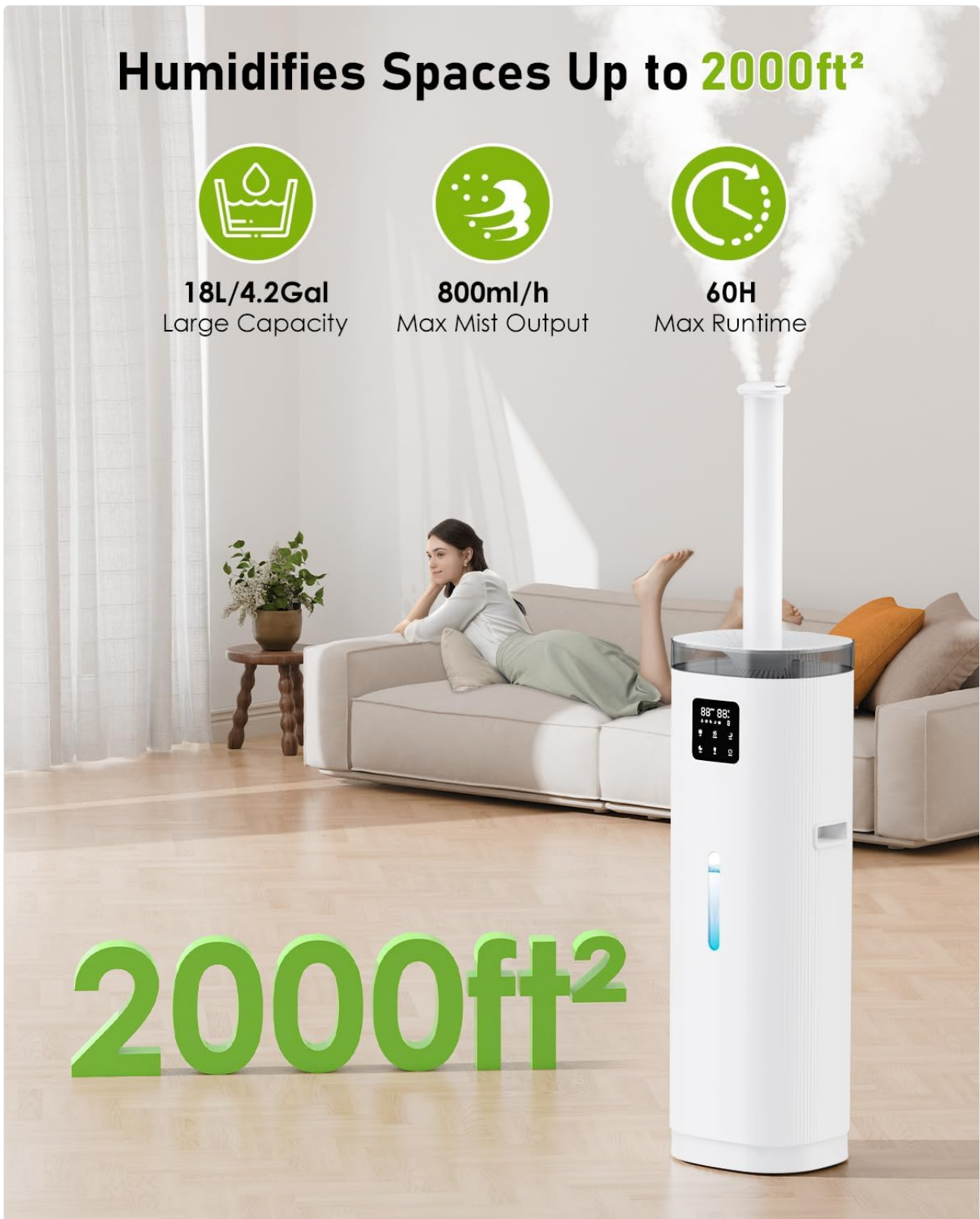
Figure 3.1: Overall view of the OEARE BZT-161 Humidifier with the extension tube installed. The unit is white with a clear water level indicator on the front and a digital display panel.

Familiarize yourself with the components of your OEARE BZT-161 Humidifier.