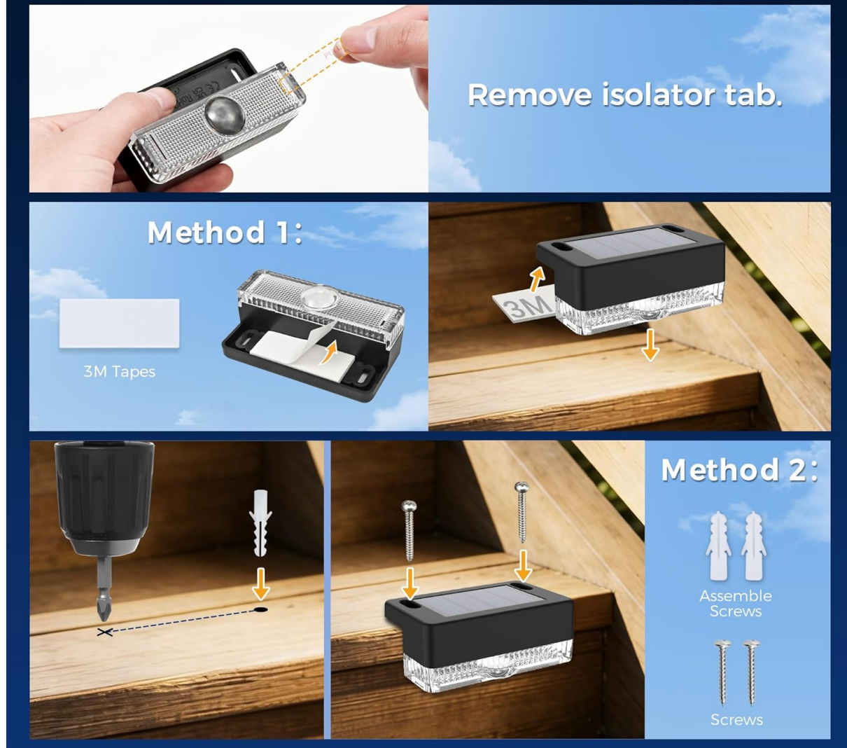
Figure 2: Two methods for installing the solar deck lights.

This diagram visually explains both the adhesive and screw-based installation methods, making it easy to choose the best option for your surface.