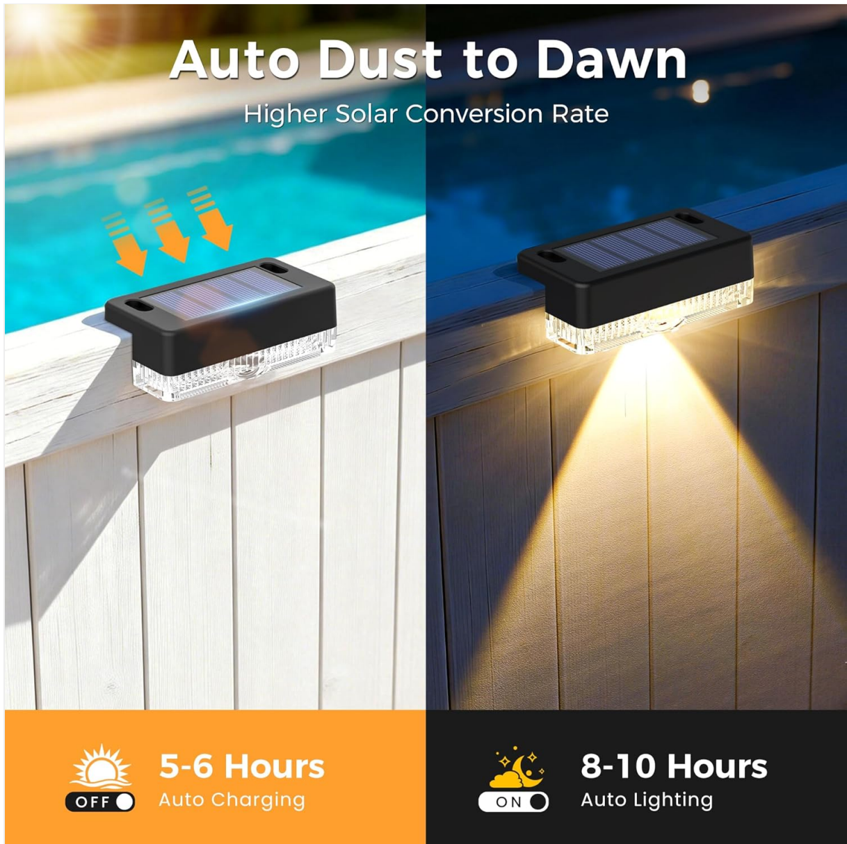
Figure 1: Solar light charging during the day and automatically turning on at night.

This image illustrates the automatic charging process during daylight hours and the subsequent illumination at night, highlighting the efficient solar panel.