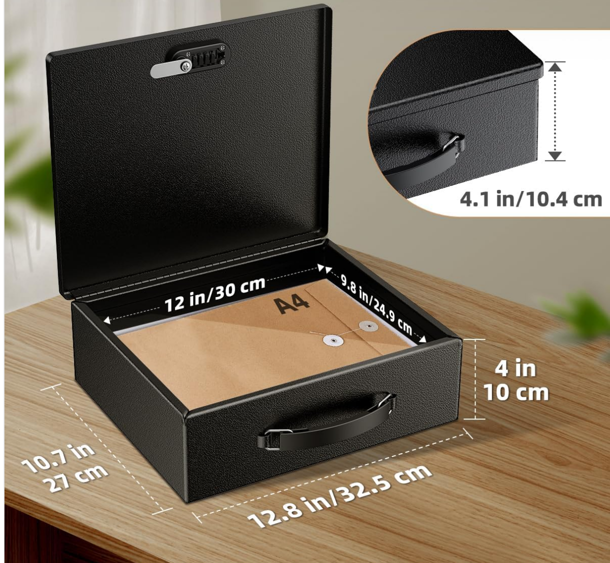
Image: The document box open, illustrating its large capacity suitable for A4 documents. Key dimensions are shown: 12.8 inches (32.5 cm) length, 10.7 inches (27 cm) width, and 4 inches (10 cm) height. The lid depth is 4.1 inches (10.4 cm).

Accommodate A4 and letter-sized papers without folding