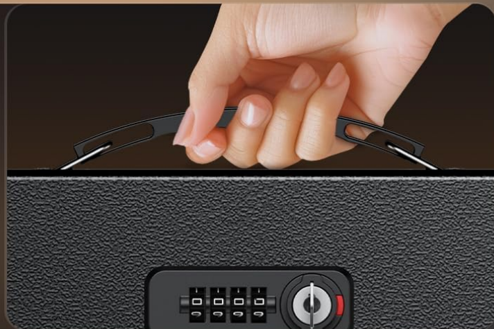
Image: A composite image highlighting key features: the combination and key lock for security, the soft felt mat inside to prevent scratches, and the ergonomic handle for comfortable portability.

Provide a firm, comfortable grip at all times