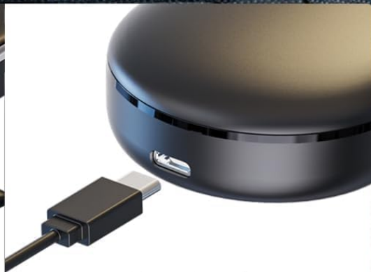
Charging the charging case

Image: Charging methods for the headset and its charging case. The left image shows the headset connected to a Type-C cable, and the right image shows the charging case connected to a Type-C cable.