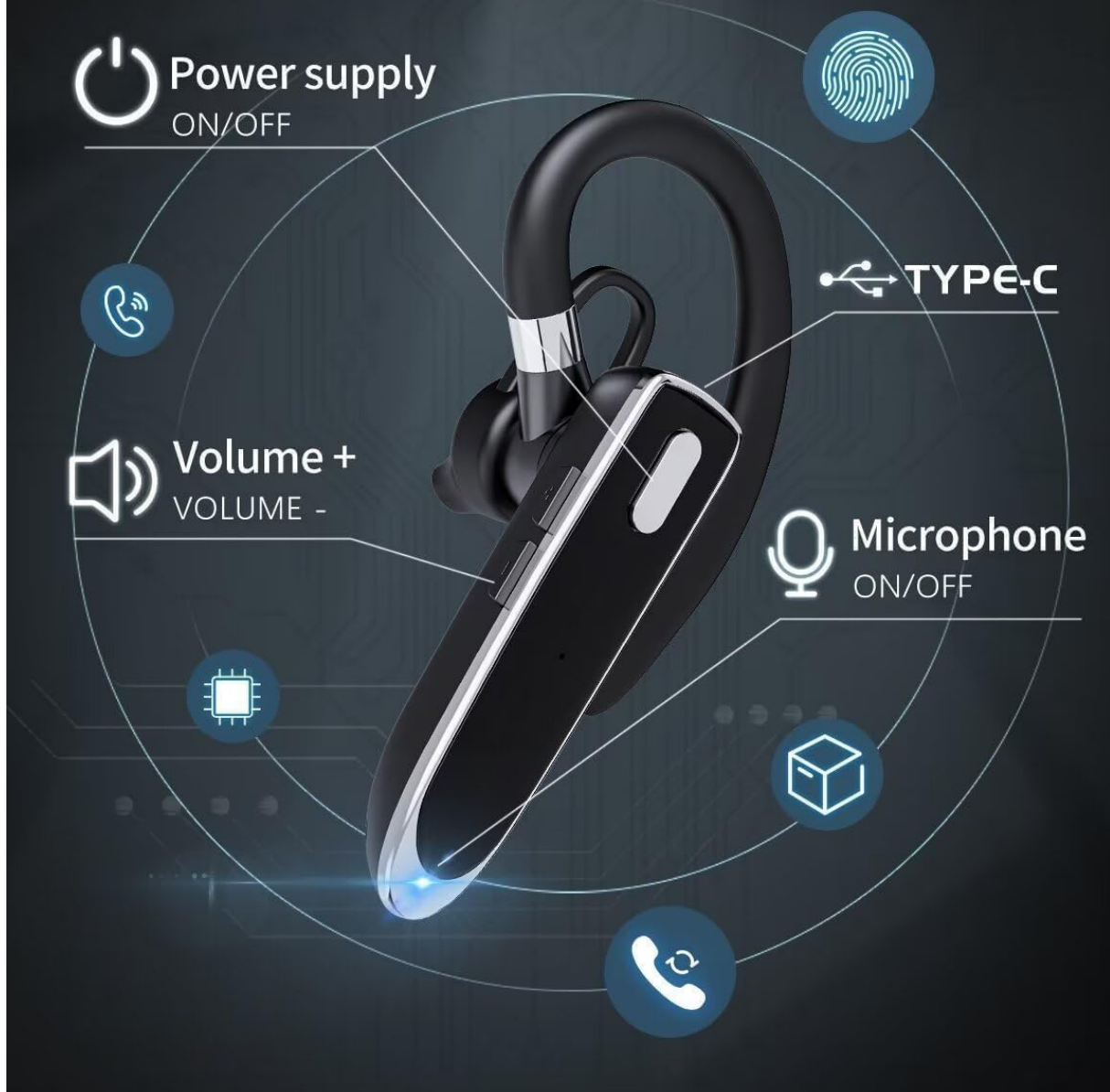
Image: Overview of the headset's multi-functional buttons and ports. This diagram illustrates the location of the power button, volume controls, microphone, and Type-C charging port on the headset.