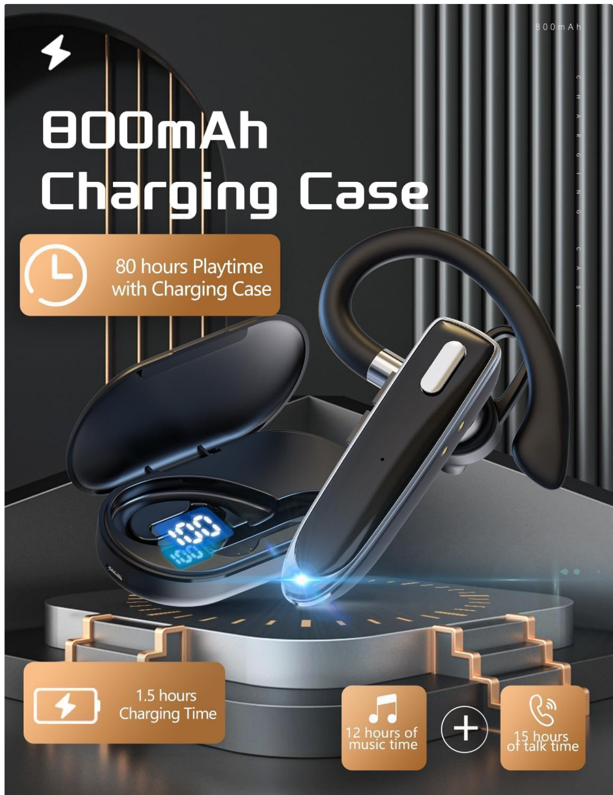
Image: The 800mAh charging case with the headset, highlighting 80 hours playtime, 1.5 hours charging time, 12 hours music time, and 15 hours talk time.