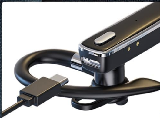
Charging the Bluetooth headphones