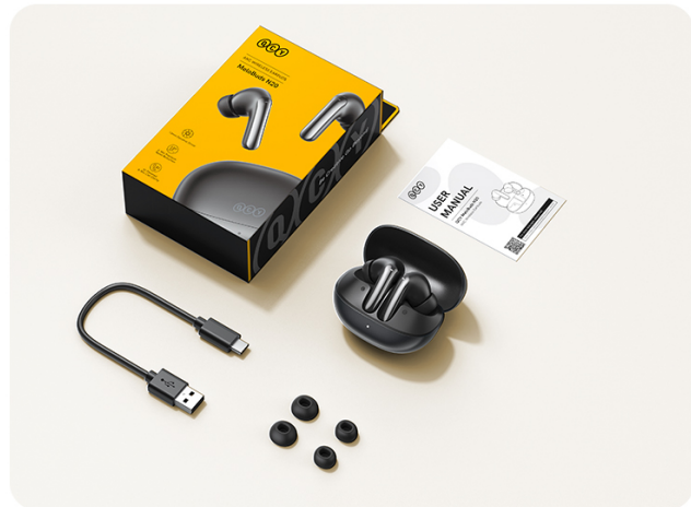
Image: The QCY MeloBuds N20 package contents, including earbuds, charging case, USB-C cable, and extra ear tips.