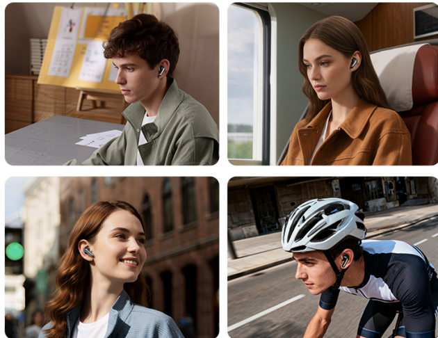
Image: Visual representation of the different adjustable noise cancelling modes: Indoor, Crowd, Commute, Adaptive, Anti-Wind Noise, and Transparent, with corresponding usage scenarios.