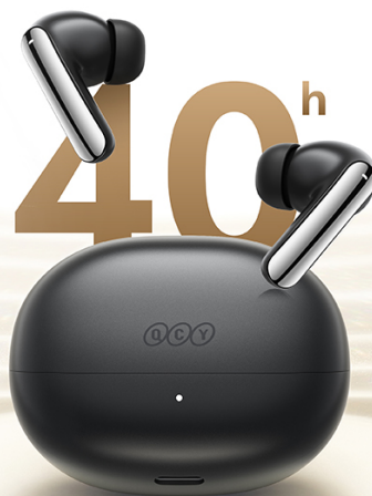
Image: Illustration detailing the 40-hour playback time with the charging case, including single playtime with ANC on and off, and the fast charging capability (10 minutes charge for 2 hours playback).