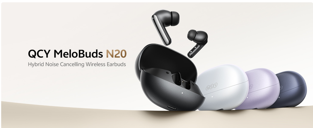
Image: QCY MeloBuds N20 Wireless Bluetooth Earbuds in their charging case.

The QCY MeloBuds N20 Wireless Bluetooth Earbuds offer an enhanced audio experience with advanced features designed for daily use. These earbuds incorporate Active Noise Cancelling (ANC) technology to minimize ambient sound, ensuring clear audio. Equipped with 6 microphones and Environmental Noise Cancellation (ENC), they provide crystal-clear call quality. With a long-lasting battery, dual device connection capability, and a low-latency mode, the MeloBuds N20 are suitable for various activities, from listening to music and making calls to gaming.