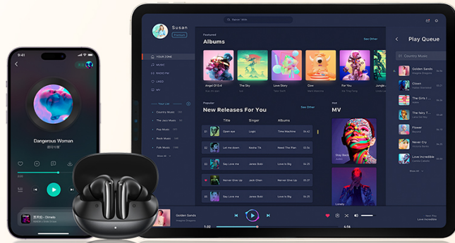
Image: Illustration of the QCY MeloBuds N20 connected to both a smartphone and a tablet simultaneously.

Connect two devices at the same time and switch between them seamlessly.