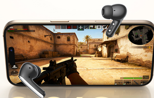
Image: Depiction of the earbuds' low-latency mode for gaming and their IPX4 sweat/water resistance, showing water droplets on the earbuds.