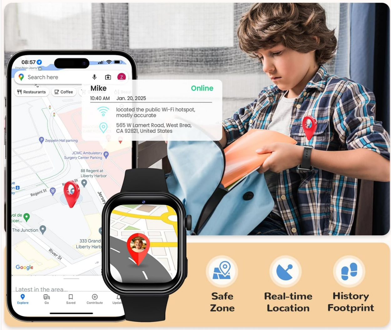
Image: The smartwatch provides precise location tracking with features like safe zones, real-time location, and history footprint.

Notify immediately if child exits safe zone.