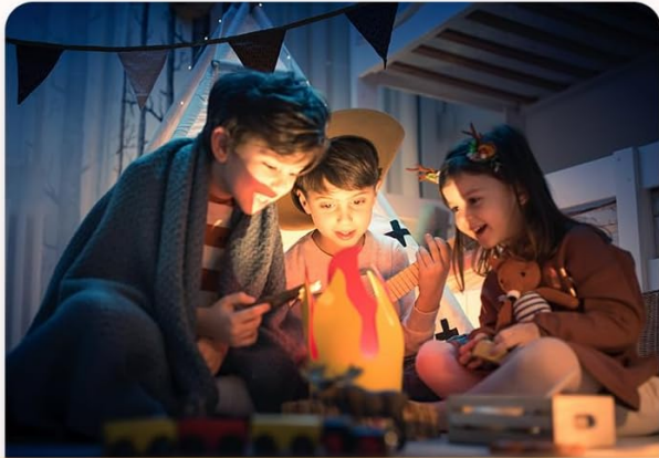
Nighttime Wake-up Lighting