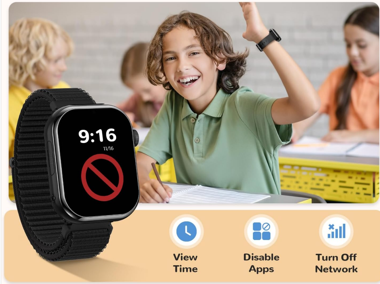
Image: School Mode helps children focus by limiting smartwatch functions during specific times.

Enable school mode to temporarily block calls and messages, creating a quiet and undisturbed learning environment for your child.