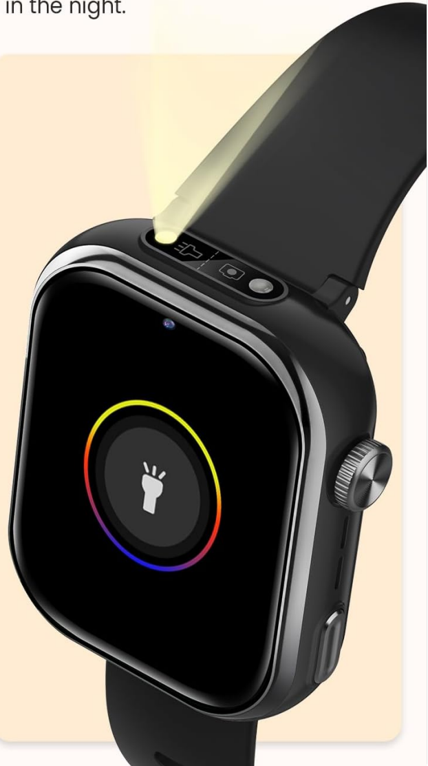
Image: The smartwatch features a high-brightness LED flashlight for various uses.