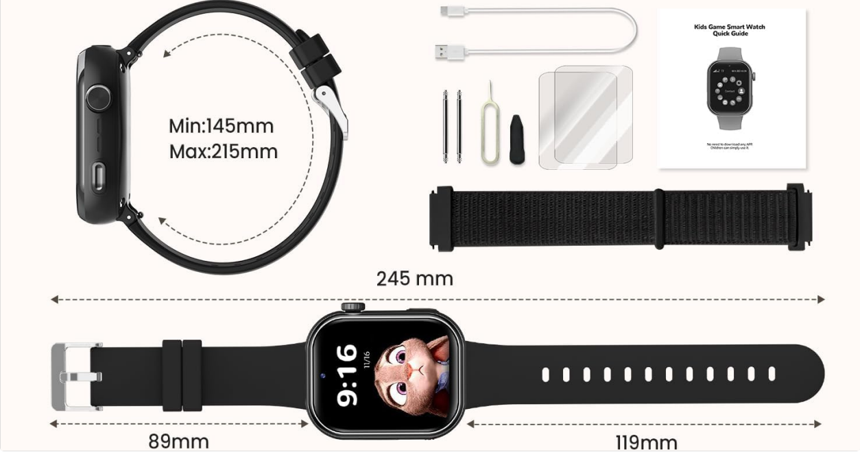
Image: Contents of the RUXINGX T12 Smartwatch package, showing the watch, charging cable, user manual, and additional accessories.

A gift specially made for children brightening up their wonderful childhood.