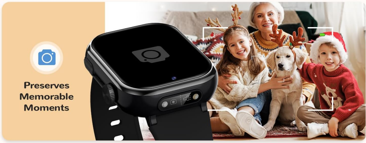
Image: The smartwatch supports HD video calls and includes a camera for capturing photos.