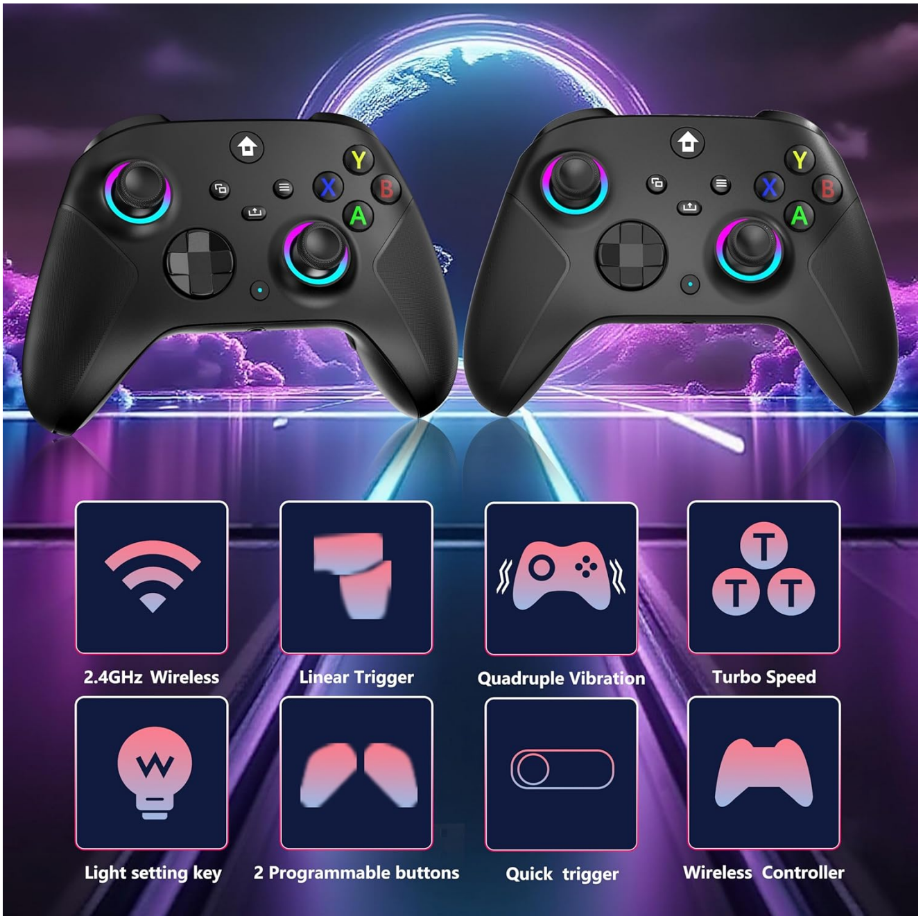
Figure 1: Key features of the YUYIU Wireless Controller.