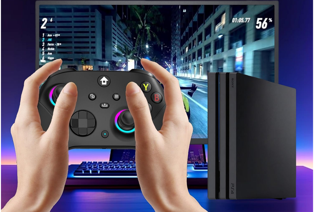
Figure 3: Wireless connection setup.

Video 1: Demonstrates the process of connecting the YUYIU Wireless Controller to a device using the 2.4GHz receiver. It shows plugging in the receiver, powering on the controller, and initiating the pairing sequence until a solid connection is established.