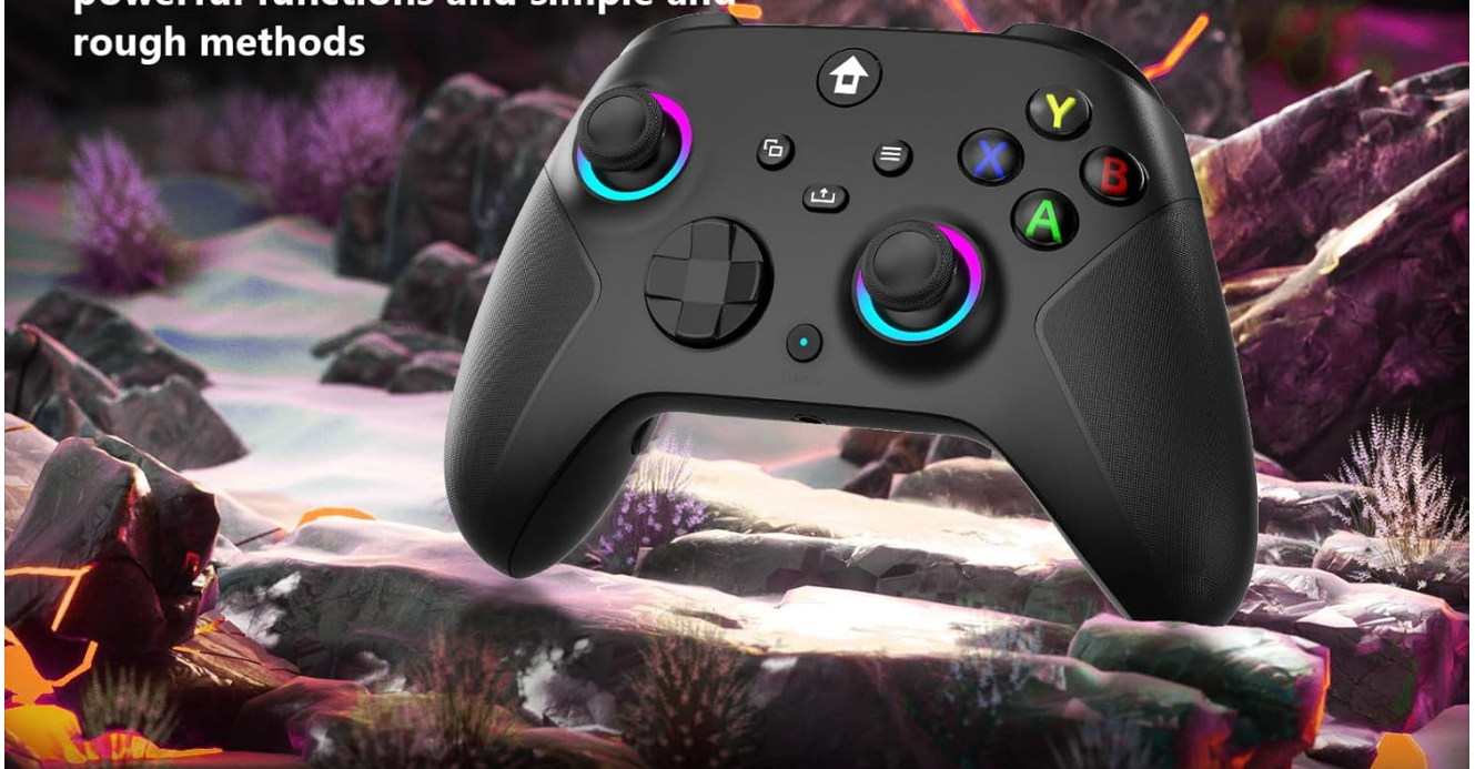
Figure 2: Controller layout and button functions.

A complete series of PC, STEAM and XBOX hosts, connected and played on major platforms, with powerful functions and simple and rough methods