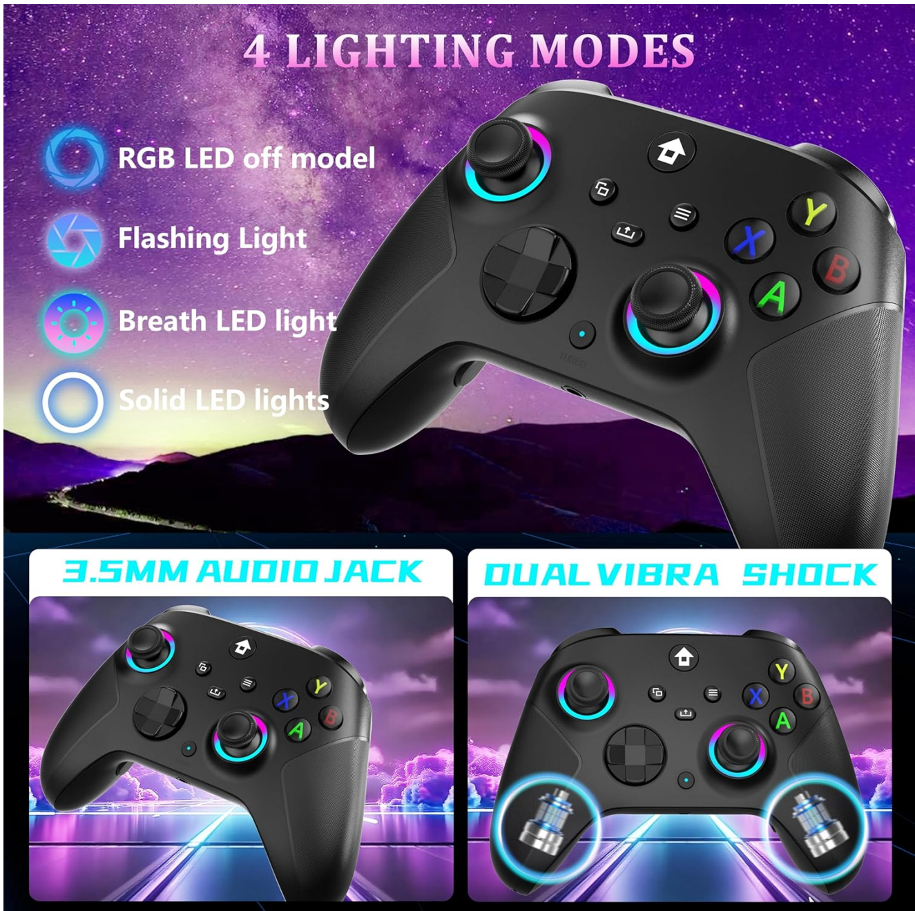
Figure 4: Overview of RGB lighting modes.

Video 2: A tutorial demonstrating how to control and switch between different RGB lighting modes on the YUYIU Wireless Controller, including solid, breathing, and rainbow effects.