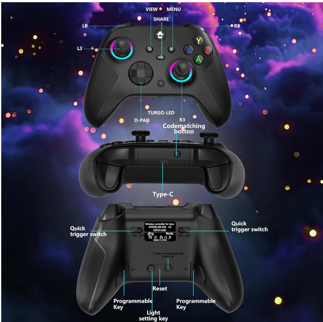
Figure 6: Programmable back buttons.

Video 5: A tutorial demonstrating how to set up Combo Attack and Macro Programming on the YUYIU Wireless Controller, including the programmable back buttons.