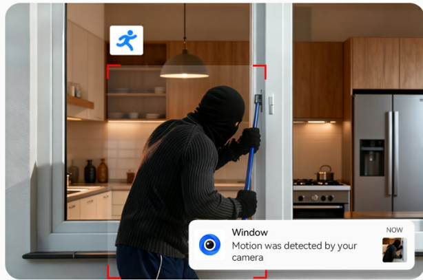
Image: Demonstrates the phone push sound alarm feature, where the camera sends notifications upon detection and can sound an alarm.