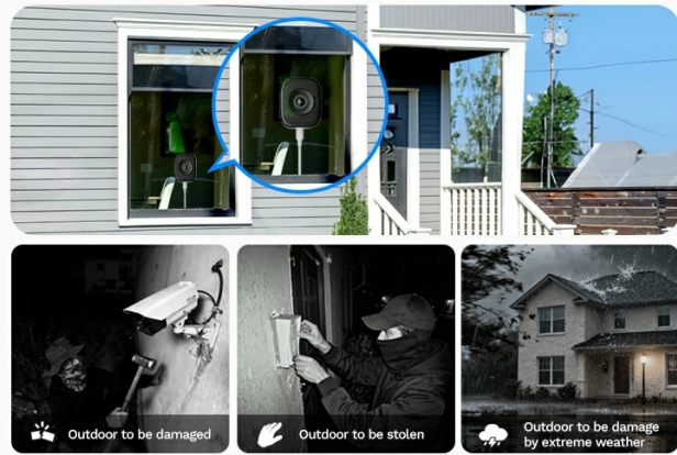
Image: Illustrates the benefit of indoor installation for the camera, protecting it from theft, damage, and extreme weather conditions.

Compared to outdoor dome cameras window cameras are less visible, preventing vandalism and theft. The indoor protection ensures the camera's durability and resistance to extreme weather conditions