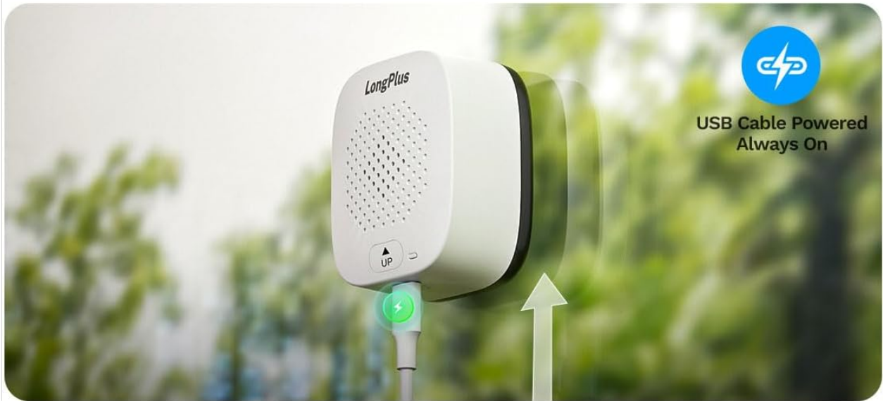
Image: Visual guide showing the effortless installation of the camera using its magnetic mount and USB power connection.