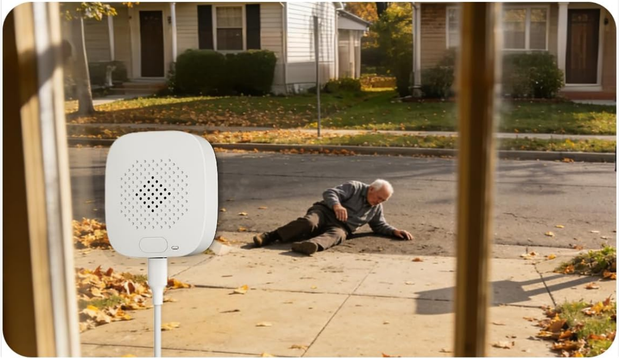
Image: The LongPlus 5MP 3K Smart Window Camera, a compact device designed for indoor security.