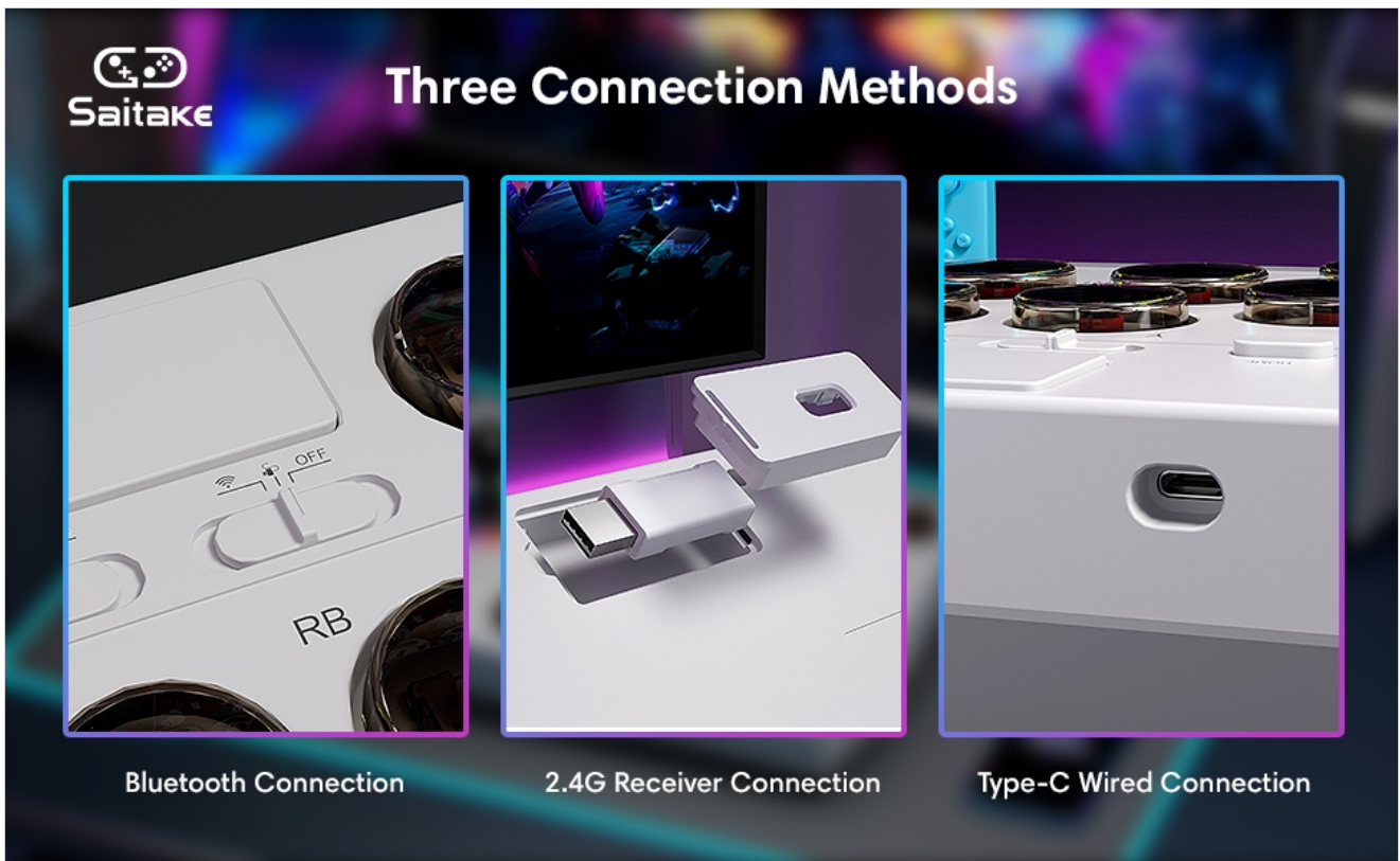
Image: Visual representation of the Bluetooth switch, 2.4G receiver, and Type-C wired connection port.

The Saitake Arcade Fight Stick supports three primary connection methods: