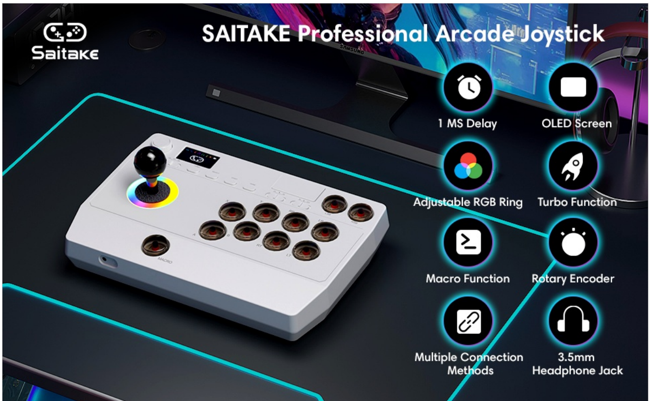
Image: Detailed diagram of the Saitake Arcade Fight Stick showing the location and labels of all buttons and features.

Familiarize yourself with the layout and functions of the arcade fight stick's buttons and controls.