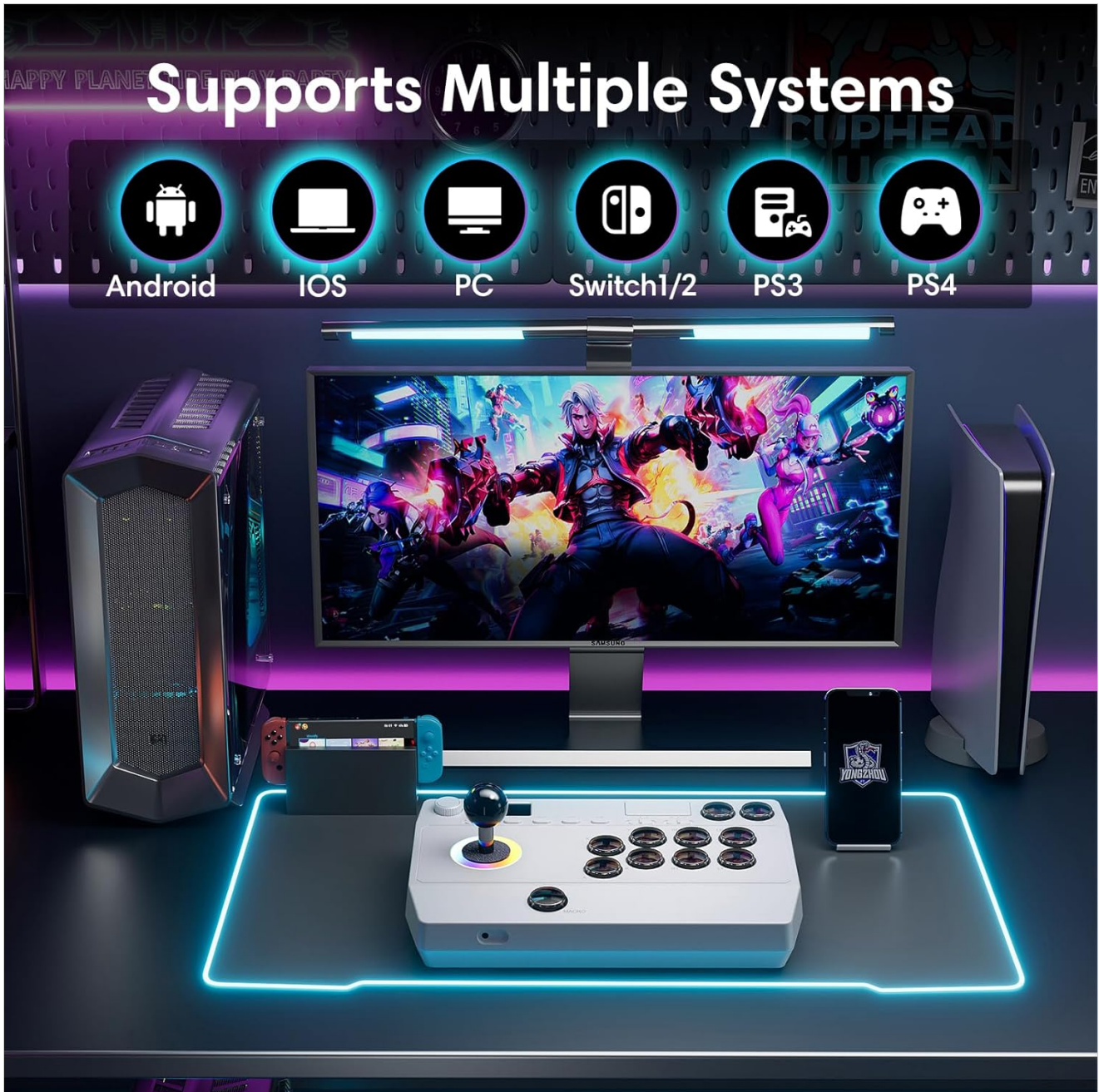
Image: Icons representing Android, iOS, PC, Nintendo Switch, PS3, and PS4, indicating multi-system support.

The Saitake Arcade Fight Stick is designed for broad compatibility. The image below illustrates the supported systems.