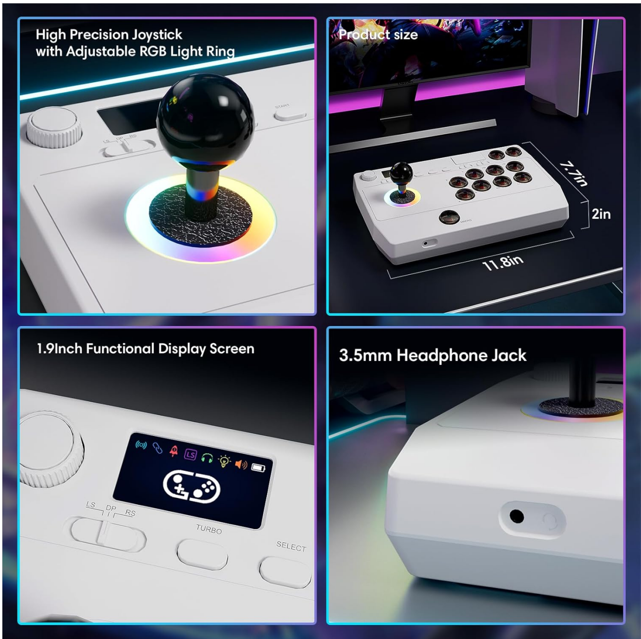
Image: Close-up views of the high-precision joystick with RGB lighting, the 1.9-inch functional display screen, and the 3.5mm headphone jack.