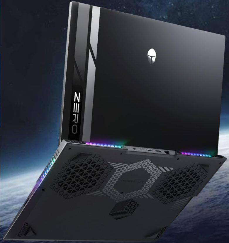
Image: The Thunderobot Zero 18 Pro laptop display showcasing its vibrant QHD+ resolution and narrow bezels.