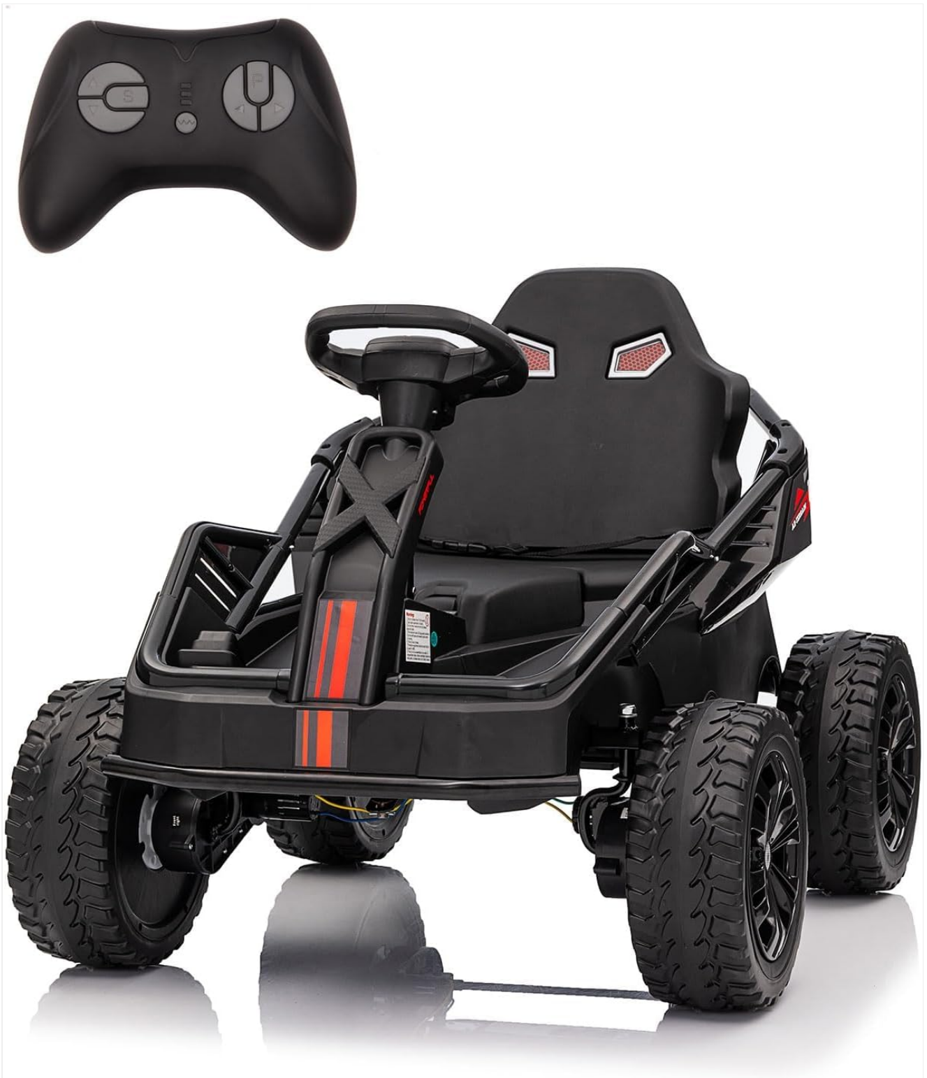
Image 1.1: The Garvee 24V Electric Go Kart SX2458, showcasing its overall design and included remote control.