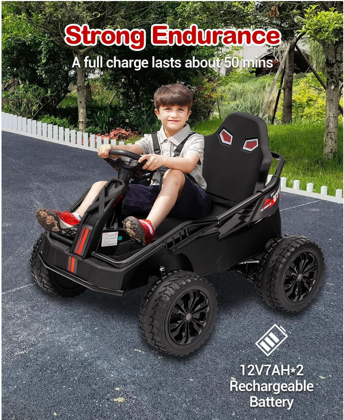
Image 5.1: A child enjoying the Garvee Go Kart, highlighting the 12V7AH*2 rechargeable battery and its approximate 50-minute endurance on a full charge.