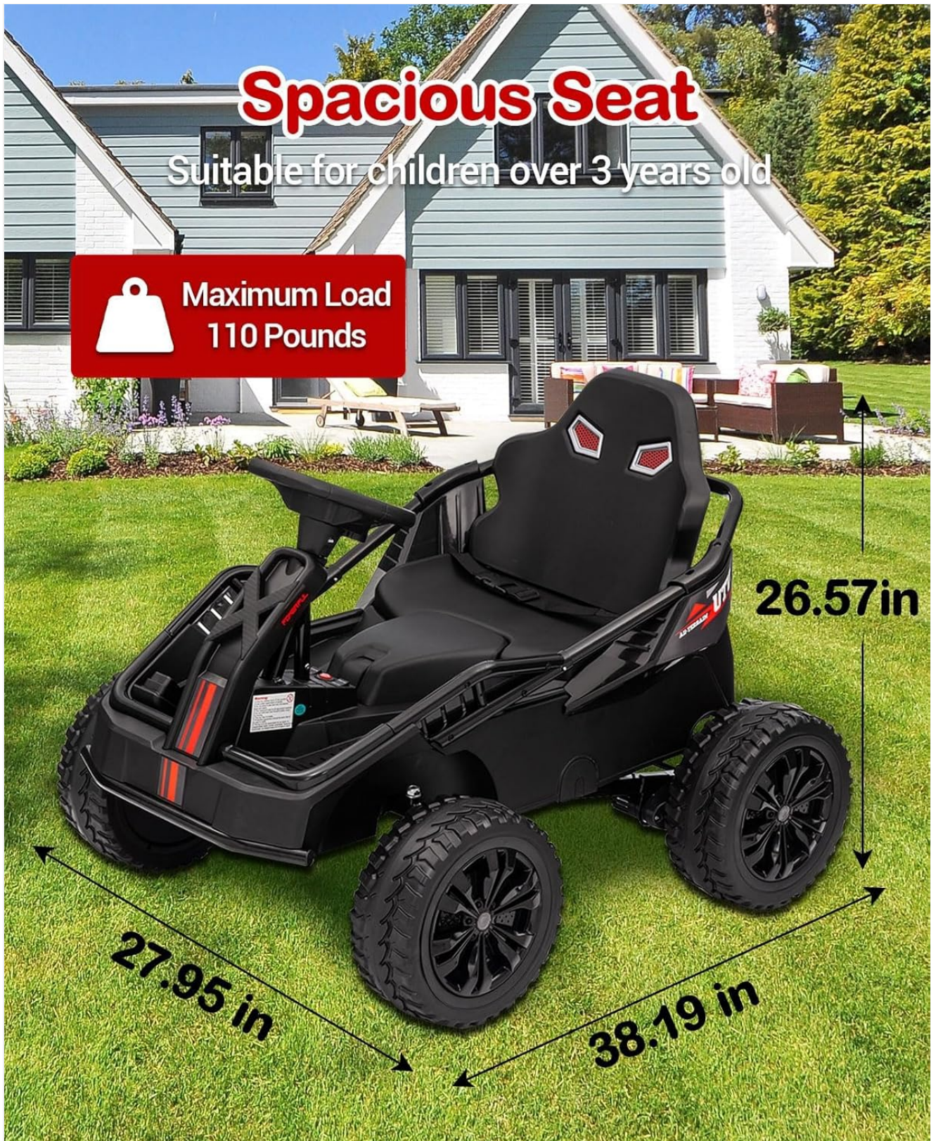
Image 9.1: The Garvee Go Kart with key dimensions indicated: 38.19 inches (length), 27.95 inches (width), and 26.57 inches (height), along with maximum load capacity of 110 pounds.