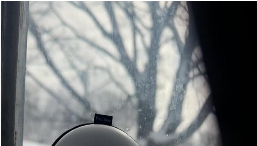
Image: The Noaheye Window Camera securely mounted on an interior window pane, with its power cable connected. The camera is positioned to monitor the exterior, which is covered in snow.