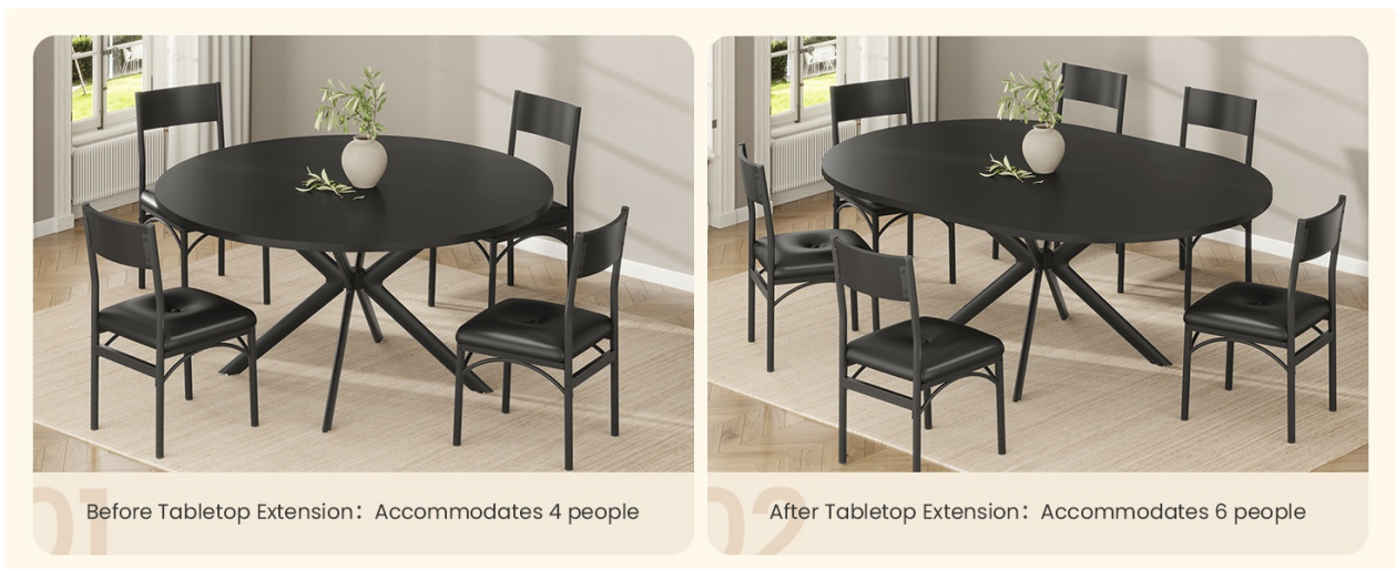
Image: A visual comparison showing the dining table in its compact round form (accommodating 4 people) and its expanded oval form (accommodating 6 people).