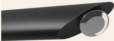
Image: Close-up of the table's construction, highlighting the thick desktop, stable X-shaped metal legs, and adjustable feet for leveling.

The feet are adjustable, allowing the table to adapt to uneven floors and preventing them from being scratched.