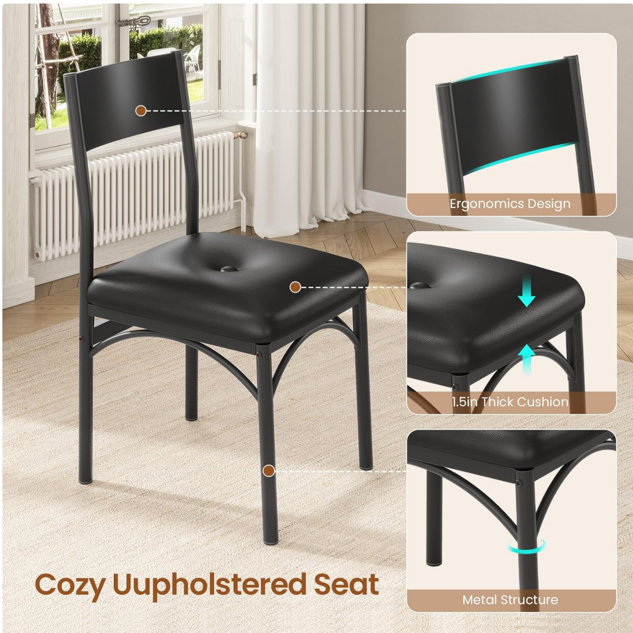
Image: Close-up of a dining chair, illustrating its ergonomic back design, 1.5-inch thick cushioned seat, and robust metal frame structure.