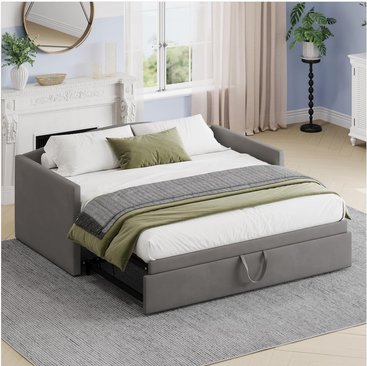
Image 4.3: The daybed fully extended, demonstrating the king-sized configuration with the pop-up trundle.