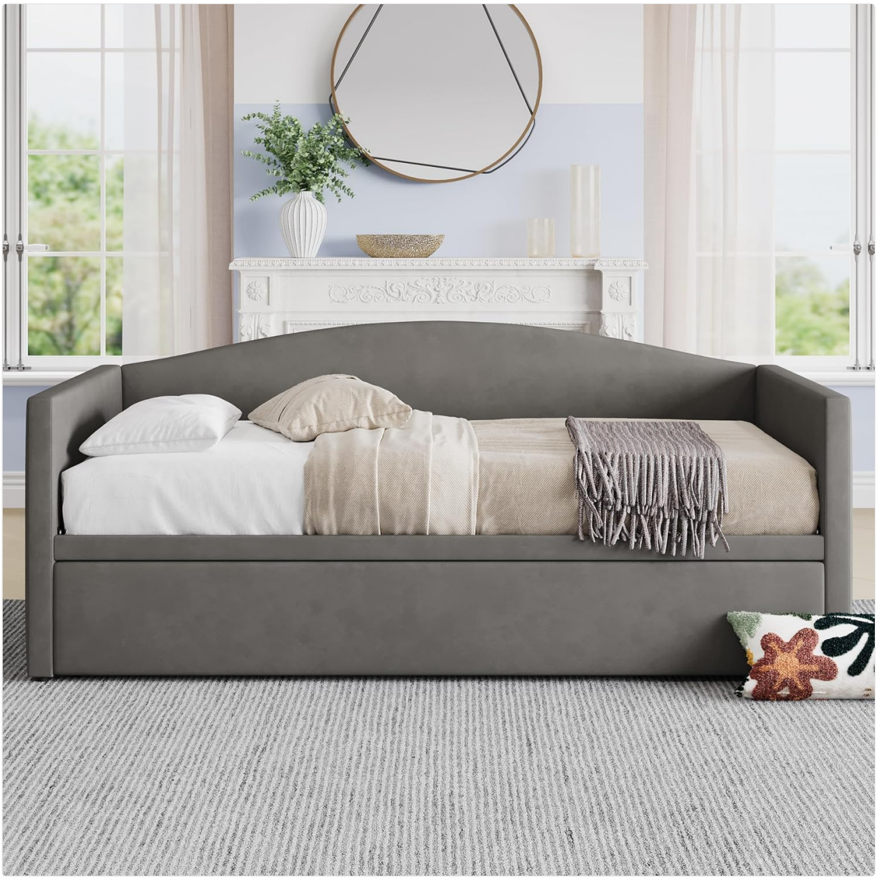
Image 1.1: The daybed configured as a sofa, showcasing its upholstered design and armrests.