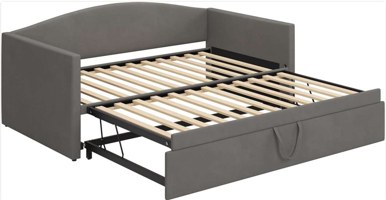
Image 4.2: The trundle unit in its popped-up position, ready to be aligned with the main daybed to form a larger sleeping area.