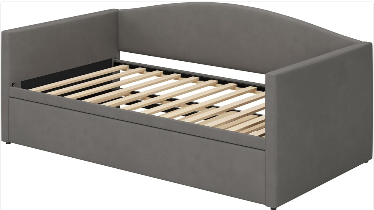
Image 3.1: The internal structure of the daybed, showing the wooden slats that support the mattress.