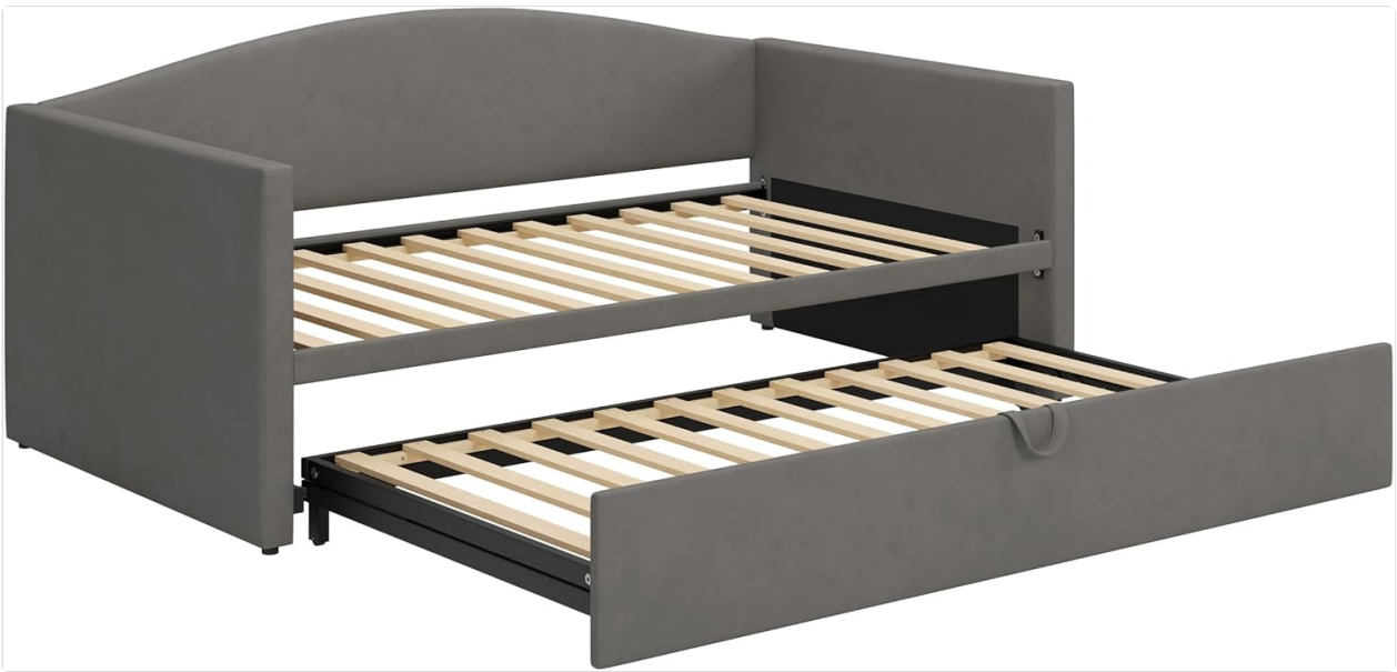
Image 4.1: The trundle unit being smoothly pulled out from beneath the main daybed frame.