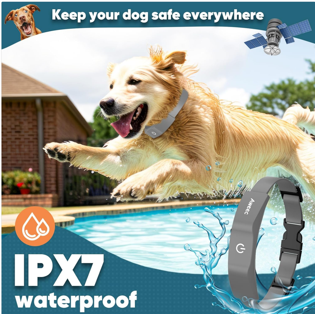
Image: Detailed view of the Aweec GPS Wireless Dog Collar, highlighting its features such as the magnetic charging port, adjustable strap, and dual-core GPS.