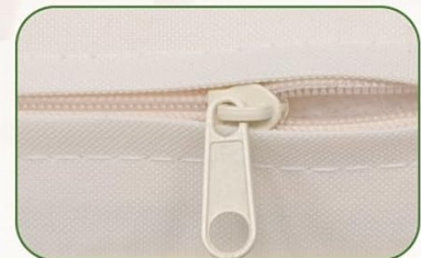
Washable Zippered Cover

Image: Detailed view of chair features, highlighting the breathable slat design, ergonomic backrest, soft sponge cushion, comfortable armrests, and the washable zippered cover.