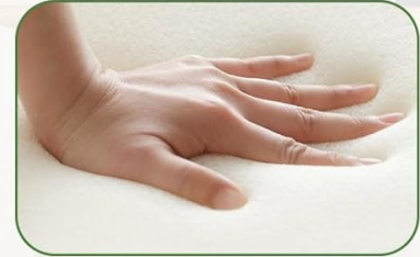
Soft Sponge Cushion