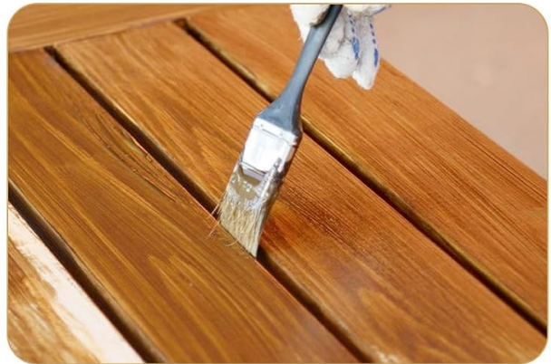
Maintenance Tips Apply wood polish oil (not included) to the wood surface

Image: A slatted bench seat with a close-up of the wood thickness and a hand applying wood polish oil.