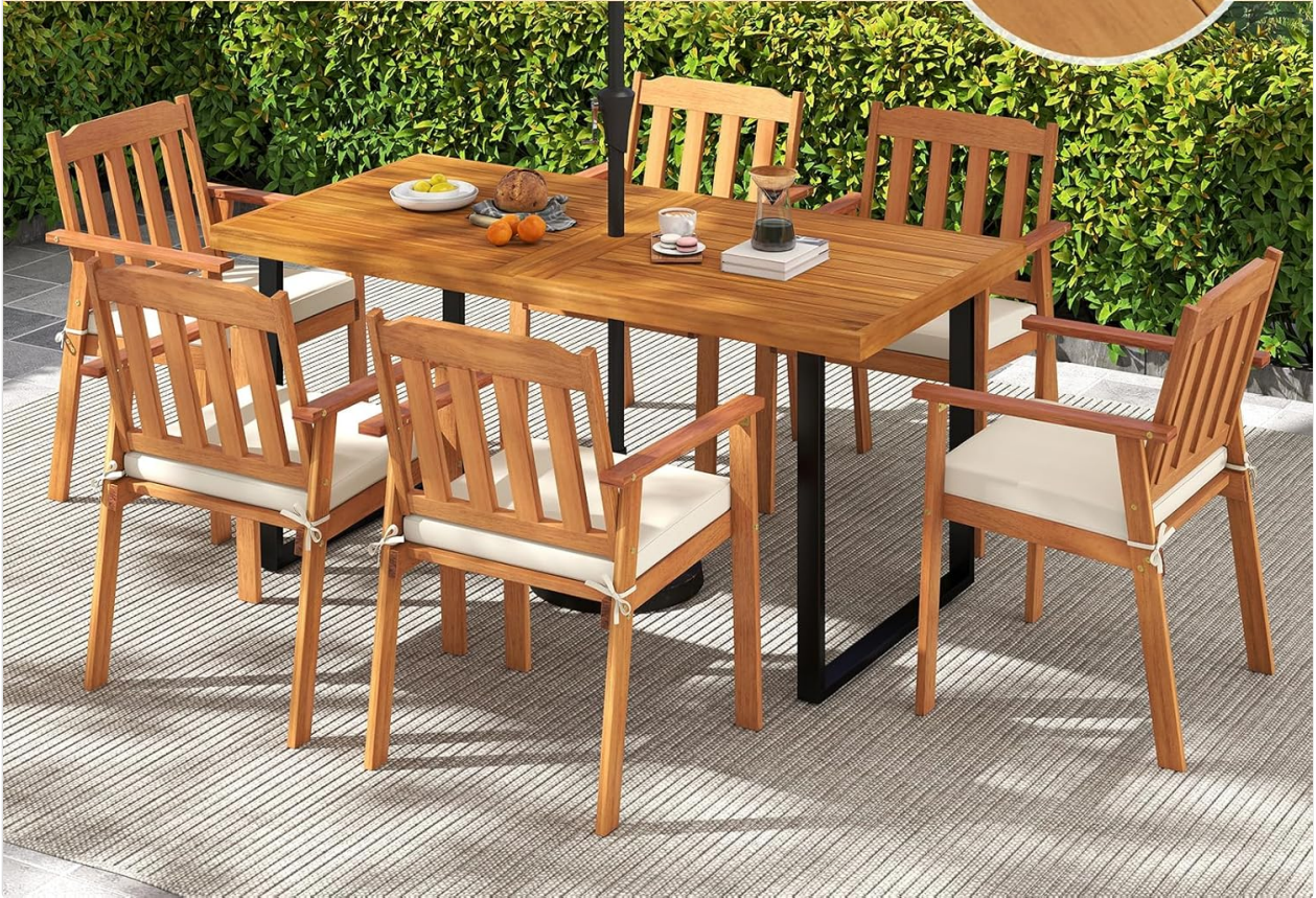
Image: The dining table with an umbrella inserted, and a detailed view of the 1.97-inch umbrella hole.