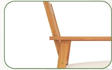
Ergonomic Tilt Backrest