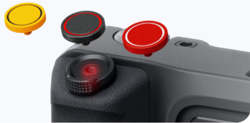
Image: Close-up of the Xplorer Grip Pro Kit showing the red shutter button on the handle.

*Comes with a regular shutter button. Other items shown in the picture must be purchased separately.