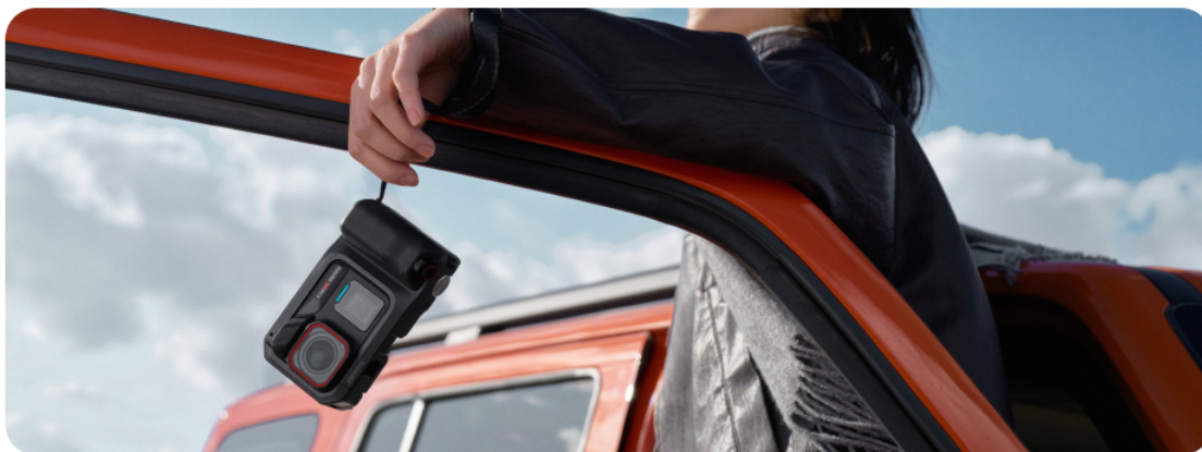
Image: Insta360 Ace Pro 2 camera mounted in the Xplorer Grip Pro Kit, held by a person's hand.

The coolest way to capture street shots.