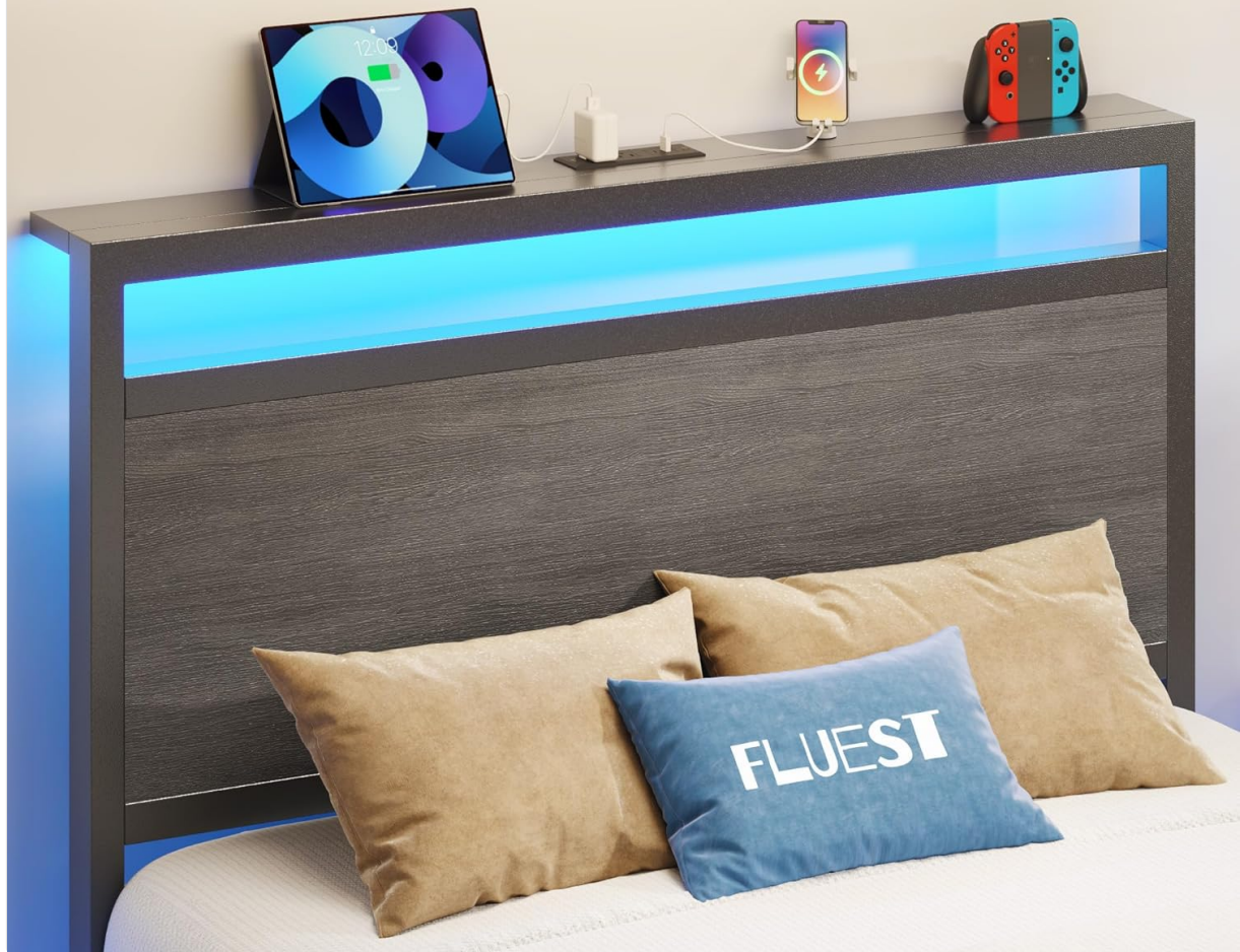
Figure 3: Headboard storage shelf with integrated LED lighting, providing ambient illumination.

Place commonly used items within easy reach