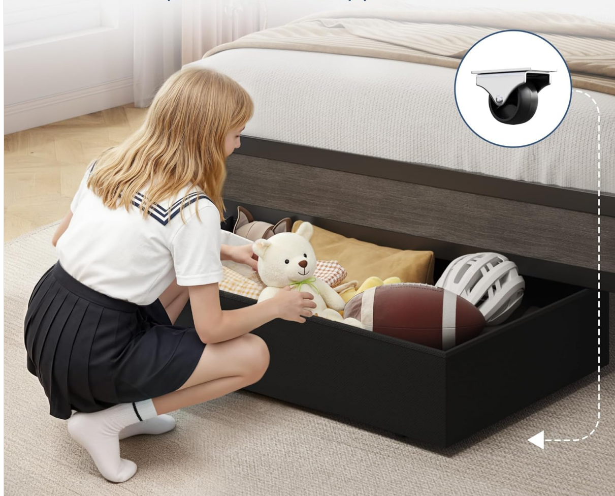
Figure 6: The movable fabric drawer provides convenient under-bed storage.

It can be pulled out from any position under the bed