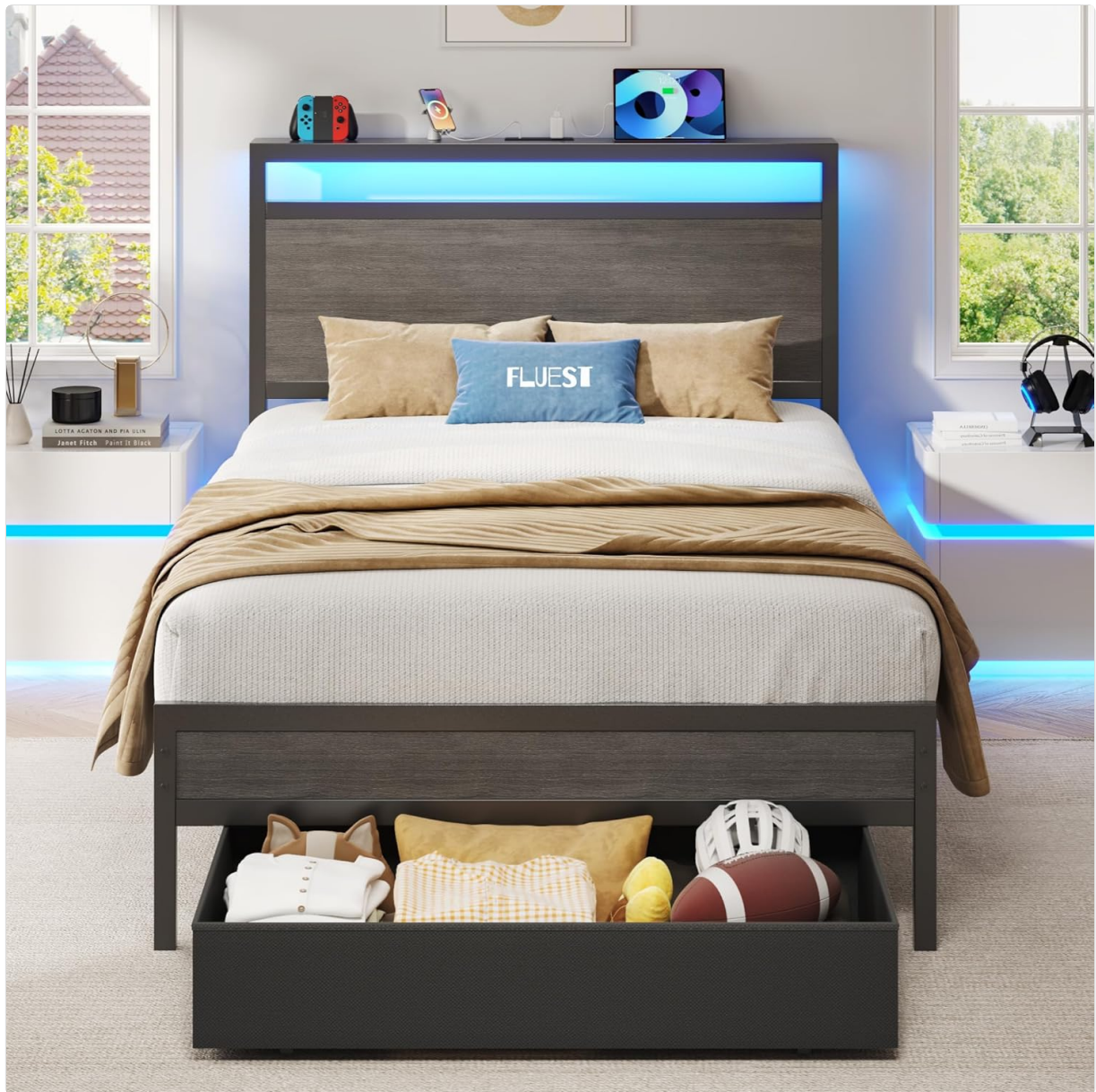
Figure 2: The fully assembled Fluest Twin Bed Frame, ready for use.