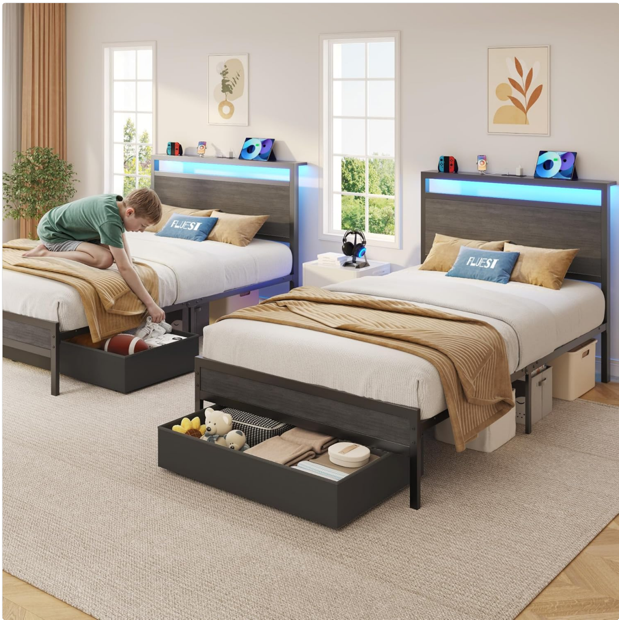
Figure 4: Smart RGB LED light features, controllable via app or remote for various settings.