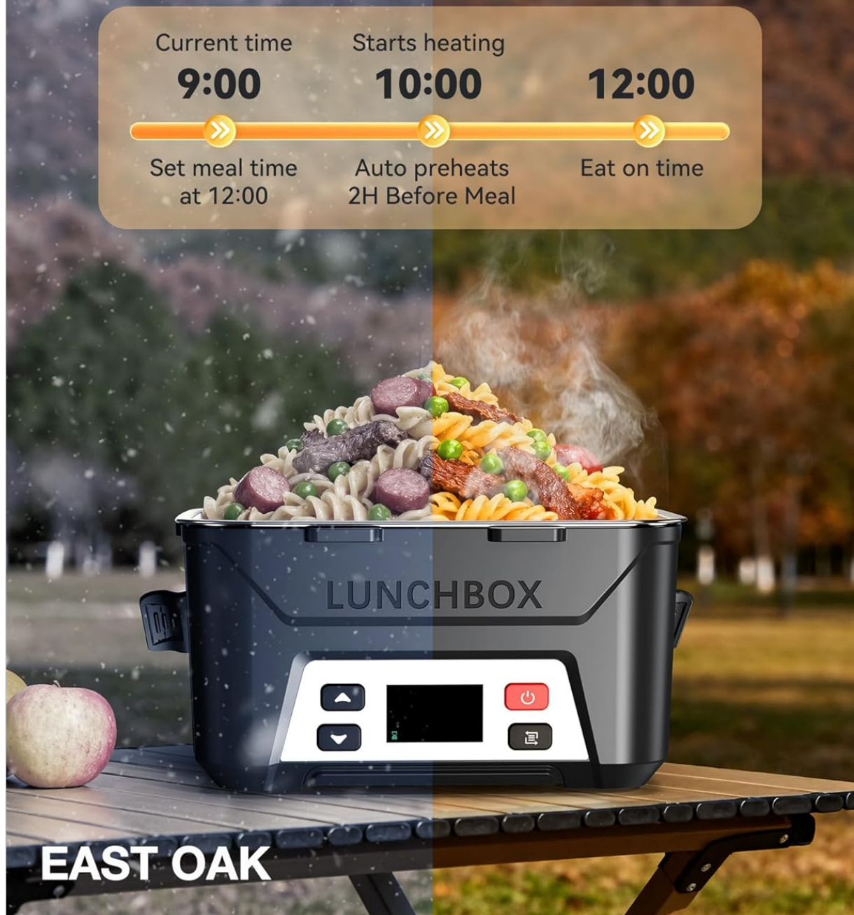
Image 6.1: Visual representation of the smart scheduled heating feature, showing current time, heating start time, and mealtime.