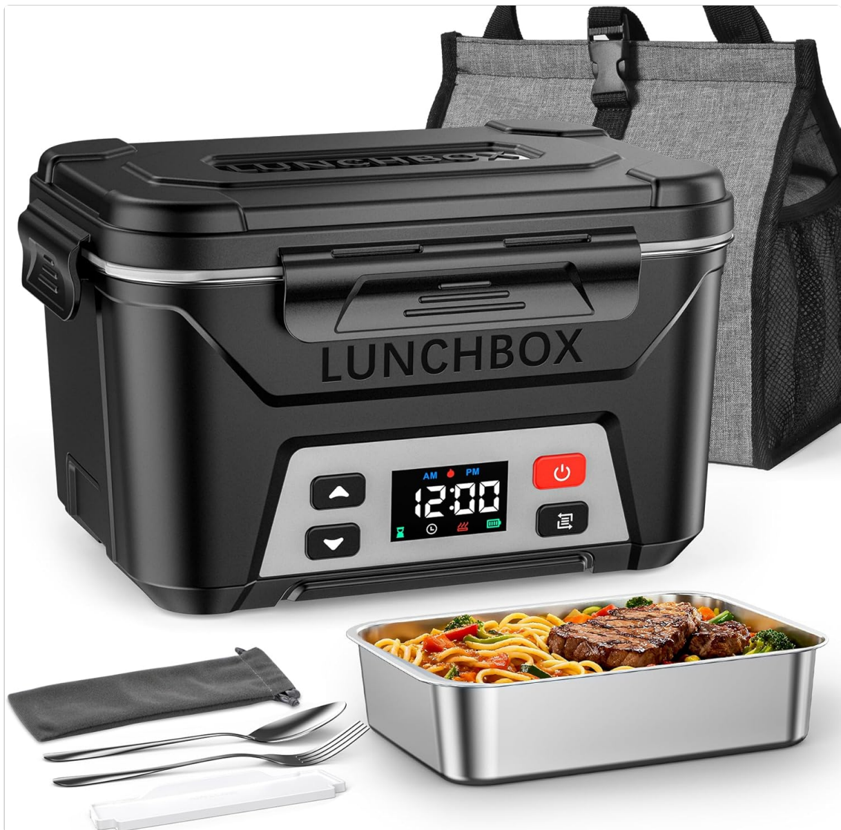
Image 1.1: The East Oak Rechargeable Self-Heating Lunch Box, showcasing the main unit, insulated bag, stainless steel inner container with food, and included fork and spoon.