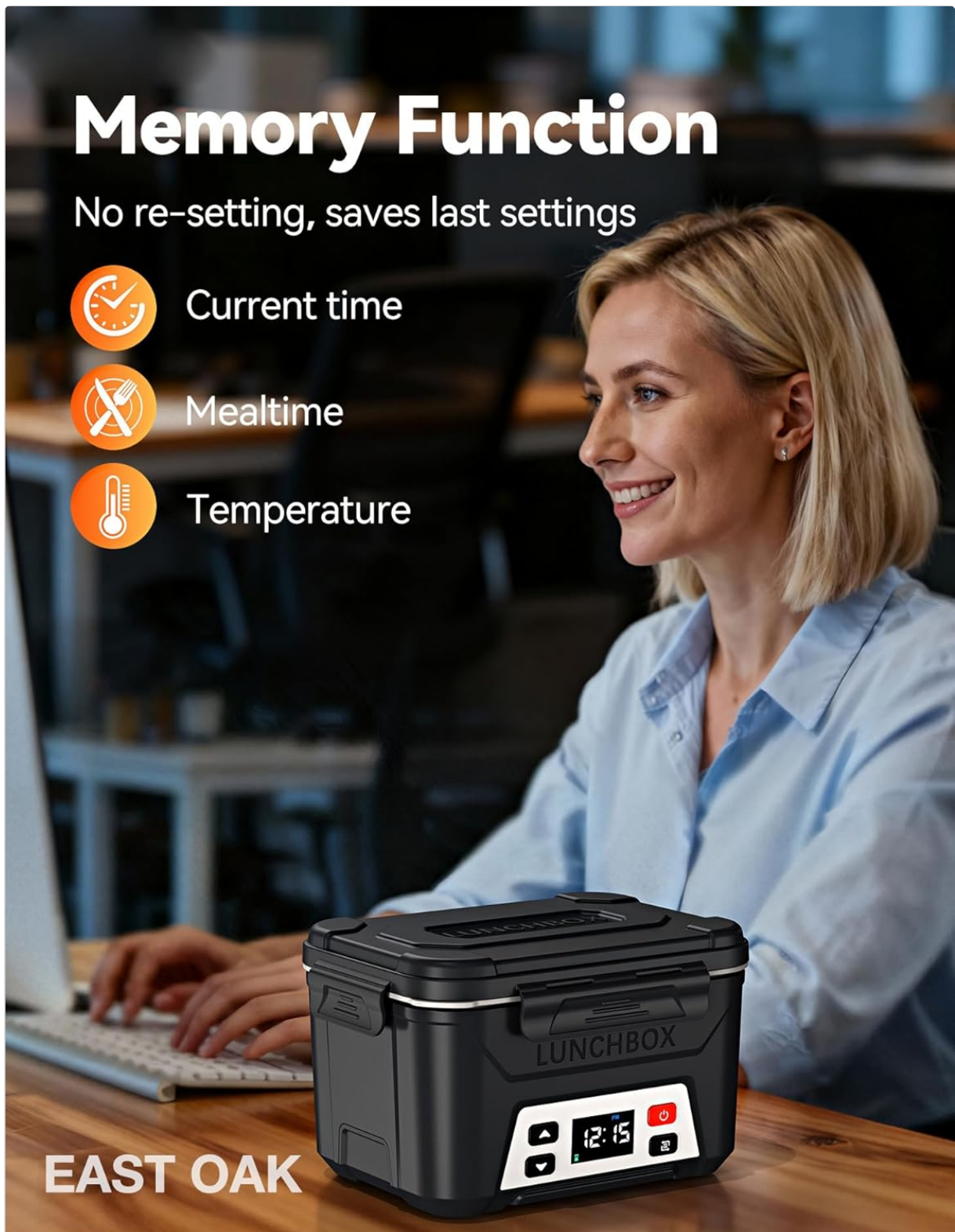
Image 6.4: A user interacting with the East Oak lunch box, highlighting the memory function that saves current time, mealtime, and temperature settings.