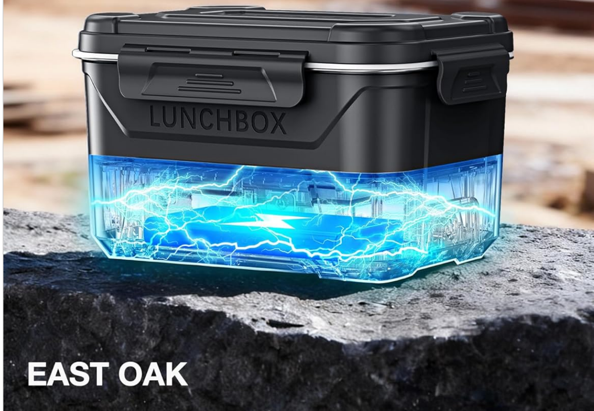
Image 4.1: Illustration highlighting the battery-powered nature of the East Oak lunch box, allowing for heating anywhere.