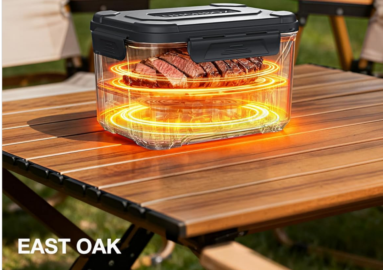
Image 6.2: The East Oak lunch box illustrating its ability to heat food thoroughly up to 220°F.