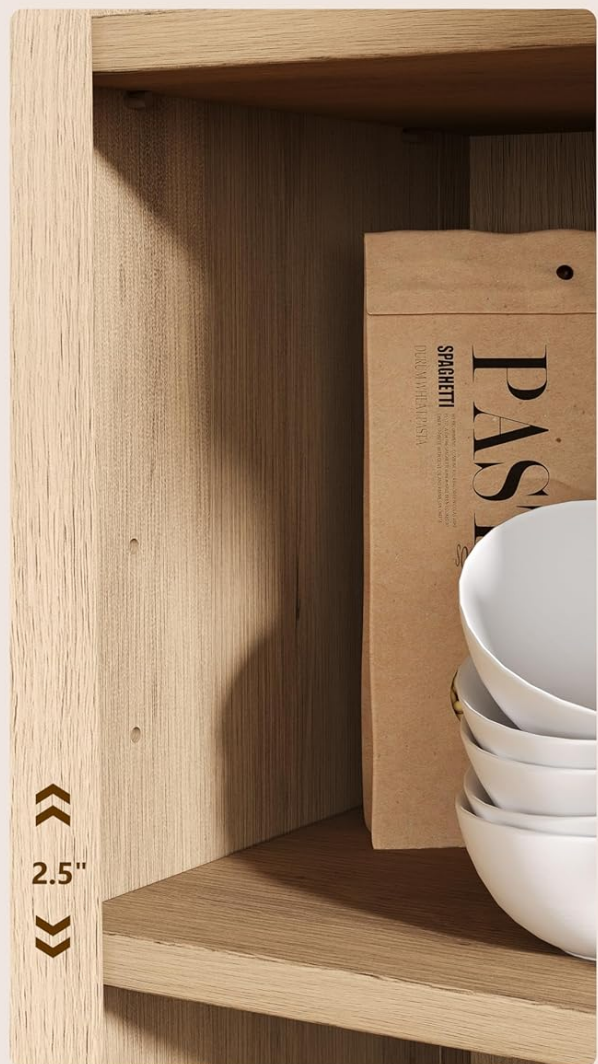
Image: A close-up view of the interior of the Keehusux Buffet Cabinet, showing the adjustable shelves and their 2.5-inch adjustment increments, allowing for flexible storage configurations.