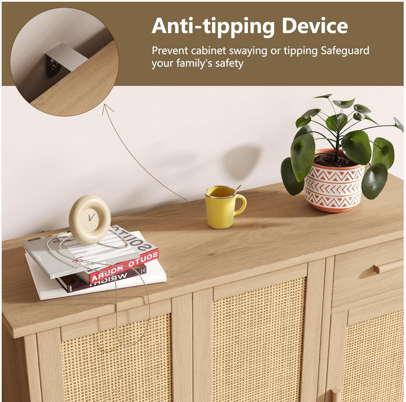
Image: A detailed view of the anti-tipping device being installed on the back of the Keehusux Buffet Cabinet, showing how it secures the unit to the wall for safety.

Prevent cabinet swaying or tipping Safeguard your family's safety