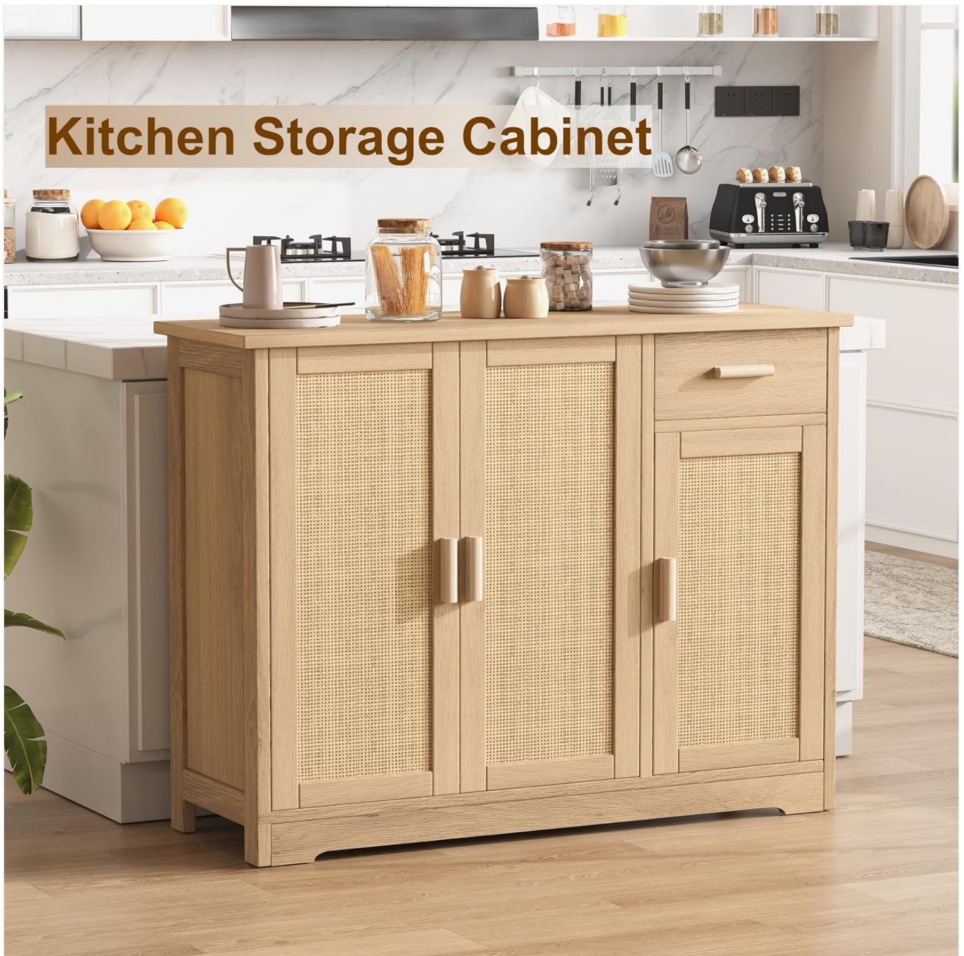
Image: The Keehusux KES015MCWG Buffet Cabinet positioned in a modern kitchen, showcasing its natural oak finish and rattan doors. The countertop is adorned with kitchen items, and a plant is visible to the left.