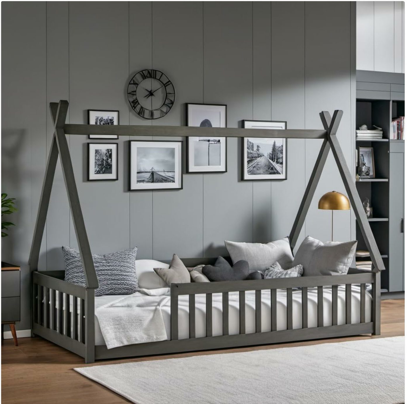
Image: Overview of the PVWIIK Twin Montessori Floor Bed in Grey, showing the main structural components.