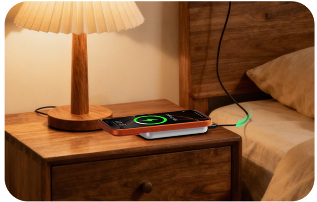
Image: Recharging the power bank.