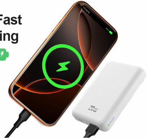
Image: Wireless and wired fast charging capabilities.