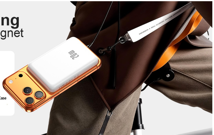
Image: Magnetic attachment for wireless charging.