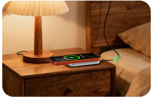
Image: Pass-through charging in action.