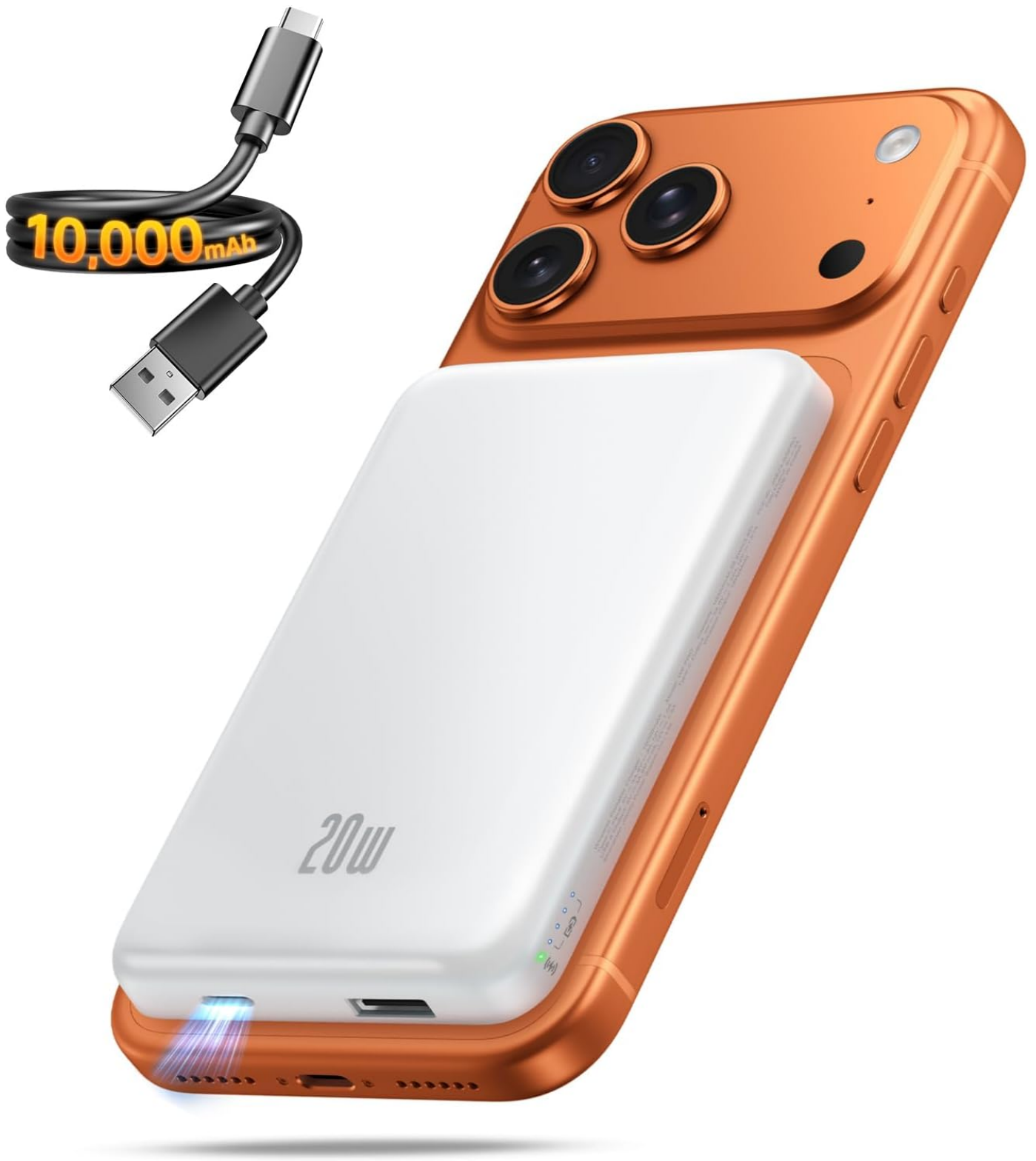
Image: Front view of the HAIARA W5 PRO power bank attached to a smartphone.