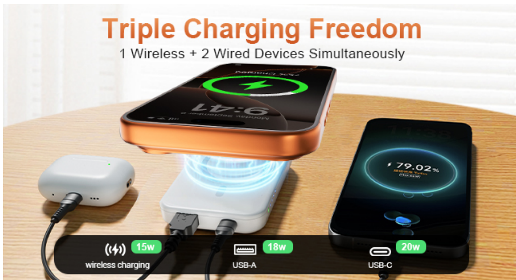
Image: Triple charging freedom with kickstand.

The power bank features a foldable kickstand for convenient hands-free viewing. Simply extend the kickstand from the back of the power bank to prop up your phone horizontally or vertically while charging.