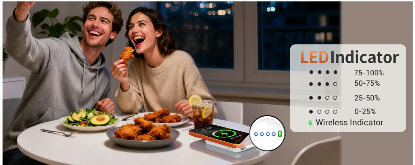
Image: Explanation of LED indicator lights.