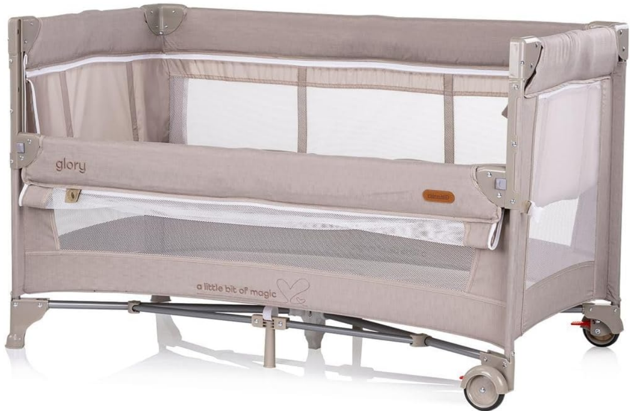
Image: The Chipolino Glory Travel Cot fully assembled, showing its mesh sides and sturdy frame.