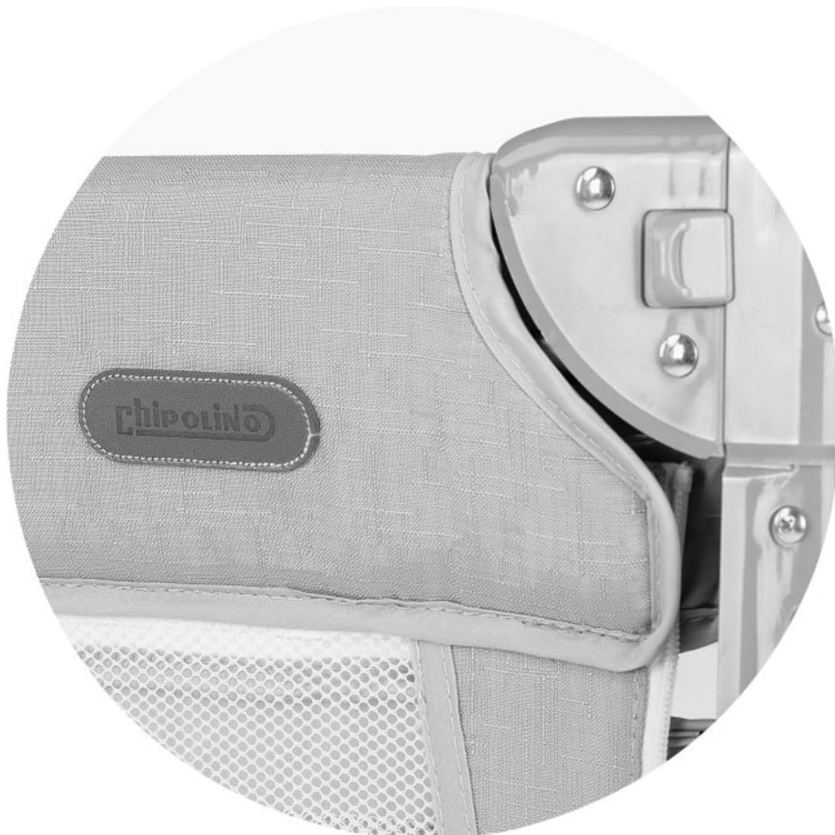
Image: Two detailed views illustrating the steps involved in releasing the cot's folding mechanism for compact storage.