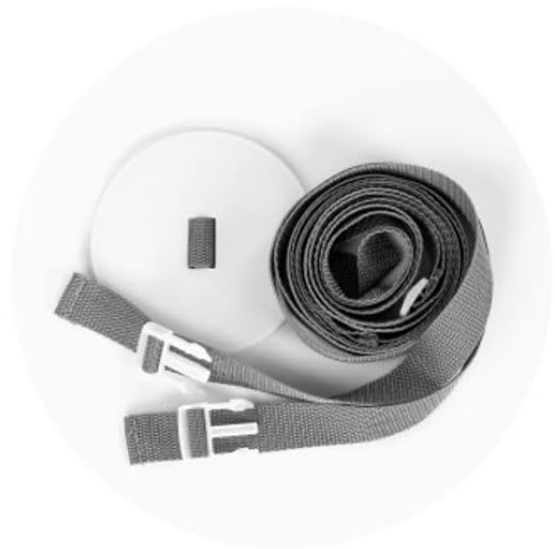
Image: A close-up of the safety strap and buckle system, used to securely attach the travel cot to an adult bed for co-sleeping.