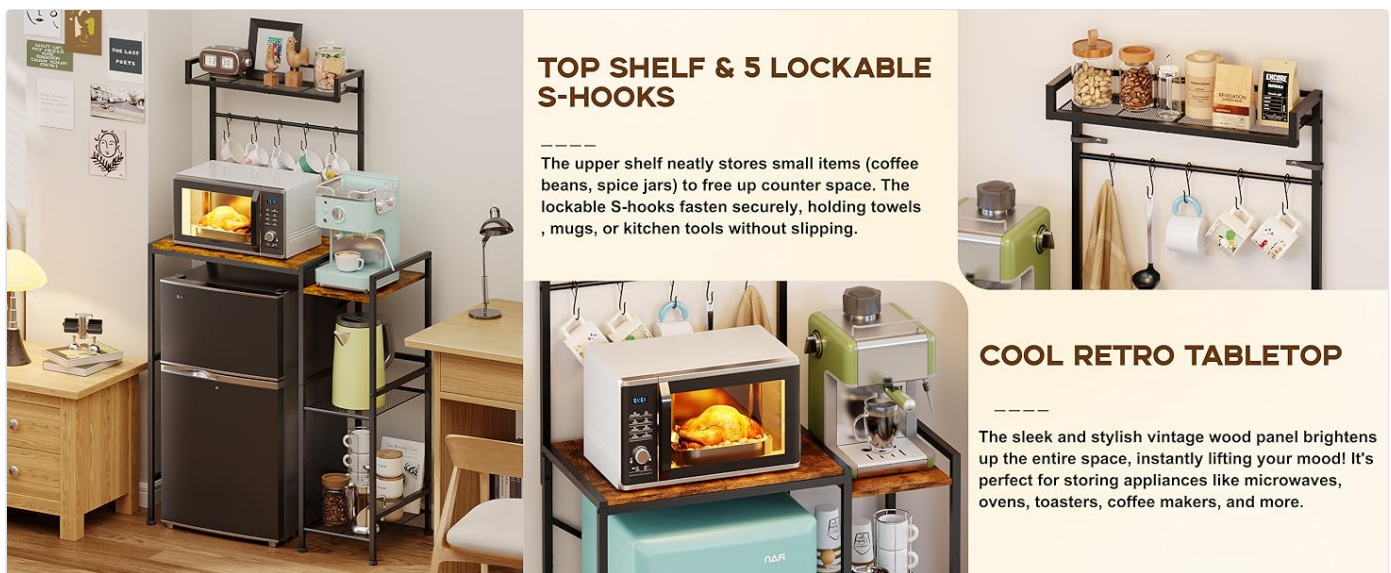
Figure 2: Close-up of the top shelf and the hanging rail with five lockable S-hooks.