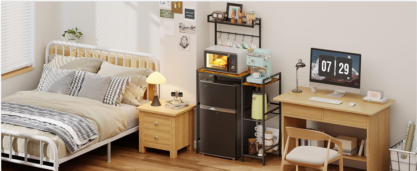
Figure 4: The stand's universal design allows for left or right placement of a mini-fridge, adapting to different room layouts.

To keep your Yuyetuyo Mini Fridge Stand in optimal condition, follow these simple maintenance guidelines: