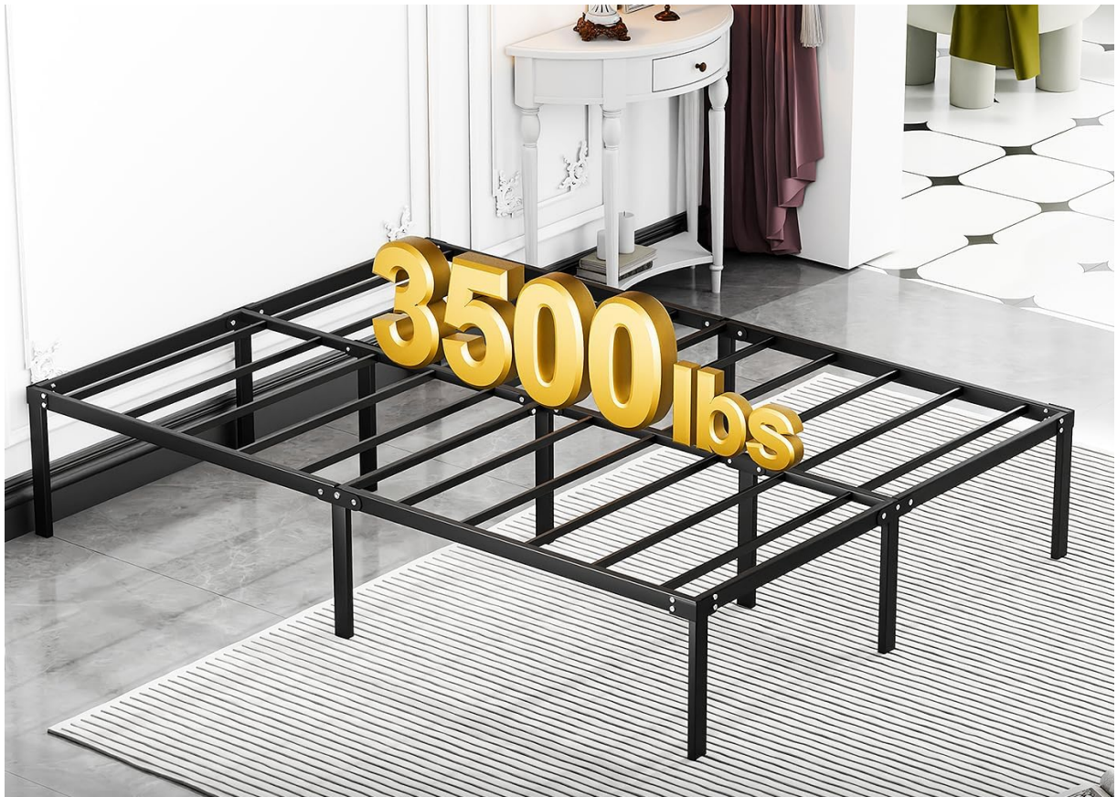
Image: The LEVELEVE Full Bed Frame, showcasing its minimalist design and sturdy construction.