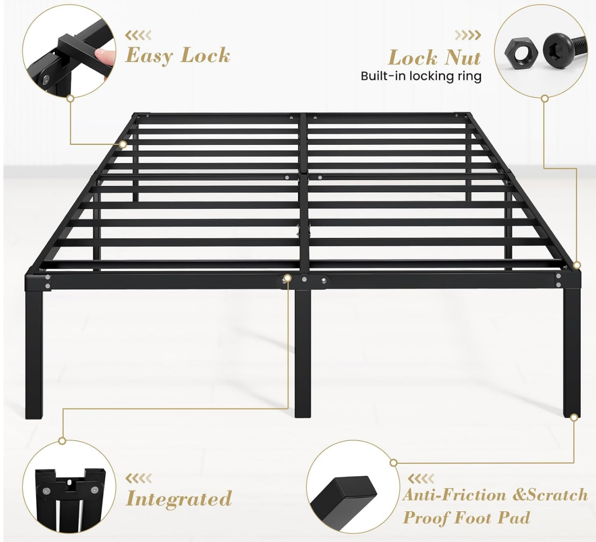
Image: Diagram illustrating the easy assembly features, including 'Easy Lock' and 'Lock Nut' mechanisms.

Video: An overview of the LEVELEVE bed frame assembly process, highlighting its ease of setup and sturdy construction.