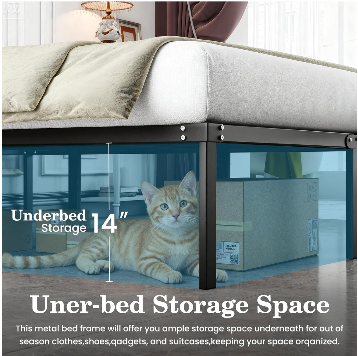
Image: The LEVELEVE bed frame demonstrating the 14-inch under-bed storage space, with a cat for scale.