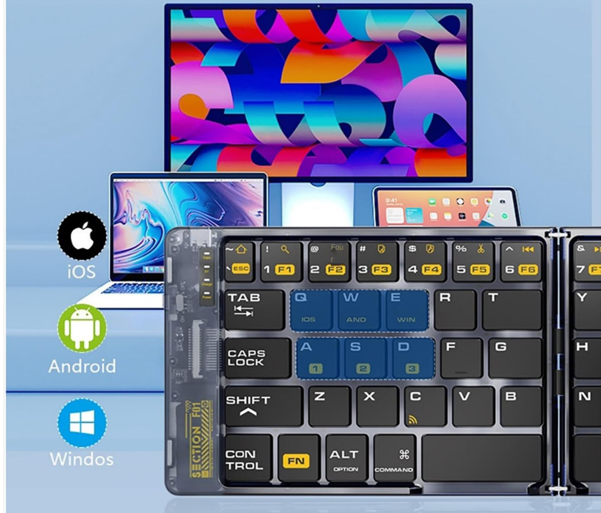
Image 4: Illustration showing the keyboard connected to an iOS device, an Android device, and a Windows device, demonstrating its multi-device switching capability.

Compatible with the whole system supports the simultaneous connection of three Bluetooth devices