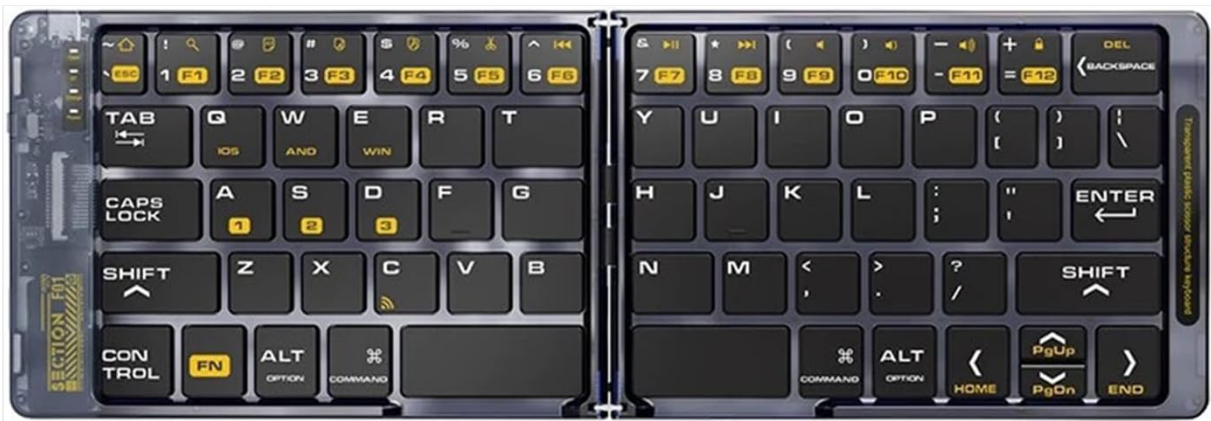
Image 1: The F69 Foldable Transparent Keyboard in its fully unfolded state, showcasing the key layout and transparent casing.