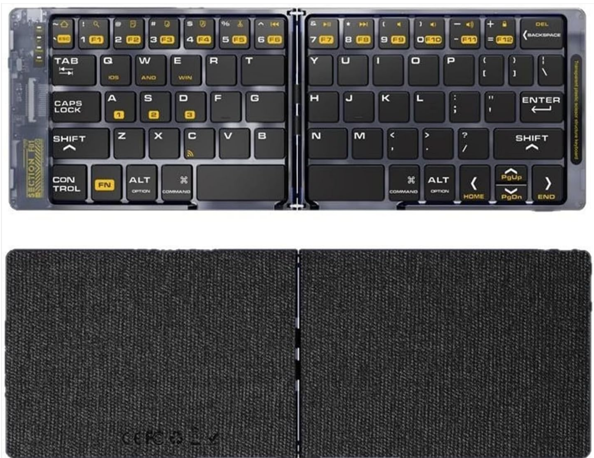
Image 2: The F69 Foldable Transparent Keyboard in its folded, compact state, showing the back panel with a textured surface.