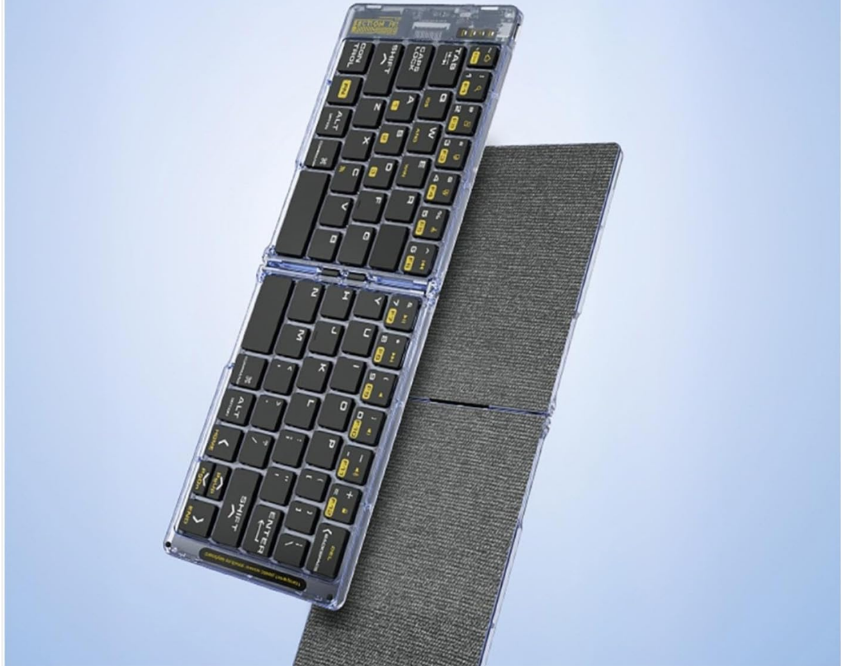
Image 3: An angled view of the keyboard partially folded, highlighting its transparent body and compact design.

Transparent body | Compact and portable | Anti-skid anti-scratch surface | Standard key cap