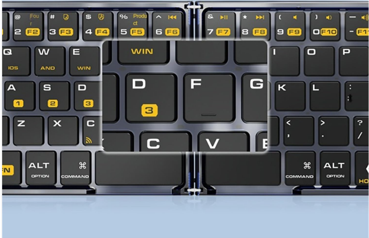
Image 5: A close-up view of the keyboard's square key caps, designed for a comfortable and responsive typing experience.

Short key stroke, feedback sensitive fast, quiet and more comfortable