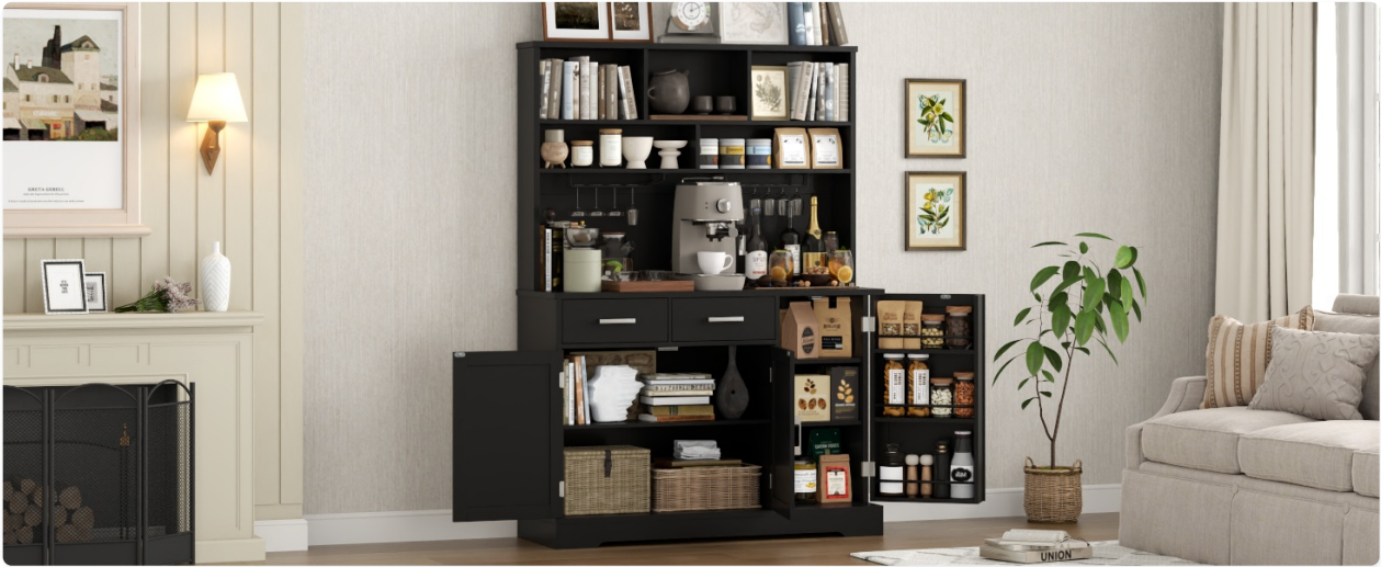
Figure 1: Overview of the Gyfimoie Tall Pantry Cabinet with key features labeled, including top cabinet, glass holders, spacious countertop, privacy drawers, door shelves, and bottom cabinet.