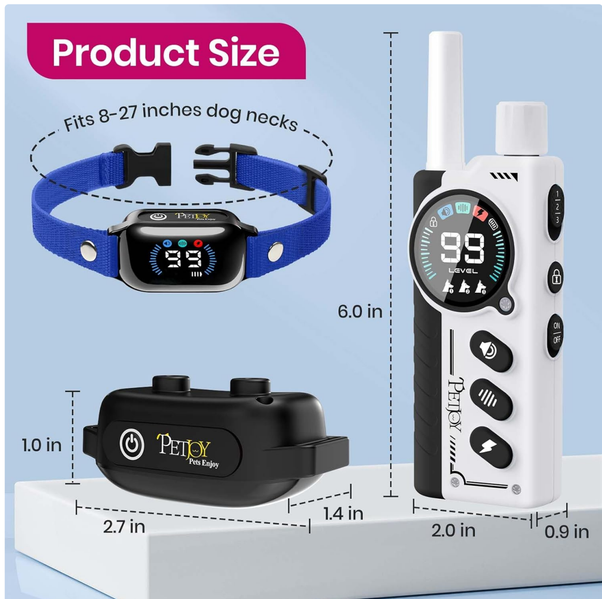
Image: Product size and collar fitting guide.

Proper fit of the receiver collar is crucial for effectiveness and your dog's comfort. The collar should fit snugly, allowing two fingers to slide between the strap and your dog's neck. Ensure the contact points touch the skin. The collar fits dog necks from 8 to 27 inches.