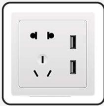
USB Power Strip