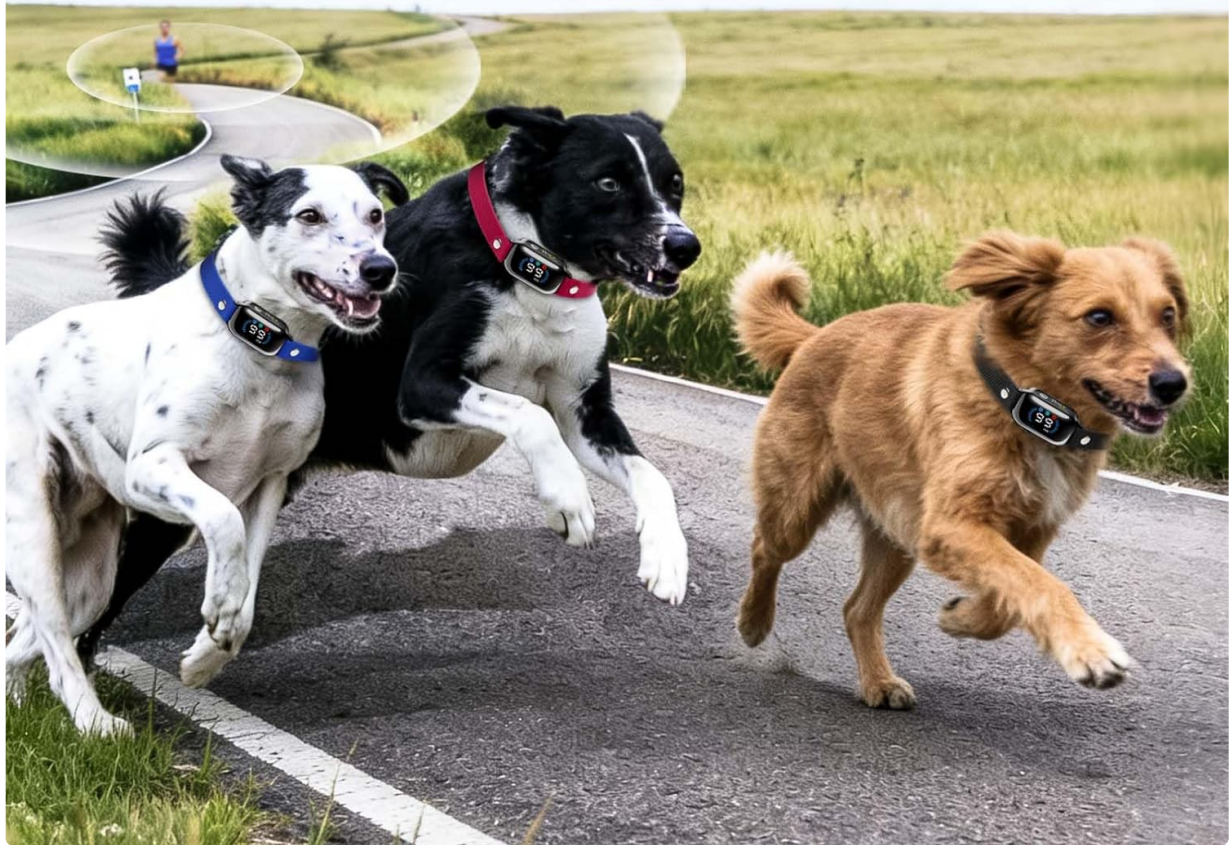
Image: The effective remote range of the training system.