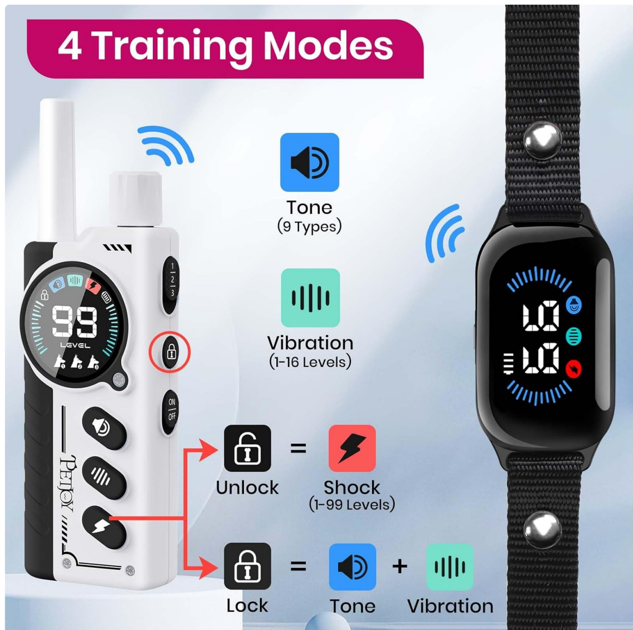
Image: Overview of the four available training modes and their intensity levels.

The PetJoy system offers four training modes: Tone, Vibration, and Shock. The Shock mode can be locked for safety.