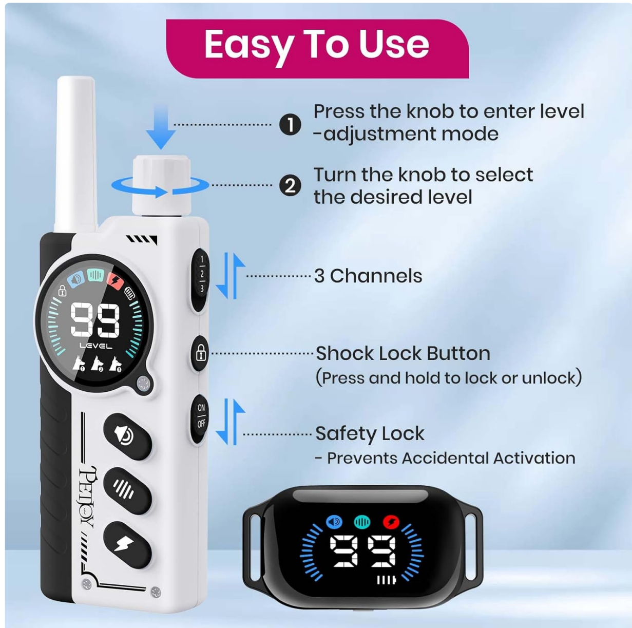
Image: Key features of the remote control for easy operation.

The remote is designed for intuitive operation with a 3-step knob adjustment and a physical slide safety lock.