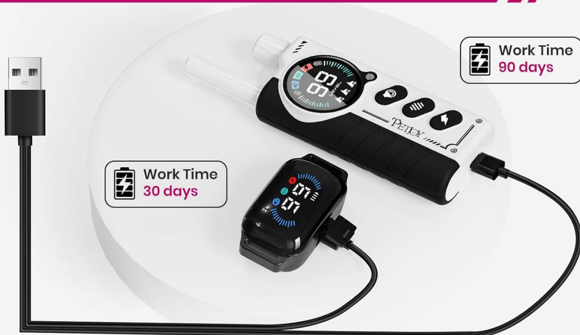
Image: Charging the remote and receiver collars, highlighting their extended battery life.

Charge Remote and Receiver at the same time