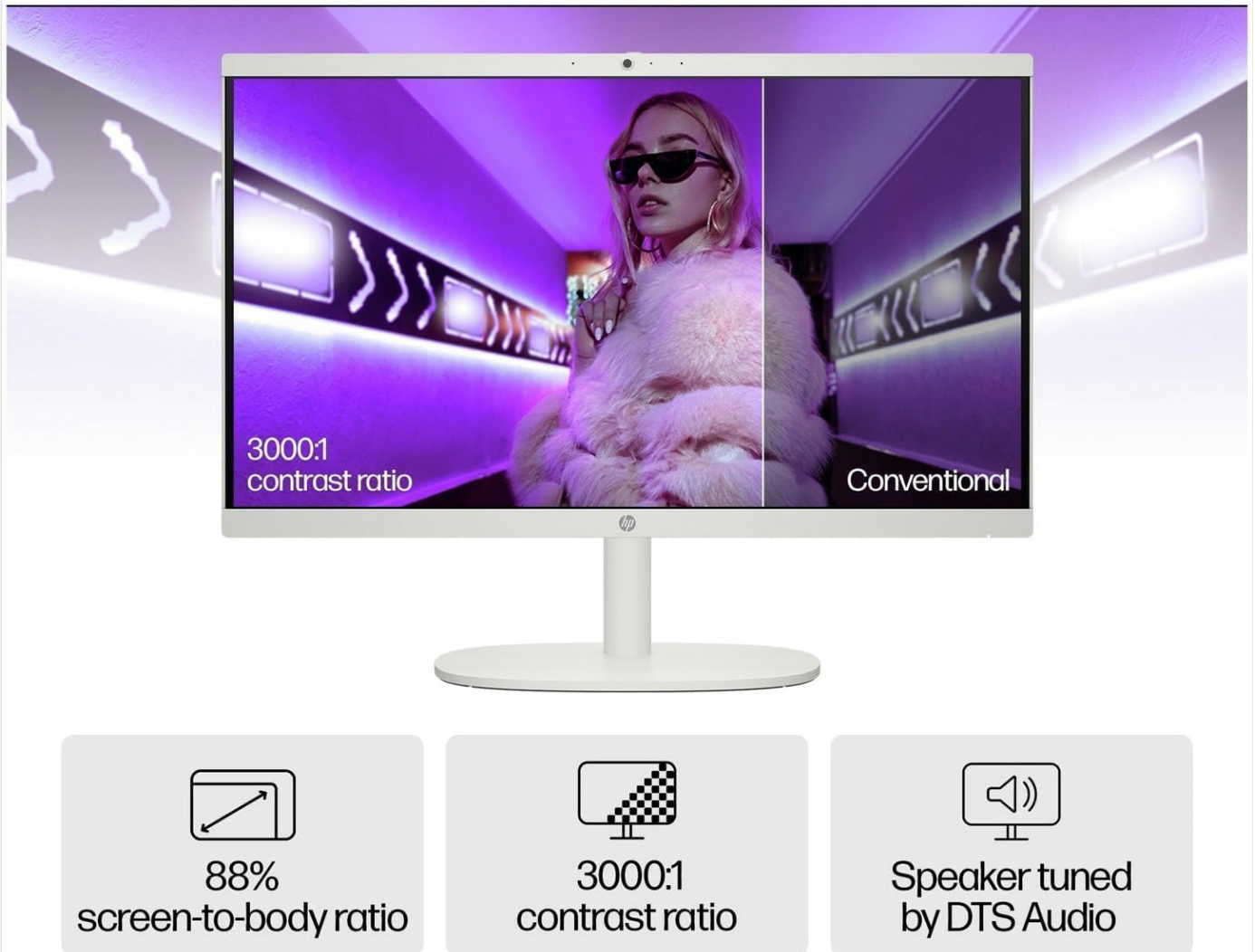
Figure 6: Display and Audio Enhancements