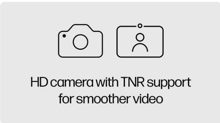
HD camera with TNR support for smoother video