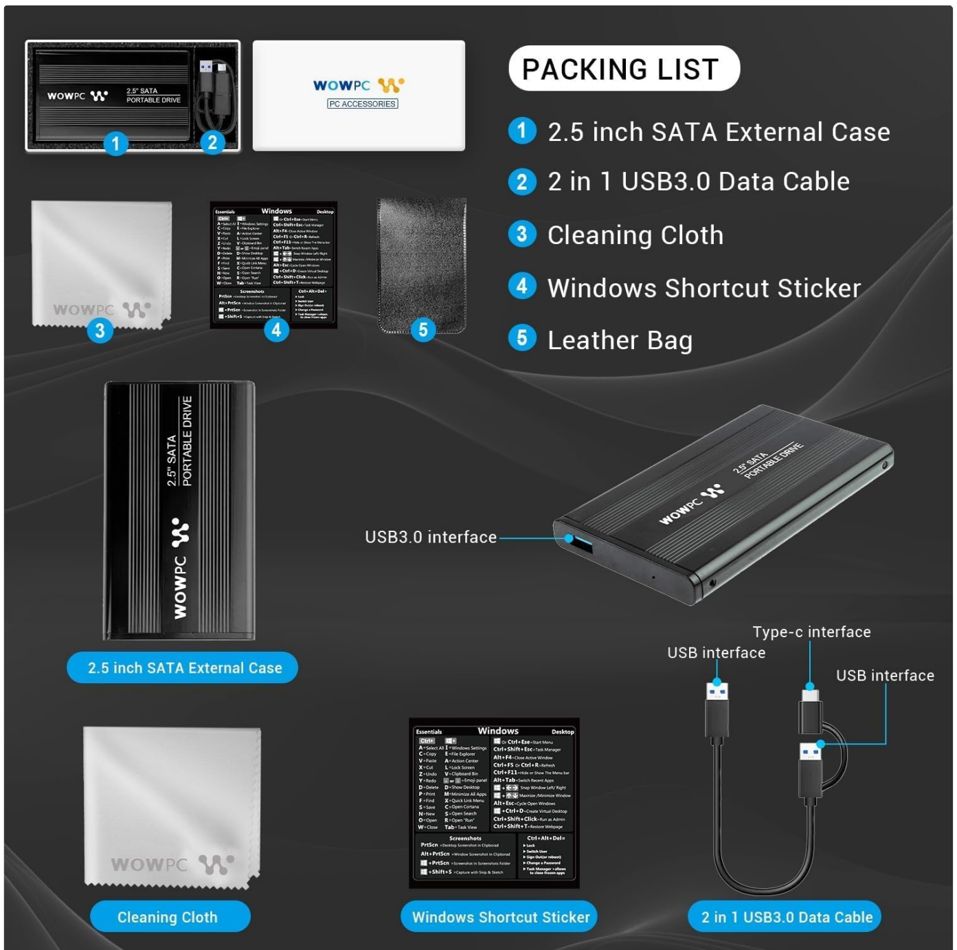
Figure 2: External Hard Drive Bundle Components