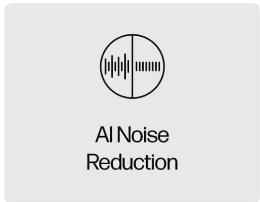
AI Noise Reduction