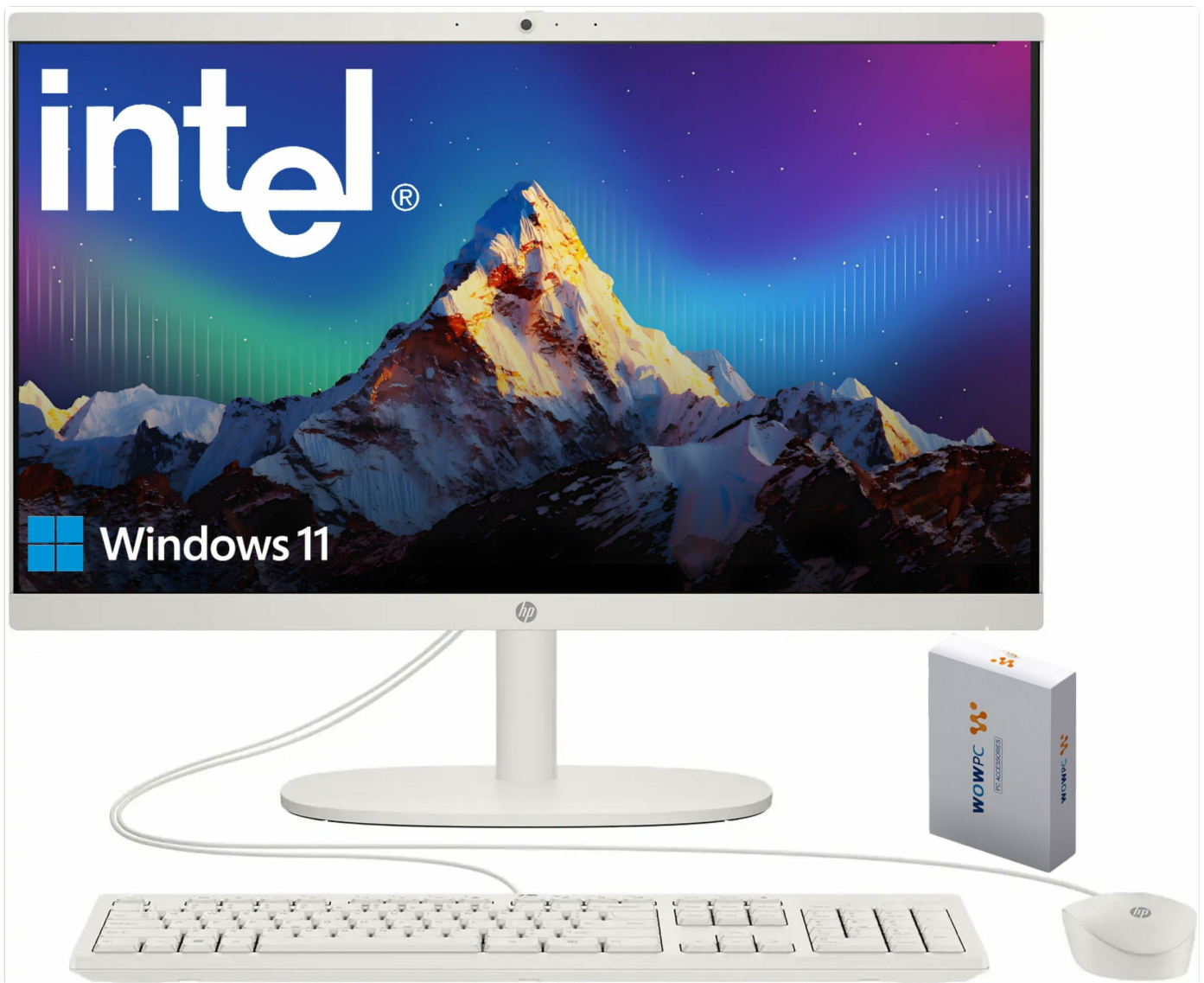
Figure 1: HP 2026 22" FHD All-in-One Desktop Computer