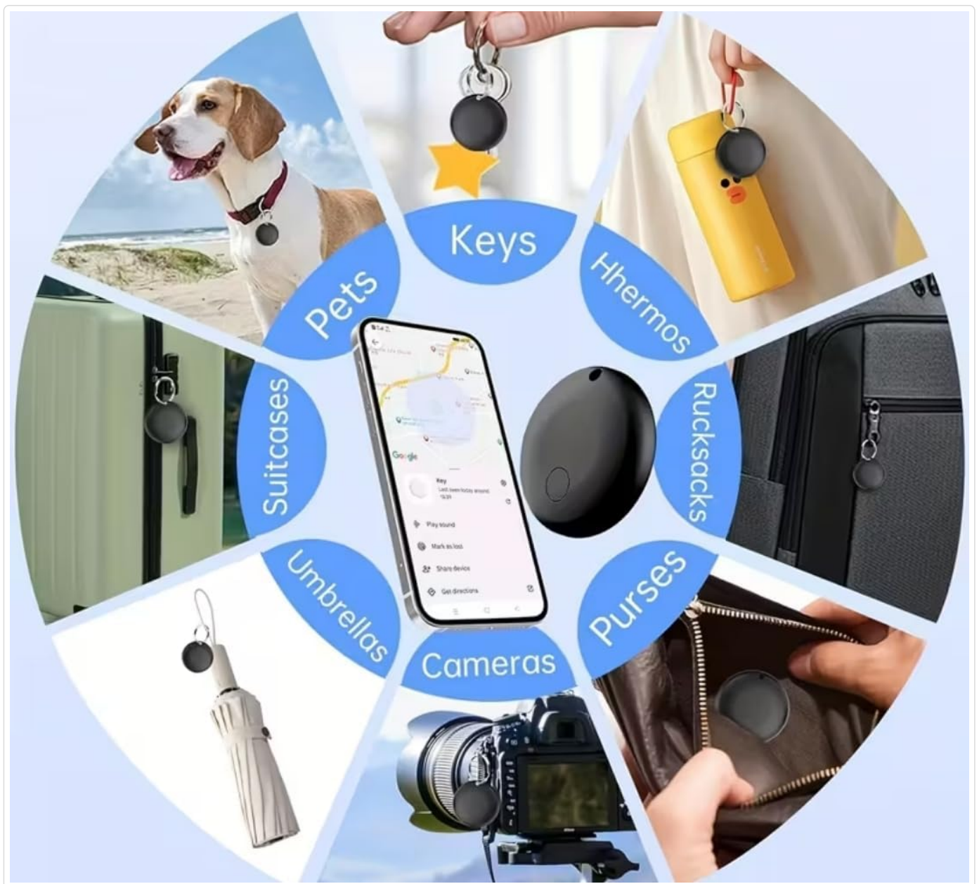
Image: A circular diagram illustrating multiple applications for the Otag device, such as tracking keys, pets, suitcases, umbrellas, cameras, purses, rucksacks, and thermoses.