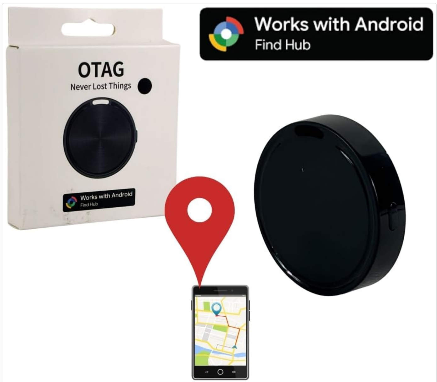
Image: The Otag device next to an Android phone displaying the "Find HUB" application interface with a map.