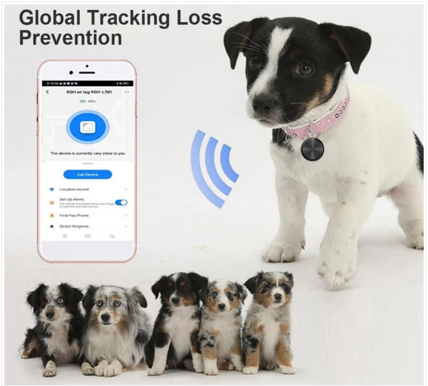
Image: An Otag device attached to a dog's collar, demonstrating its use for pet tracking, with a smartphone displaying the tracking application.