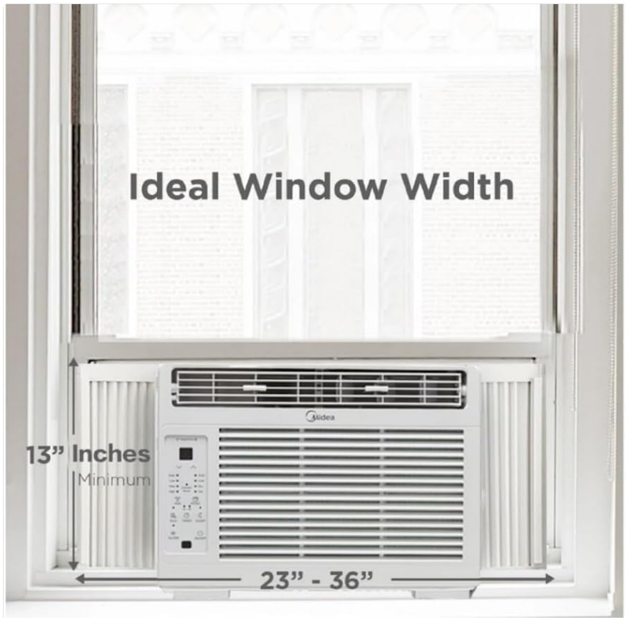
Image 2: Visual guide for window dimensions, indicating a minimum height of 13 inches and a width range of 23-36 inches for proper fit.