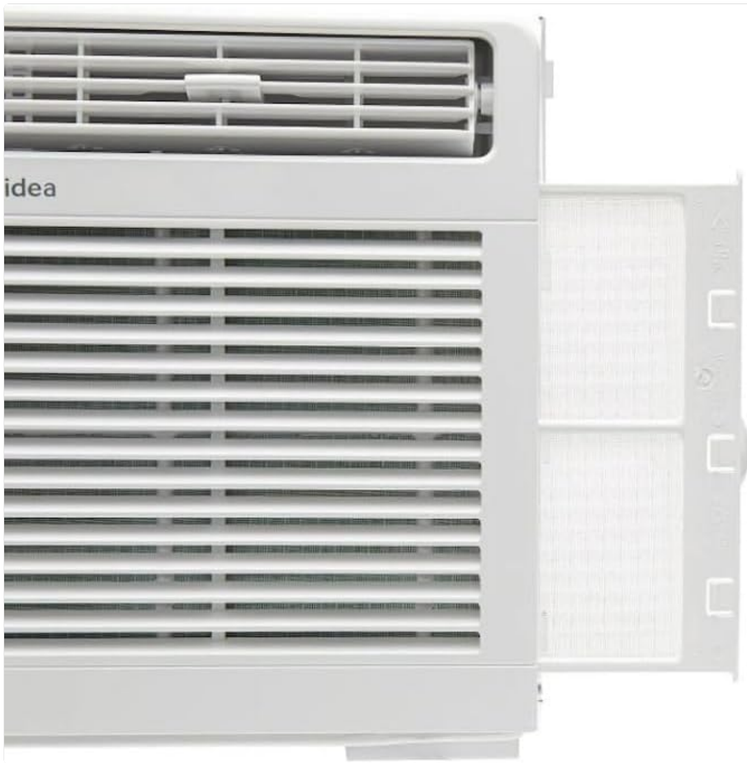
Image 5: The air filter is shown being easily slid out from the side of the unit for cleaning.