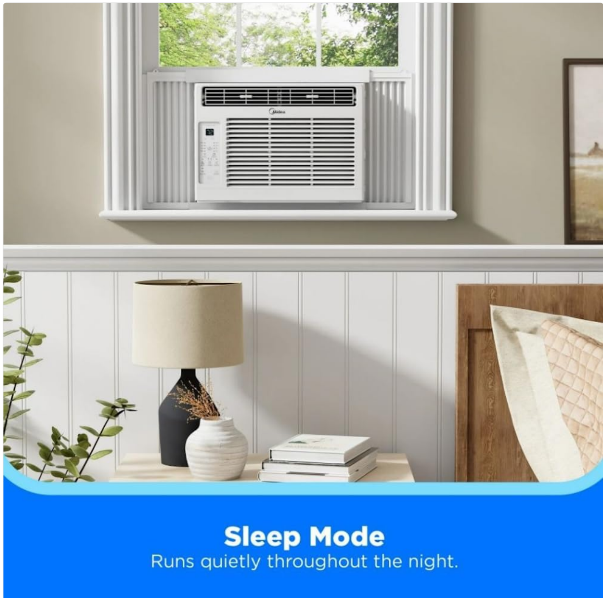
Image 1: Front view of the Midea 6,000 BTU Window Air Conditioner. The unit is white with a horizontal grille and a control panel on the left side.