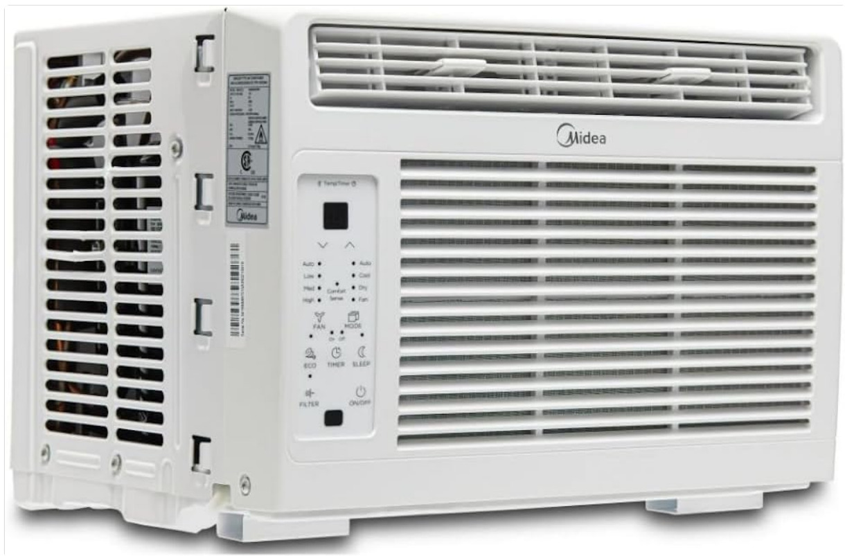
Image 3: Detailed view of the control panel, showing buttons for Fan, Mode, Delay, Temperature/Time adjustment, Filter Reset, and Power.