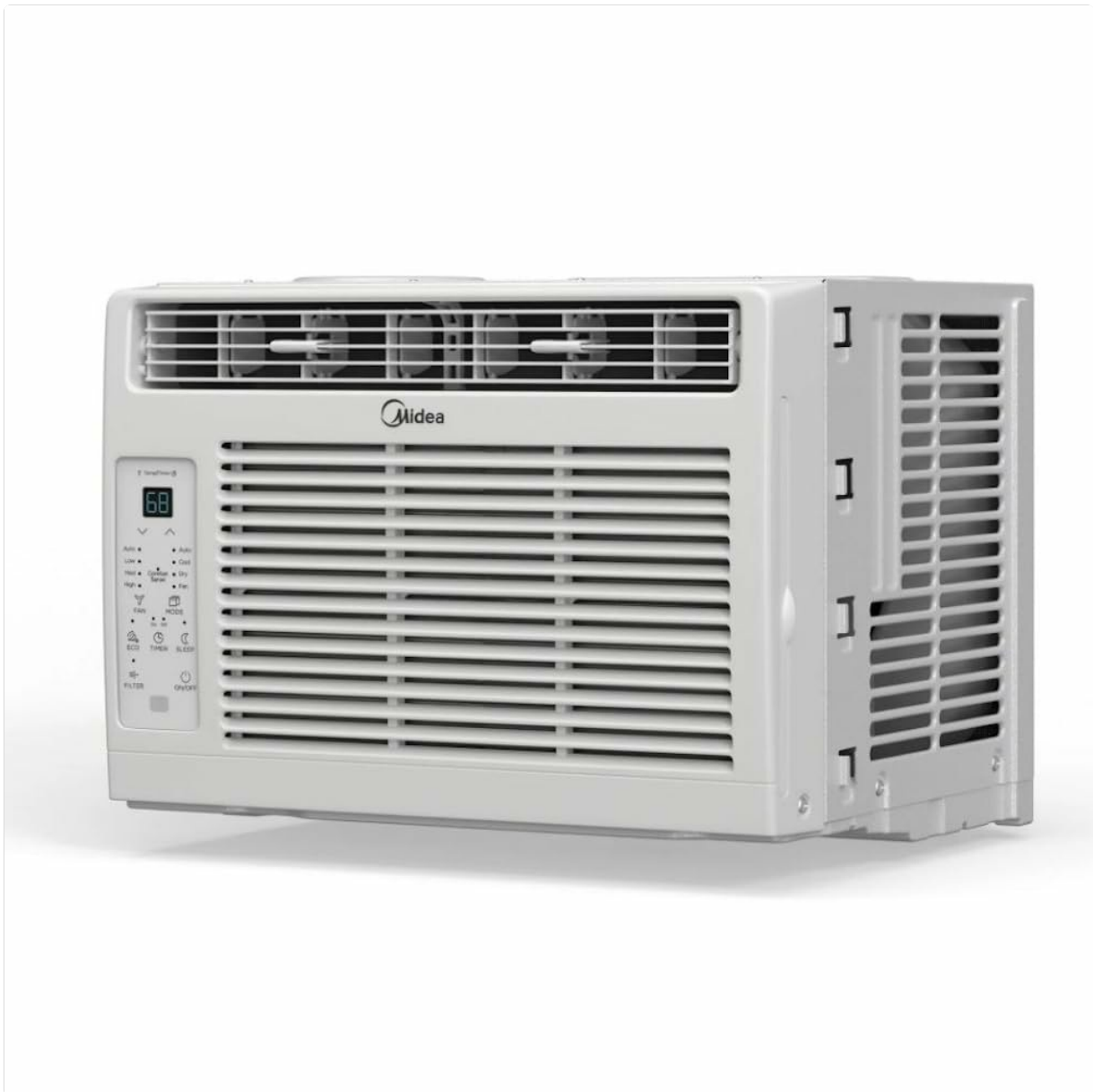
Image 4: The air conditioner unit with a digital display showing 'Sleep Mode' and text indicating quiet operation throughout the night.