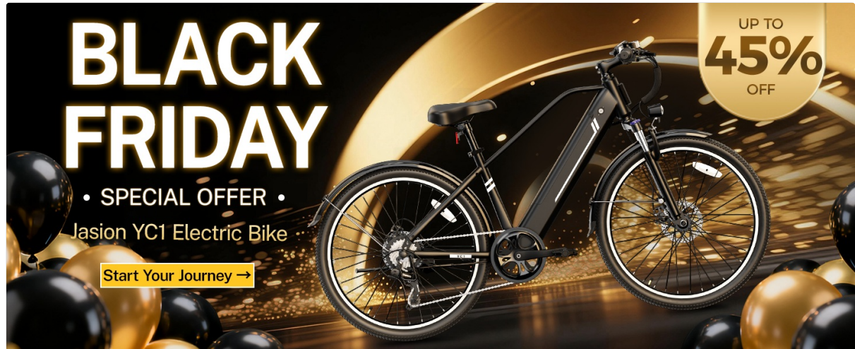
Image 7.1: Overview of Jasion YC1 key features and specifications.