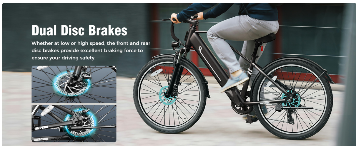
Image 4.3: Dual disc brakes provide efficient and precise stopping power.

The Jasion YC1 features dual disc brakes for reliable stopping power. Apply both brake levers simultaneously for optimal braking performance. The brake levers also cut off motor power when engaged.