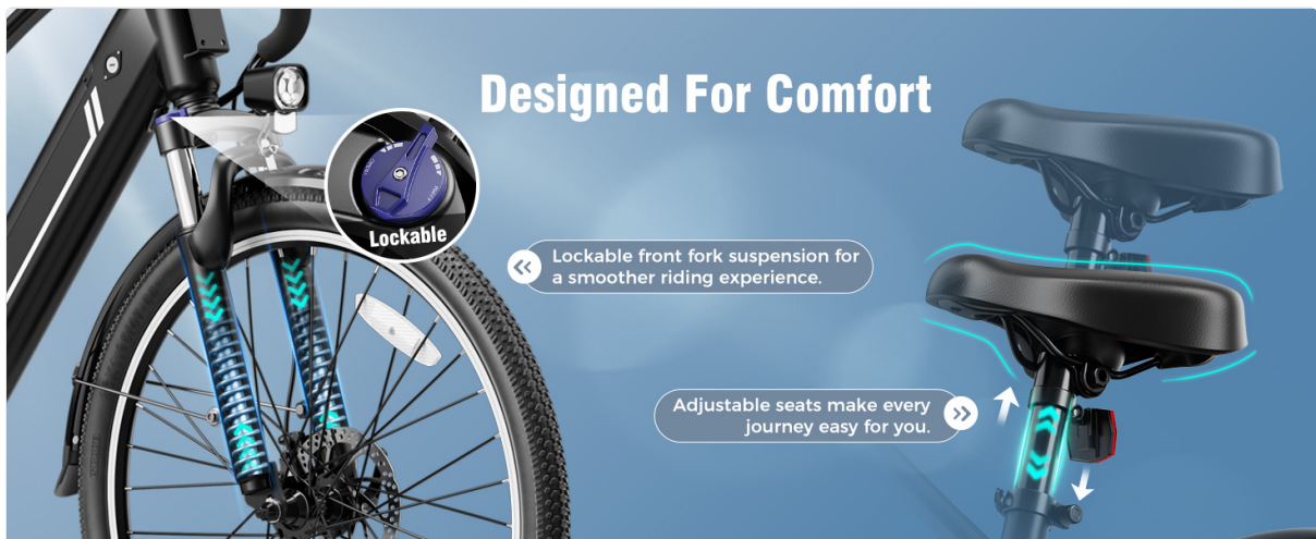
Image 4.5: Lockable front fork suspension provides a smoother riding experience on varied surfaces.

The front suspension fork features a lockout mechanism. Turn the blue knob on the top of the fork to lock or unlock the suspension. Locking the suspension provides a more rigid ride, suitable for smooth surfaces, while unlocking it absorbs shocks on uneven terrain.