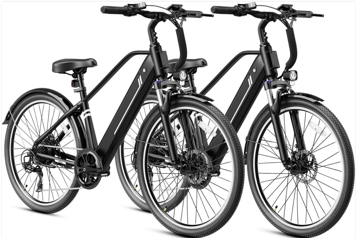
Image 1.1: The Jasion YC1 Electric Bike, showcasing its sleek design and integrated battery frame.

This manual provides essential information for the safe and efficient operation, maintenance, and care of your Jasion YC1 Electric Bike. Please read this manual thoroughly before your first ride and keep it for future reference. Understanding your e-bike's features and proper handling will ensure a safe and enjoyable experience.