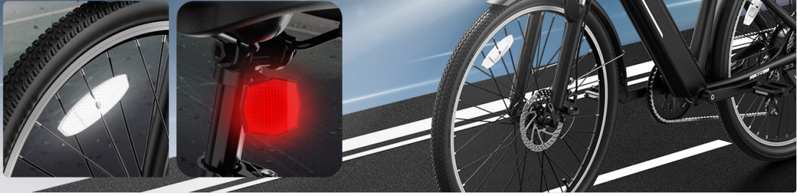
Image 4.4: LED lights and reflectors enhance visibility during day and night rides.

LED lights and 3 reflectors ensure that the road ahead is clearly illuminated no matter day or night, making sure you are very safe when riding at night.