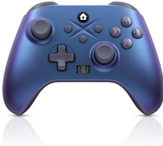
Image: An illustration emphasizing the need to upgrade the controller firmware for Xbox compatibility, providing a download link for the upgrade program.

It will continue to be compatible with Xbox devices after upgrading, and the upgrade can only be done on Windows PC. Upgrading is easy and only takes 2-3 minutes.