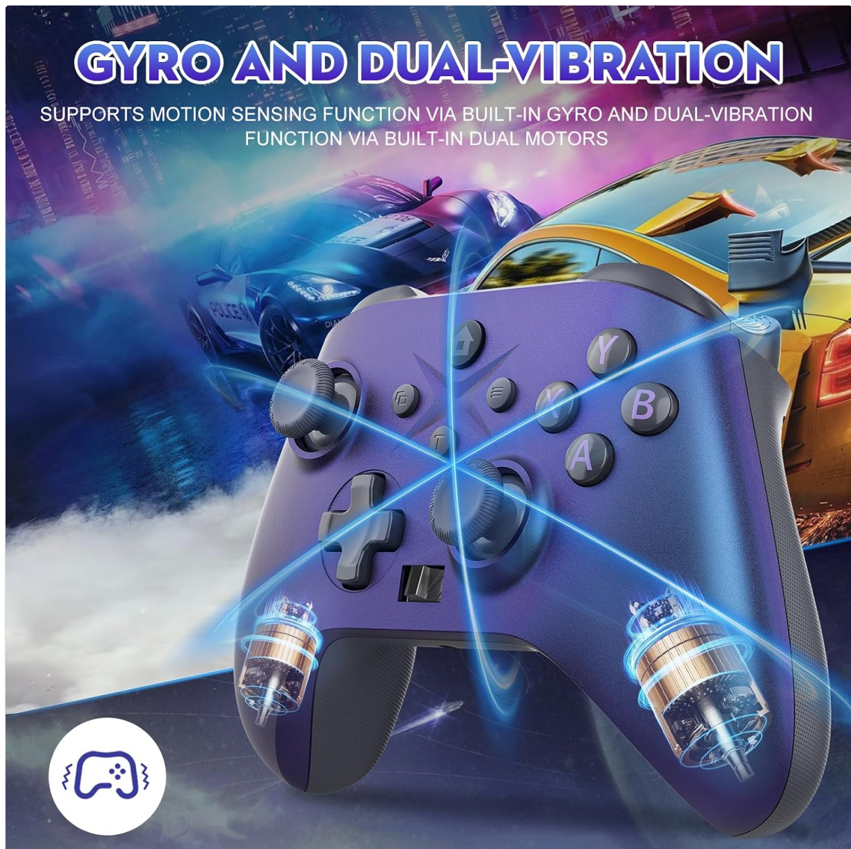
Image: An illustration detailing the Gyro and Dual-Vibration capabilities, showing internal motor components.