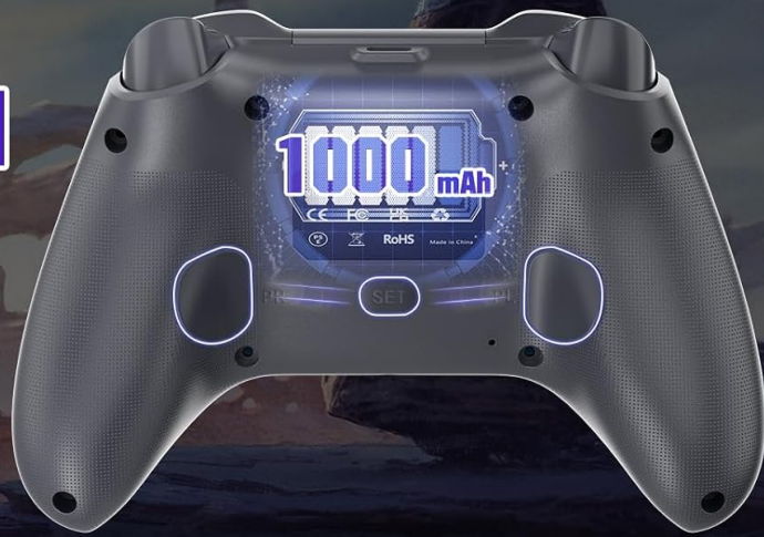
Image: A visual representation of the controller's wireless range (32 feet) and battery specifications, including 1000mAh capacity, 2.5 hours charging time, and 12-15 hours gaming time.