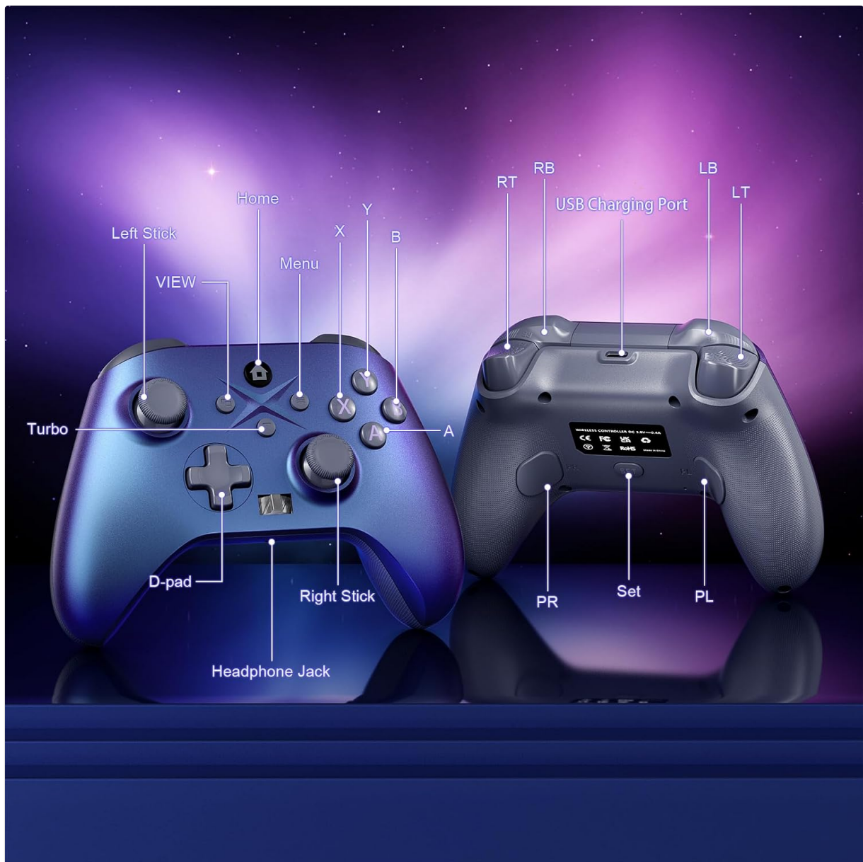
Image: A detailed diagram labeling the Left Stick, VIEW button, D-pad, Headphone Jack, Turbo button, Home button, Menu button, X, Y, A, B buttons, Right Stick, RB (Right Bumper), RT (Right Trigger), USB Charging Port, LB (Left Bumper), LT (Left Trigger), PR (Programmable Rear Left Button), Set button, and PL (Programmable Rear Right Button).