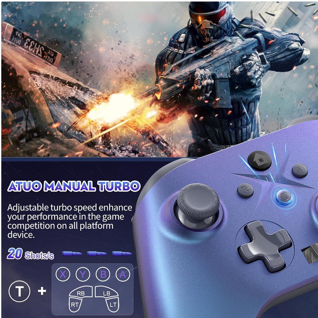
Image: A visual guide to activating the manual Turbo function, showing the 'T' button combined with action buttons and an example of 20 shots/s.