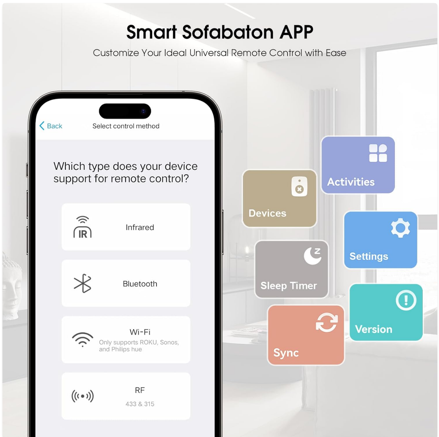
Figure 4: SofaBaton App for Smart Customization. This image shows the SofaBaton companion app interface, demonstrating options for selecting control methods (IR, Bluetooth, Wi-Fi, RF) and customizing device settings.