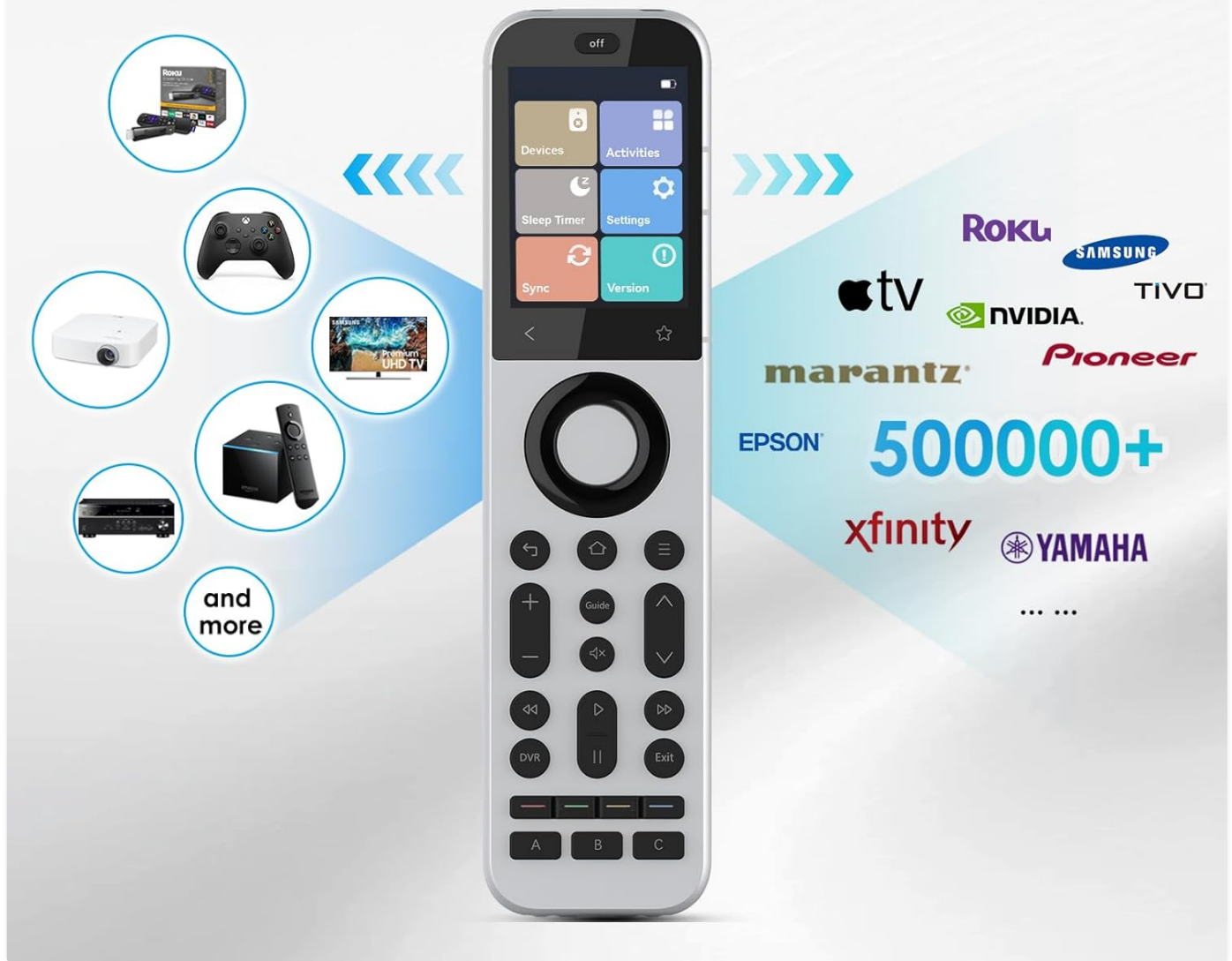
Figure 1: SofaBaton X2 Universal Remote Control and Hub.

Seamless Works with over 500,000 Home Entertainment Devices over 6,000 Brands