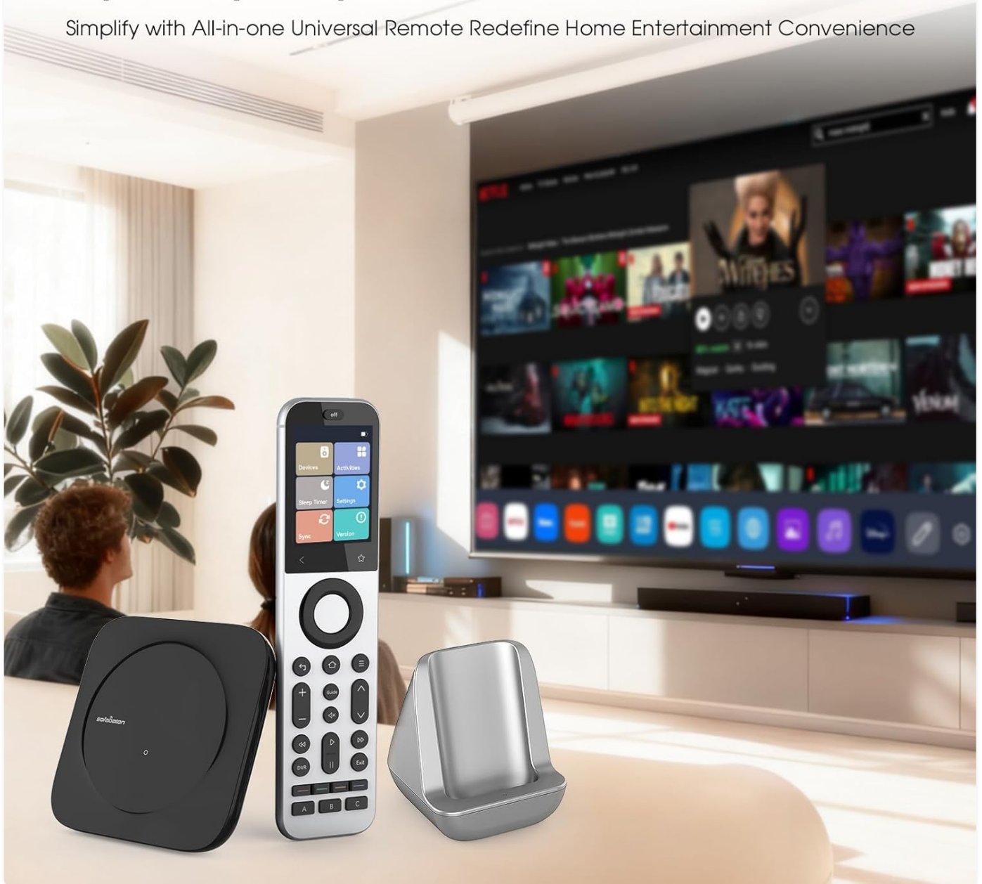
Figure 6: SofaBaton X2 Smart Voice Control. This image depicts the SofaBaton X2's compatibility with voice assistants like Alexa and Google Assistant, enabling hands-free control of smart home devices.

Simplify with All-in-one Universal Remote Redefine Home Entertainment Convenience