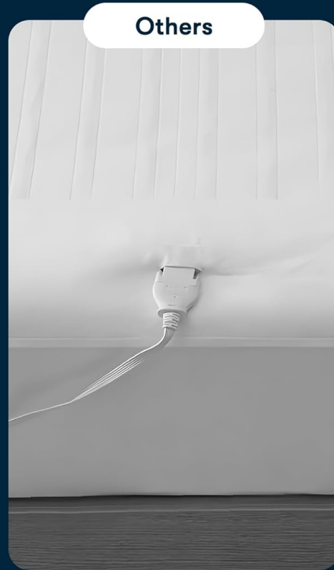
Figure 1: The Serta mattress pad features a discreet connection port designed to tuck beneath the mattress, ensuring a smooth sleeping surface. This contrasts with other designs where the connector may be visible on top of the mattress.