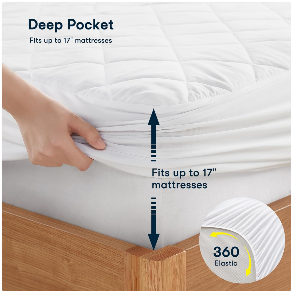
Figure 2: The 15-inch deep pocket design with 360° elastic ensures the mattress pad fits securely on most mattresses up to 17 inches high.