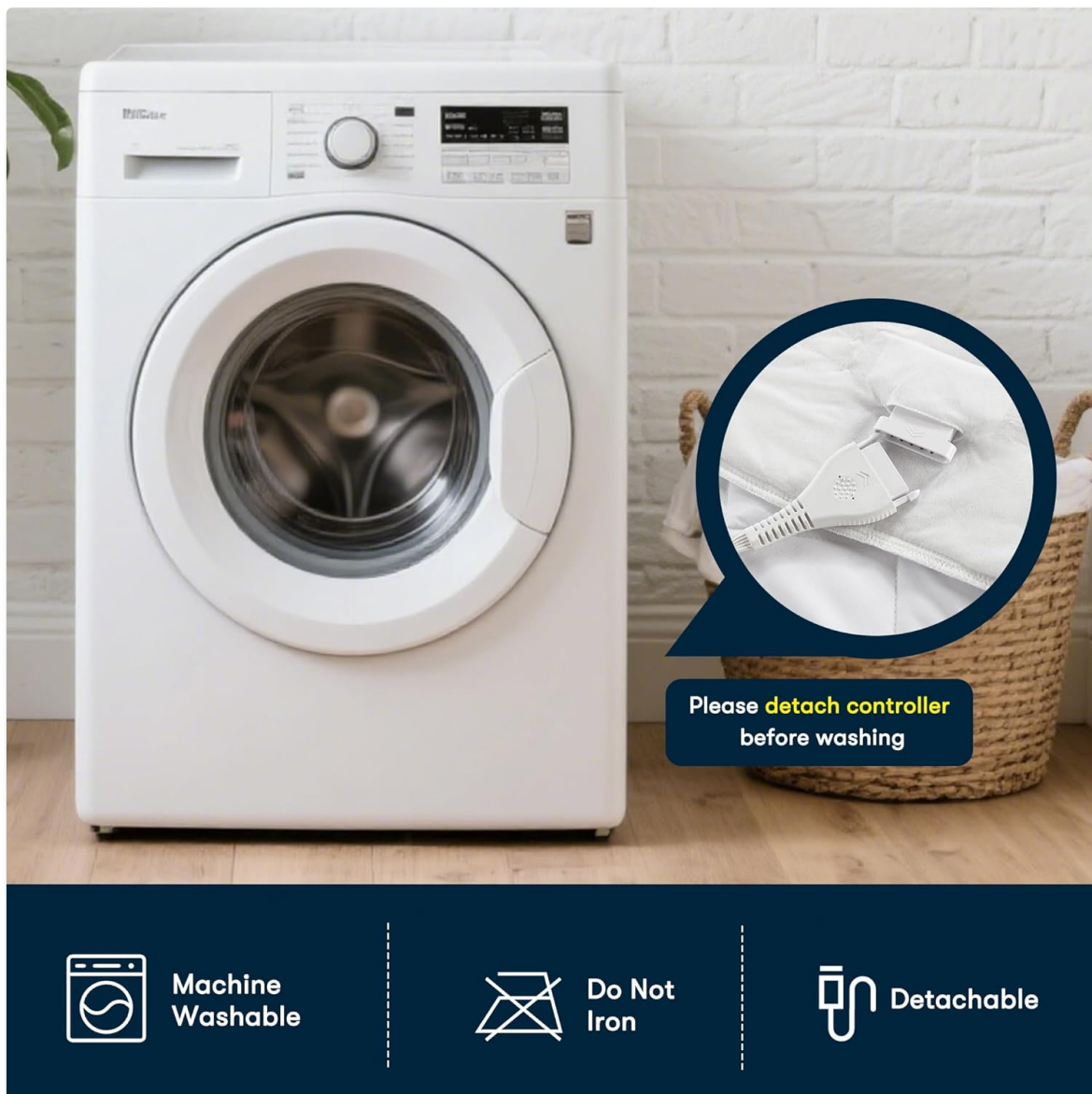
Figure 5: The mattress pad is machine washable, but the controller must be detached before washing.