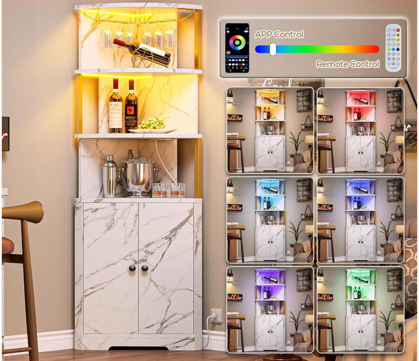
Figure 3: Illustration of the multicolor adjustable LED light strip and its control methods.