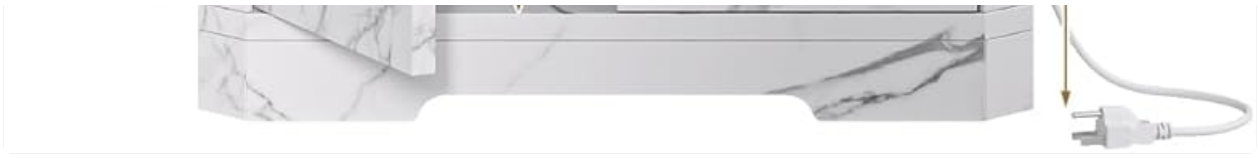
Figure 2: Product dimensions for planning placement and assembly.