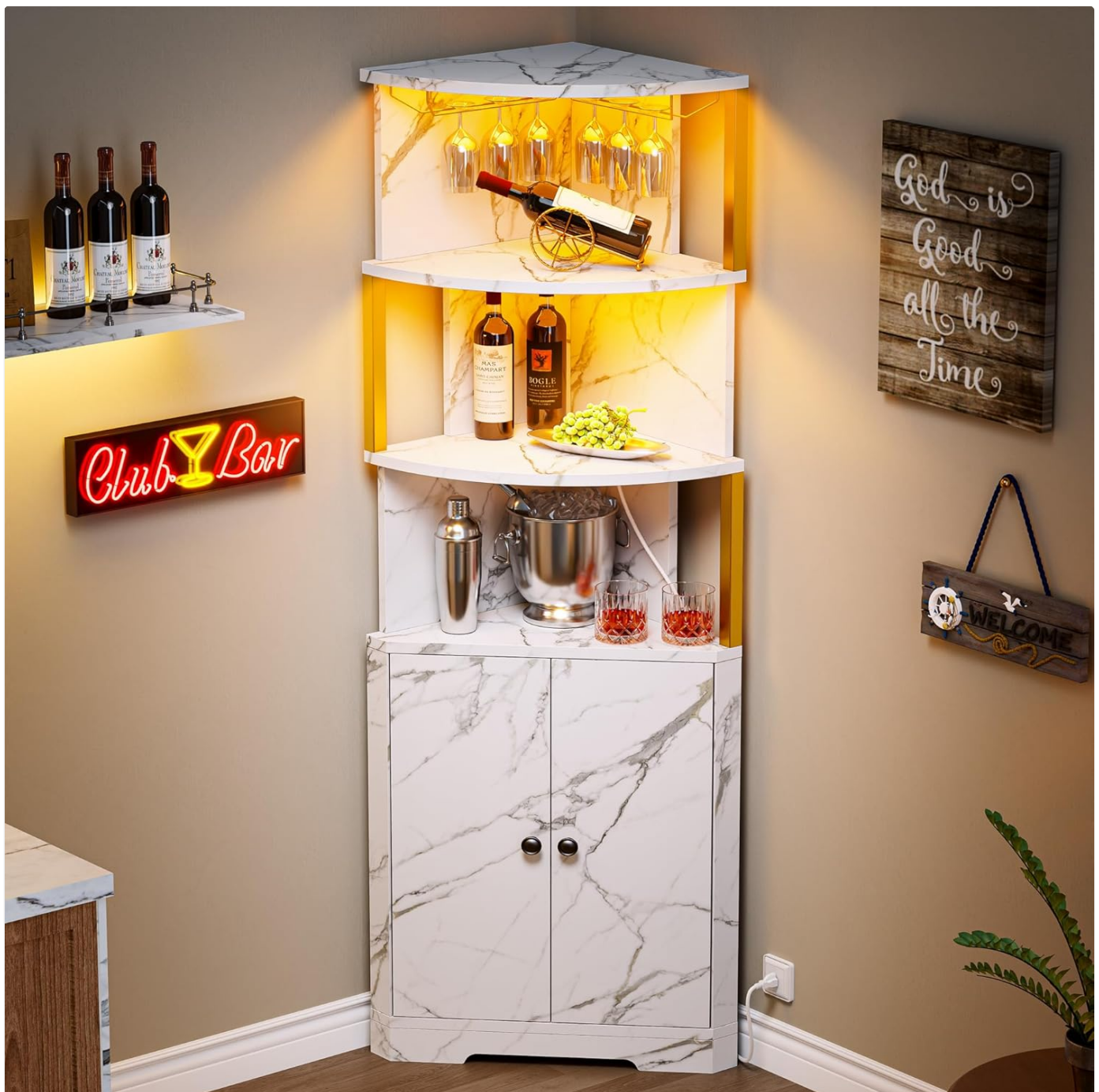
Figure 1: Front view of the IRONCK 71-inch Corner Bar Cabinet, showcasing its design and features.