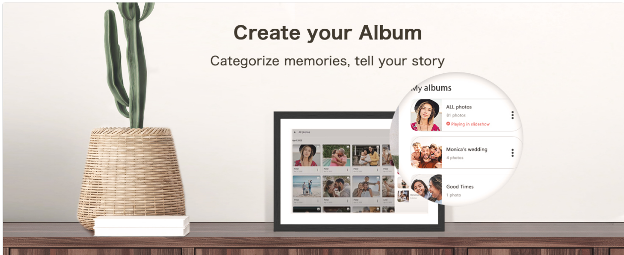
Image: The digital frame screen shows an 'Album' option, allowing users to categorize and organize their memories.

The touch screen interface allows for easy management of your media.