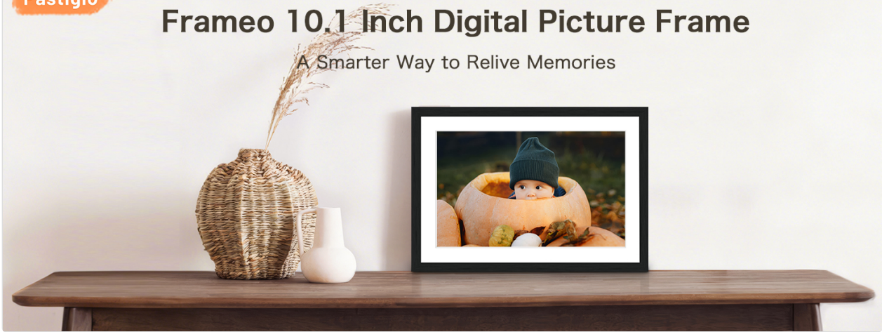
Image: Pastigio 10.1 Inch Frameo Digital Picture Frame highlighting its 10.1" large display, Frameo reliable app, 32GB built-in storage, and 800P HD touchscreen.