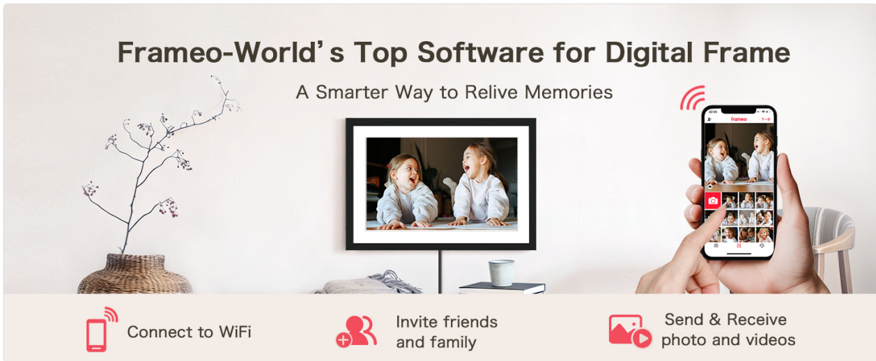
Image: The Frameo app on a smartphone is shown connected to a digital frame, illustrating the ease of sharing photos and videos instantly.

The Frameo app allows you to send photos and 15-second videos directly to your frame from anywhere with a Wi-Fi connection.