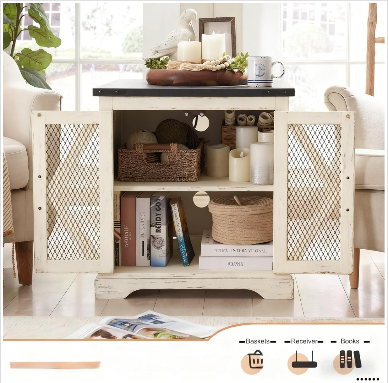
Image: The interior of the end table's storage compartment with the barn doors open, revealing an adjustable shelf. Various items like books, baskets, and blankets are neatly stored, demonstrating the practical storage capacity.