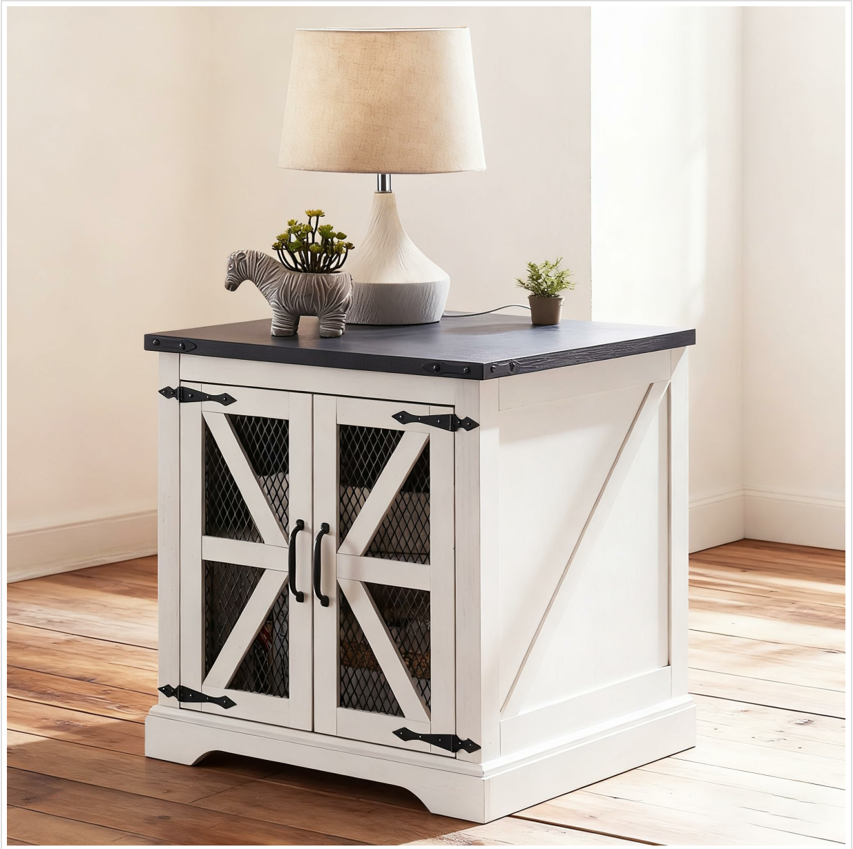
Image: Front view of the JXQTLINGMU Farmhouse End Table, highlighting its 24-inch width, 25-inch height, and weight capacities for the tabletop (110 lbs) and overall structure (235 lbs). The image also shows the mesh barn doors and the black top surface.