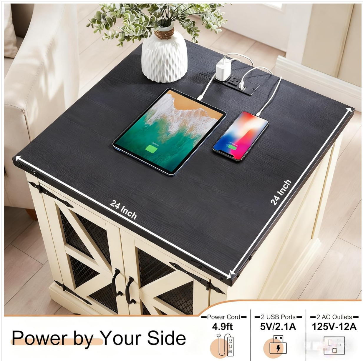
Image: A close-up top view of the end table, illustrating the integrated charging station with two AC outlets and two USB ports. A tablet and a smartphone are shown connected and charging, demonstrating the functionality.

The end table is equipped with a convenient charging station located on the top panel. This station includes two AC outlets and two USB ports (5V/2.1A) for powering and charging your electronic devices. The power cord is approximately 4.9 feet long.