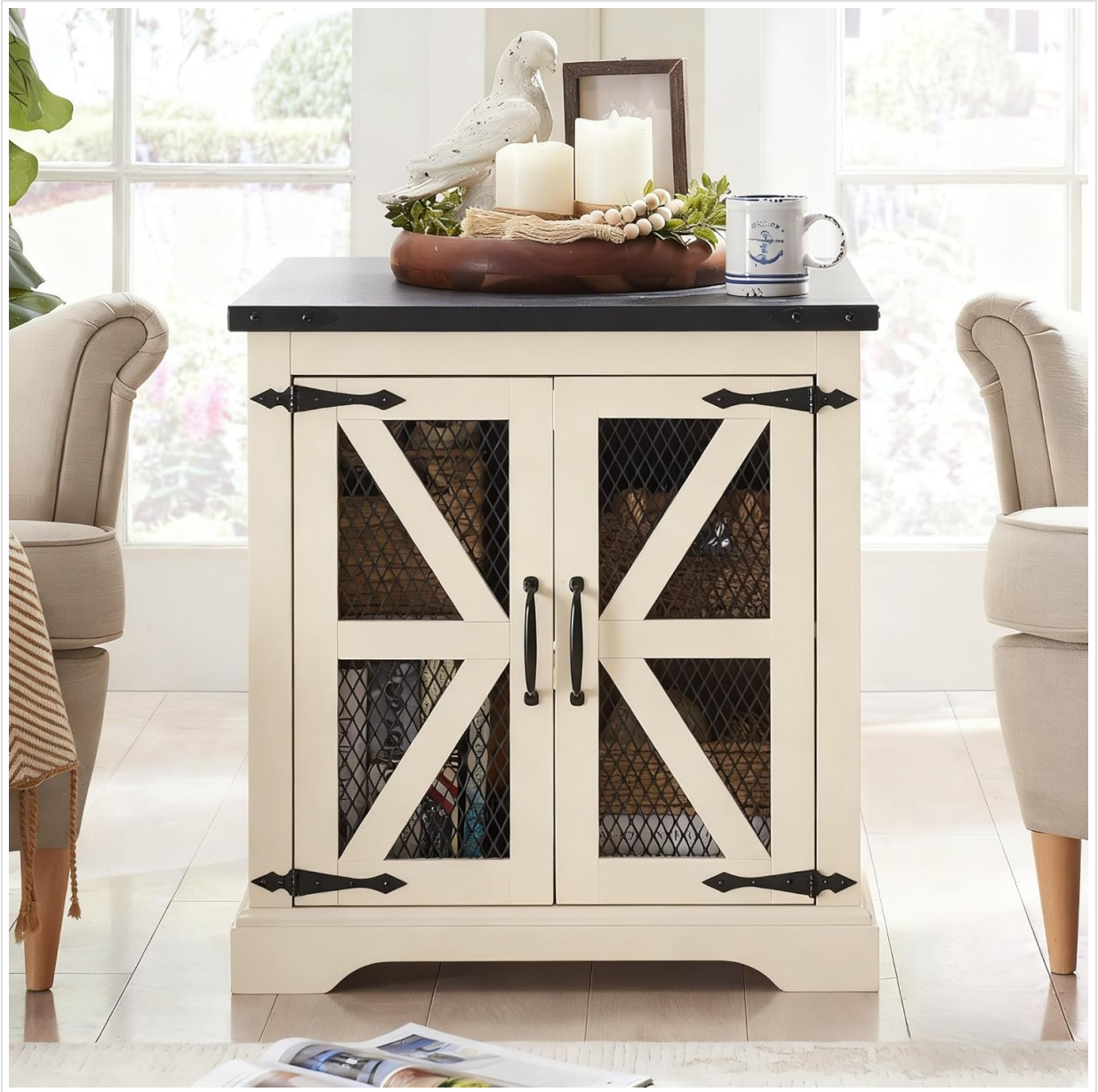
Image: The JXQTLINGMU Farmhouse End Table positioned between two armchairs in a living room, showcasing its aesthetic appeal and how it fits into a home environment. The table top is decorated with candles and a plant.