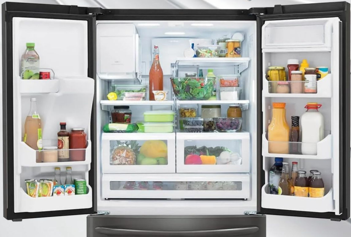
Image showing the water inlet valve in context with a refrigerator, highlighting its compatibility with Frigidaire models and listing various replacement part numbers.